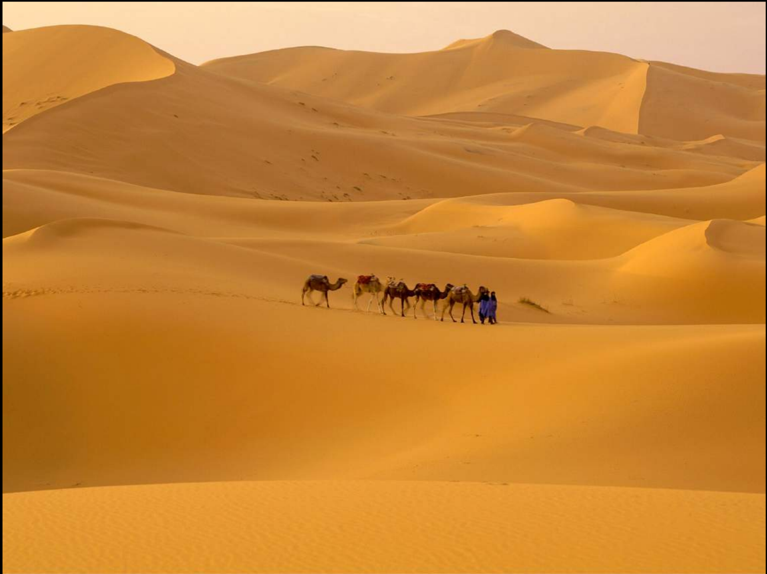
Sahara, Northern Africa