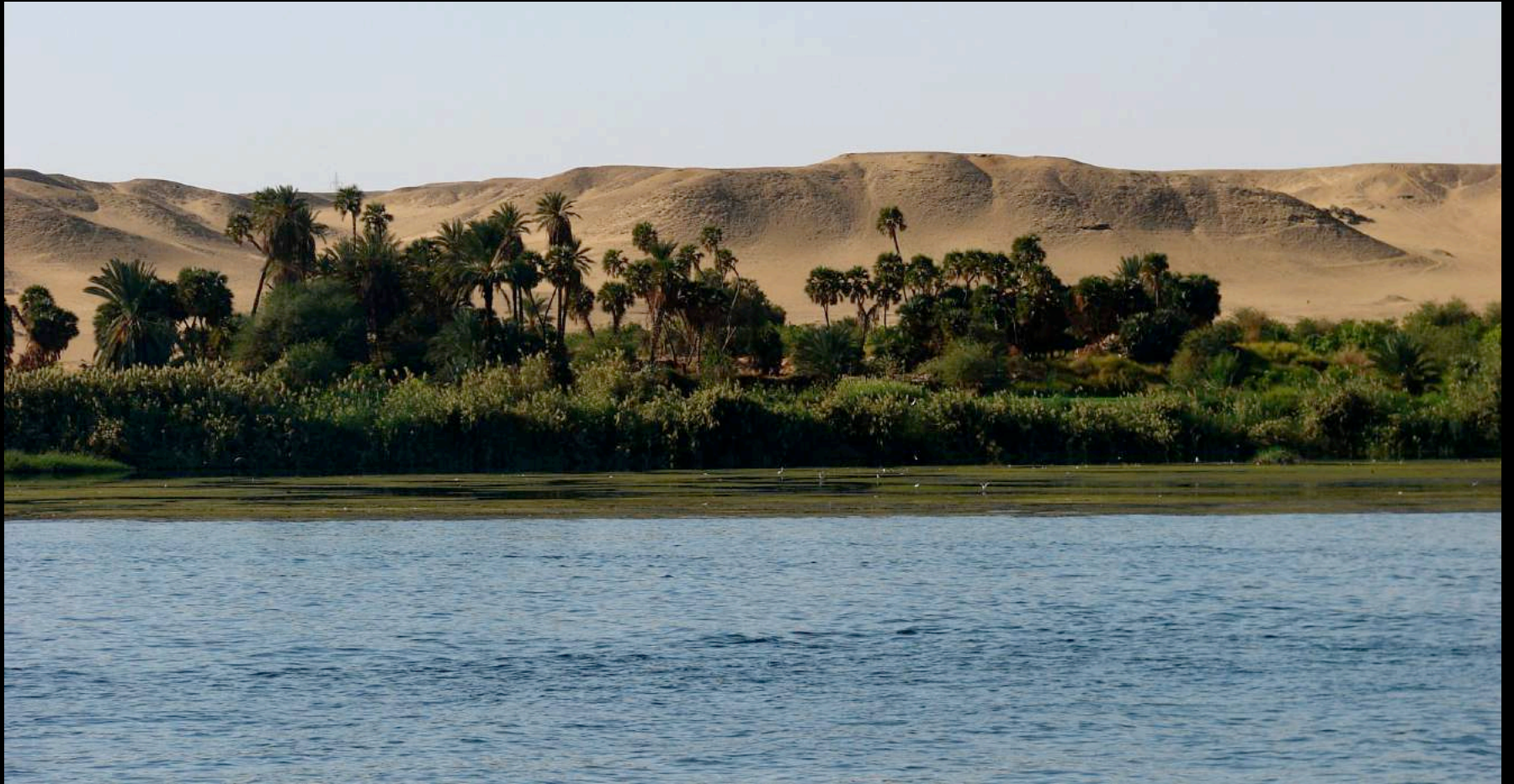
Nile River, Egypt, Ethiopia, Sudan, South Sudan, Uganda, Burundi