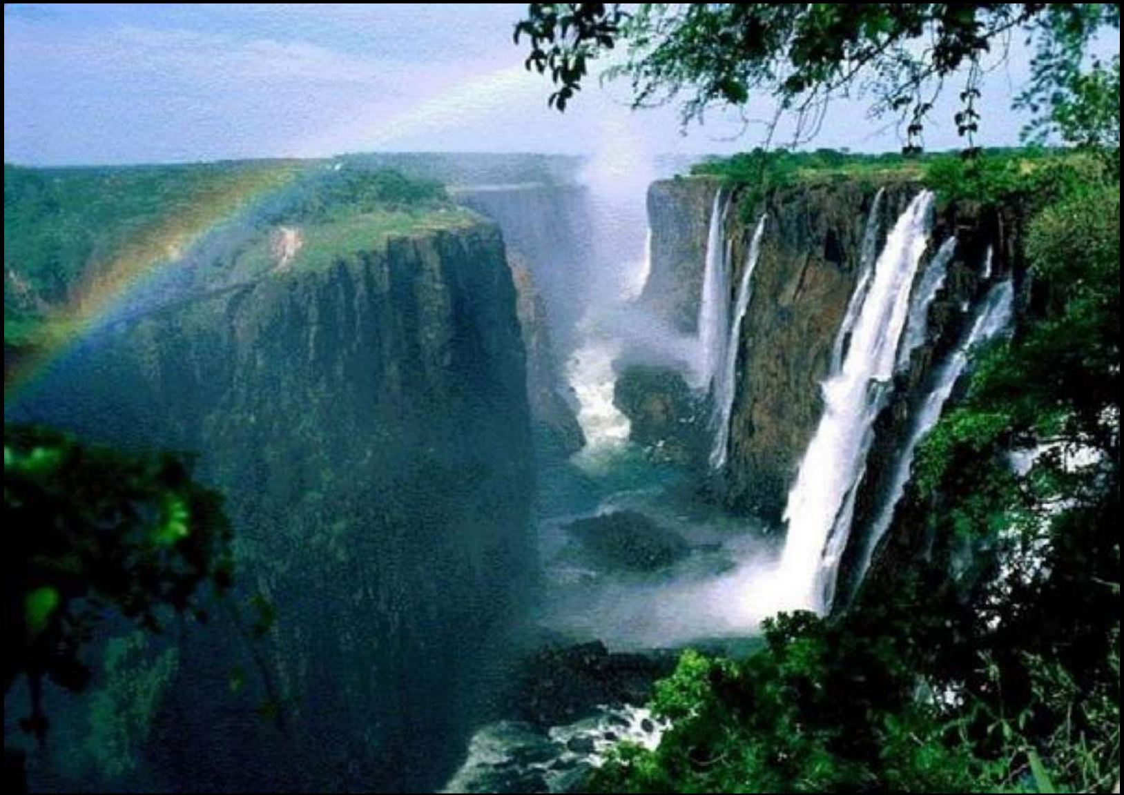
Victoria Falls, Zimbabwe