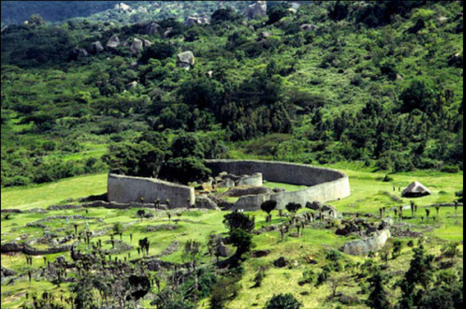
Great Zimbabwe Ruins