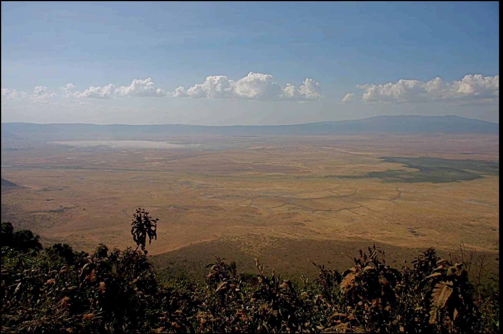
Ngorongoro Crater, Tanzania