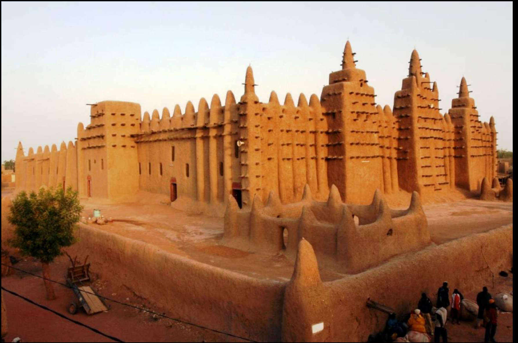
Mosques of Timbuktu