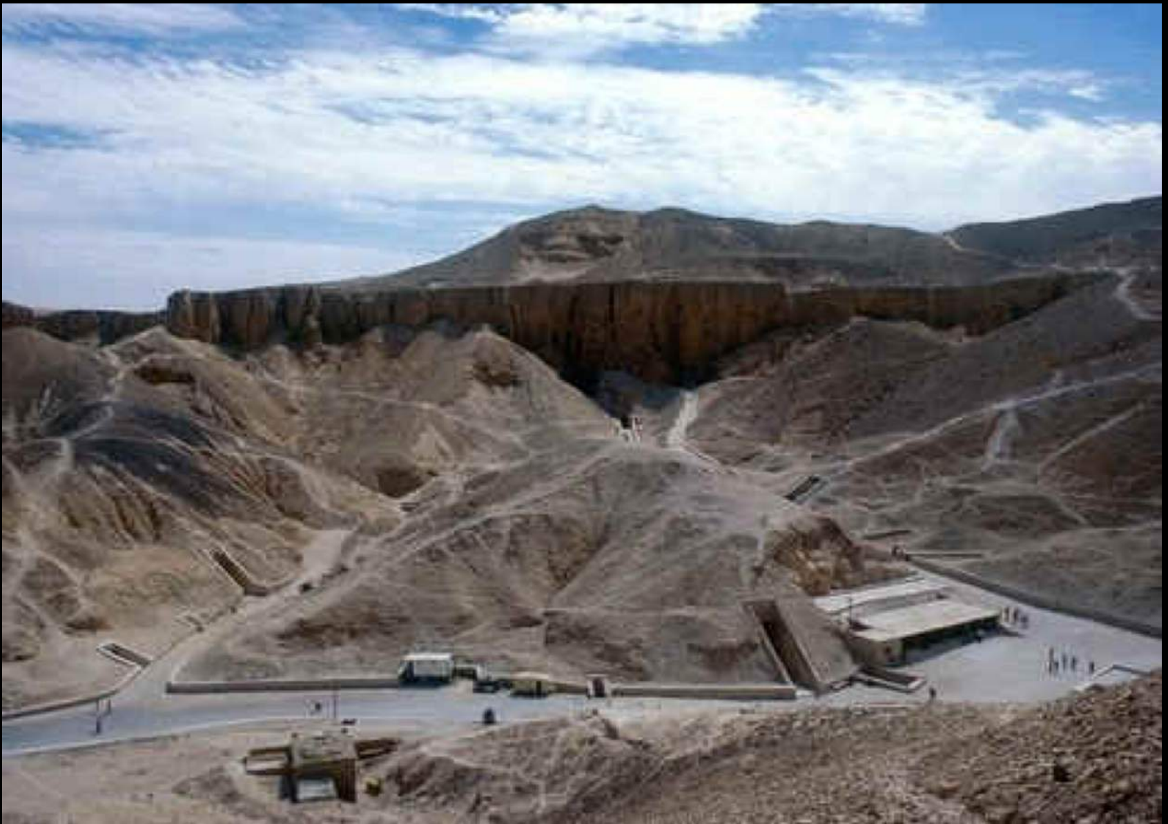
Valley of the Kings