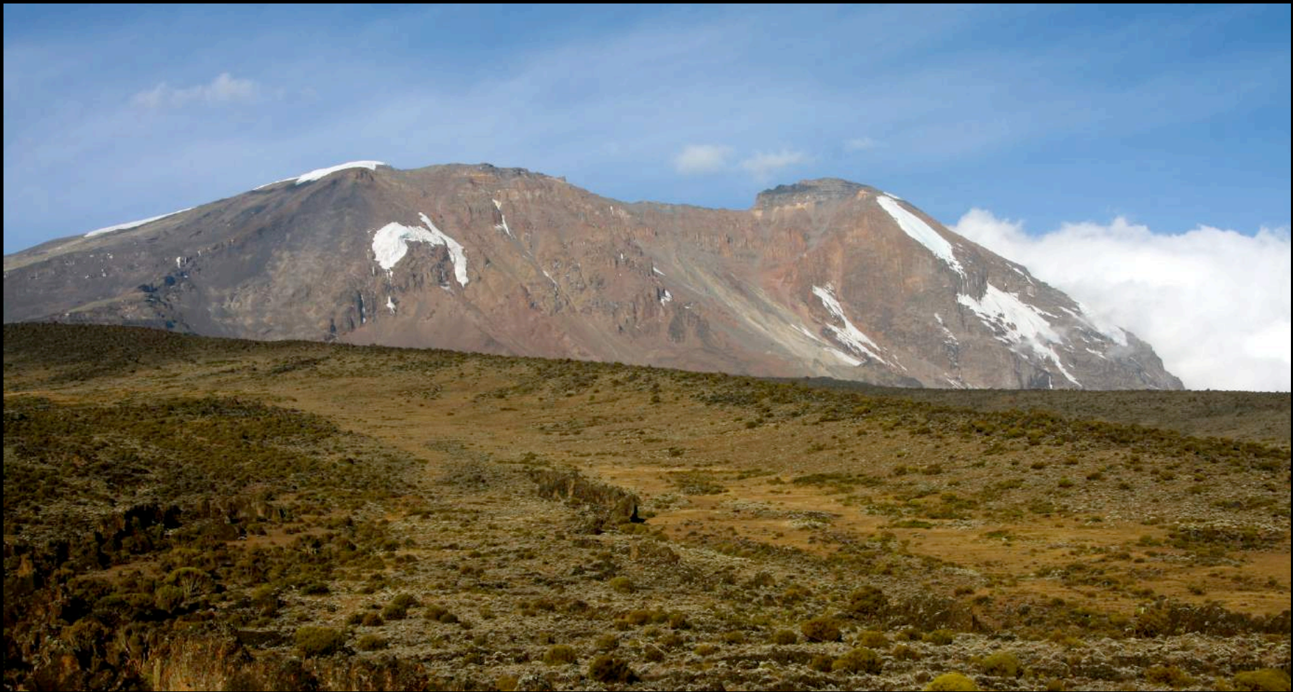
Mt. Kilimanjaro, Tanzania