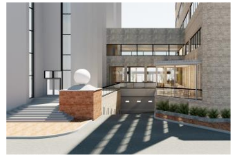
2 Monument Square - Portland