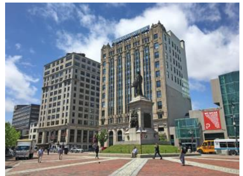
465 Congress Street - Portland