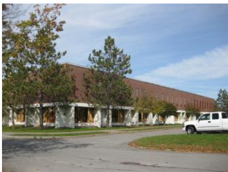
One Davis Farm Road - Portland