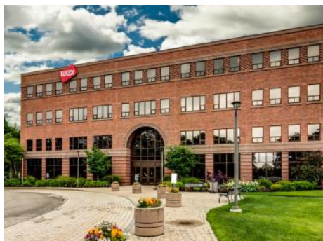
225 Gorham Rd—South Portland