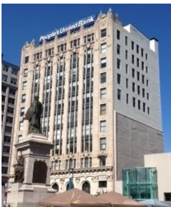
465 Congress Street - Portland