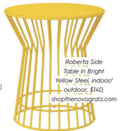
Roberta Side Table in Bright Yellow Steel, indoor/outdoor, $140; shopthenovogratz.com