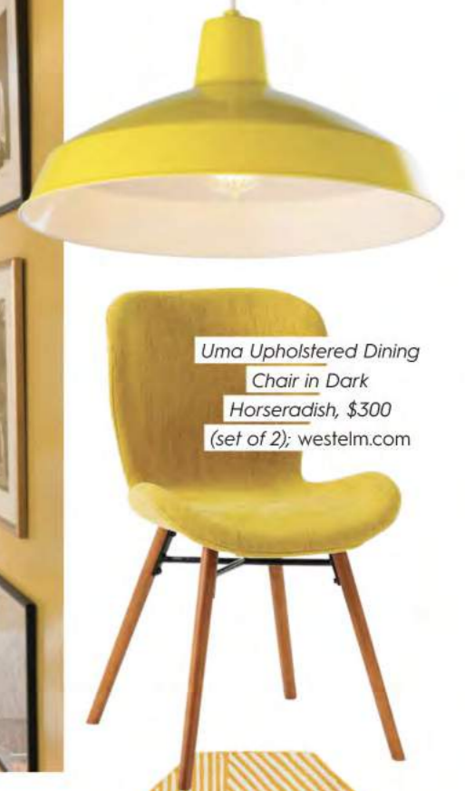
Uma Upholstered Dining Chair in Dark Horseradish, $300 (set of 2); westelm.com