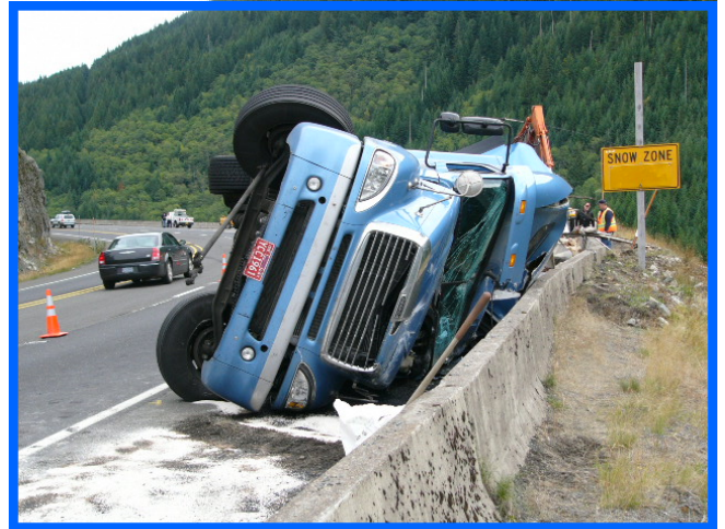
Along a seven mile stretch of U.S. 26 from 2002 to 2011:

An independent team of multi-disciplined professionals performed a Road Safety Audit of U.S. 26 in this area and identified engineering, enforcement, education and emergency response solutions to reduce crashes. Visit US26MtHoodSafety.org to learn more about the safety audit. In the past few years, ODOT implemented many of these solutions east of Rhododendron. And ODOT will construct a project to address the safety concerns along U.S. 26 east of Kiwanis Camp Road to the junction with OR 35.