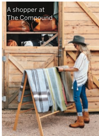
A shopper at The Compound