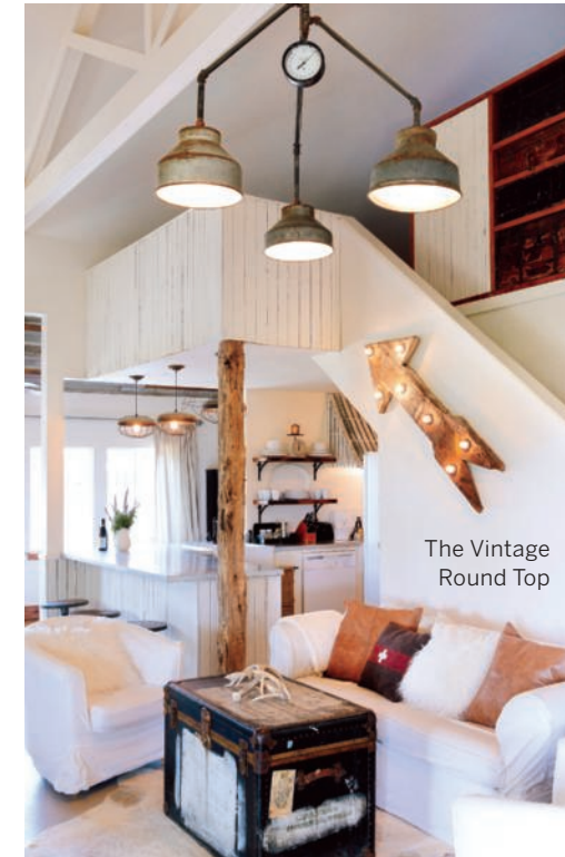
The Vintage Round Top