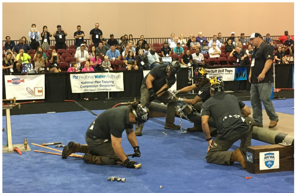
Pipe Tapping Competition