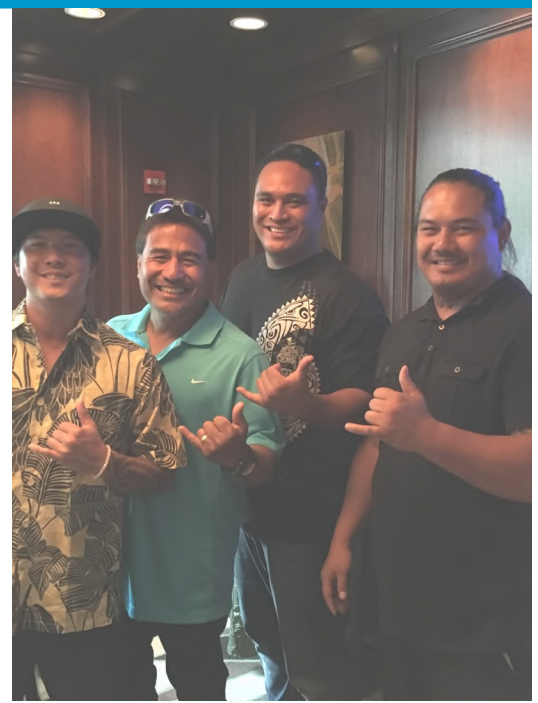
The Honolulu Board of Water Supply Pipe Tapping Team

The 2018 ACE will be held at the Mandalay Bay Resort in Las Vegas from June 11-14, 2018. We look forward to seeing you all at next year's ACE! §