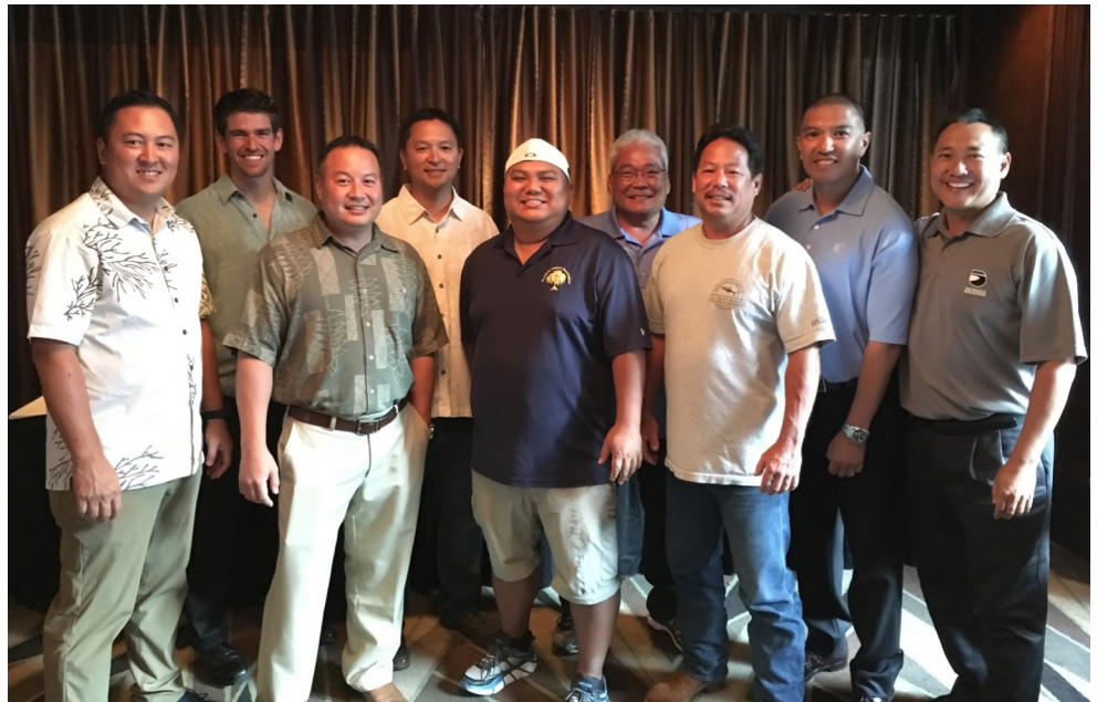
Hawaii Section Reception Attendees

and we were grateful to be there to honor him.