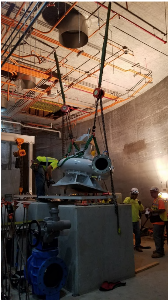
A Pump Being Lowered and Installed at the Bottom of the Shaft

At the time of the tour, the project site was bustling with activity as the construction team has been working 7 days a week in order to meet next year's consent decree deadline.