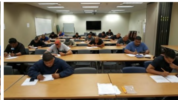
Water and Wastewater Operators Taking the Pre-Diagnostic Test