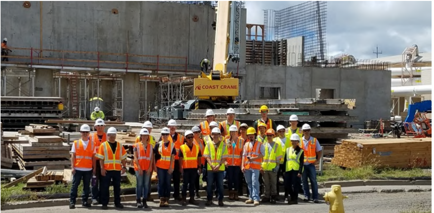
YP and YMF Attendees

We're grateful that the construction team gave us the opportunity to tour this unique project. We hope to visit again when the project is completed within the next year. Special thanks to ASCE YMF and Bowers + Kubota for arranging this event. §