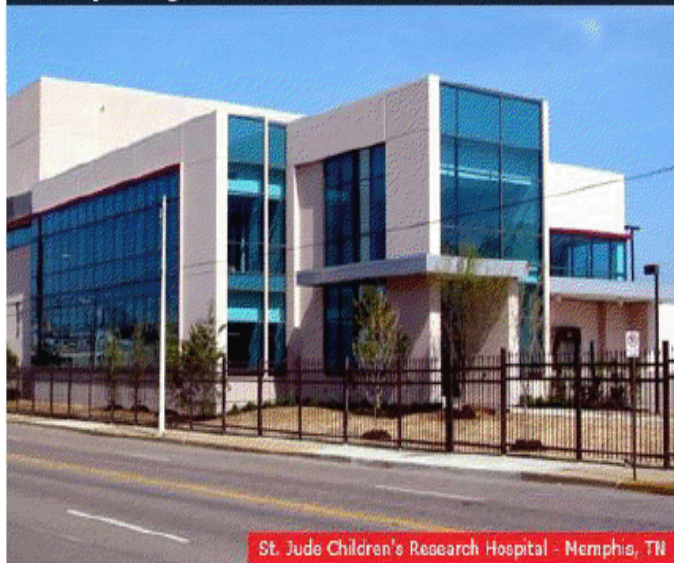
St. Jude Children's Research Hospital - Memphis, TN

Everything Else Is Just Paint™ FIND OUT WHY