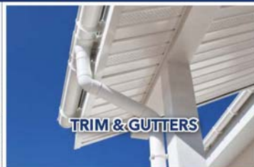
TRIM & GUTTERS