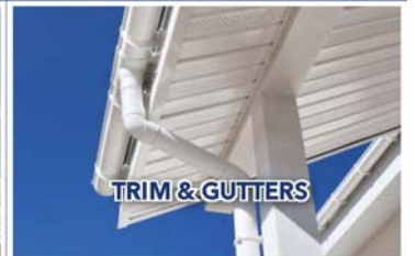
TRIM & GUTTERS