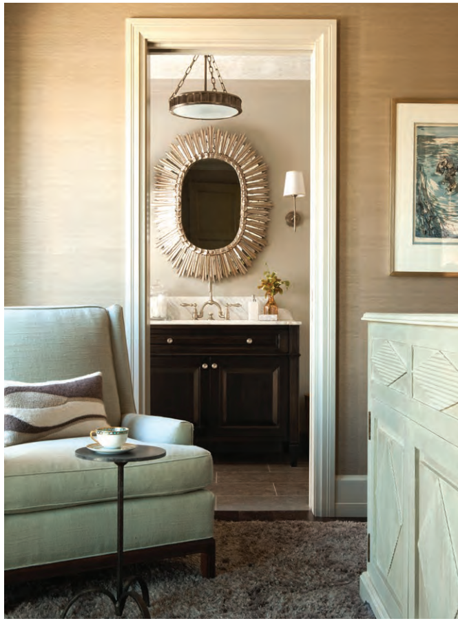
Opposite page: The master bedroom sitting area features a rug from the Michael Smith Collection for Mansour Modern, an inlaid dresser from Big Daddy's Antiques and a vintage painting from JF Chen. Clockwise from far left: The Moroccan guest room has a custom-made headboard upholstered in Jasper's Eton Square fabric. A view from the pool guest room looking into the bath includes a vintage mirror and ceiling pendant from Hudson Valley Lighting. Ann Sacks tile and antique Paul Ferrante lighting was used in the kitchen.