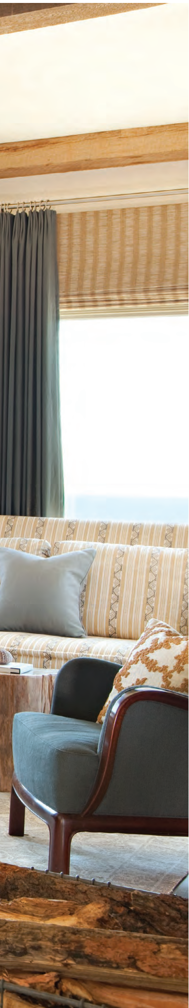
Opposite page: Custom-designed sofas, the Jasper Evan coffee table and petrified wood stumps from Berbere Imports create a comfortable and chic living room environment. Massimo Vitali's 2009 "Vulcano Sea Ferry" photo hangs above the sofa. Right: Vintage chairs and custom-made chairs were used in the dining room. Urban Electric Company's Virginia lantern hangs above the table, while Martyn Lawrence-Bullard's oversized mirror leans on the wall.