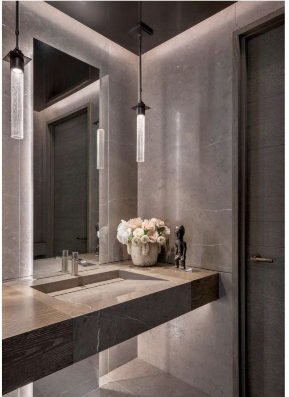
Above: Hunziker conceived the powder room as a dramatic and moody space. An Axor Citterio faucet is set within the vanity. The Fizz pendants are by ET2.