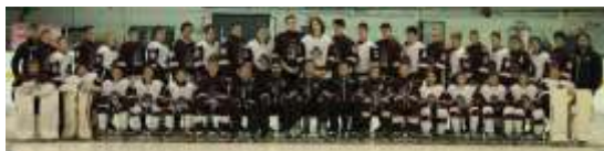
Senior & Junior Varsity Teams 2017-18