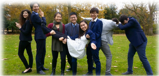
MUN Directors and Officers Goofing Around

Model United Nations is an educational simulation of United Nations or international bodies in which students academically compete as delegates of countries or political figures. The best performing delegates in a committee are acknowledged with awards.