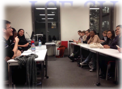
Internship Panel in Progress