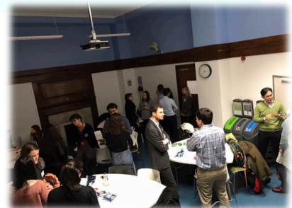
Launch for Mentorship Scheme