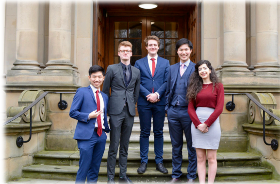
The 2017 Secretariat

LSEMUN, now in its 8 th year, offers a Crisis-only Model United Nations conference, allowing delegates from all around the world to engage in a variety of modern, historical and fictional scenarios from the points of view of those that lived them. This year, we welcomed more delegates than ever, held more crises than ever, and received fantastic reviews, with more than 95% of delegates saying they would like to return next year. The conference was also benefitted by the introduction of the Deus Crisis Software, which received exemplary reviews, as well as the introduction of feedback sessions on the Saturday, smaller Crisis cabinets so all could fully participate, and a newly revamped website ( lsemun.co.uk ).