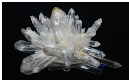
Workshop for Potential Design: Image for a Title