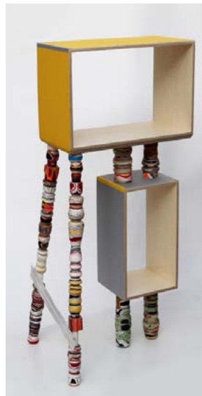
Understory - Sideboard with Friend

Capturing the cashmere label's nomadic origins, Marigold challenges the notion of indoor-outdoor space through an interpretation of a Mongolian ger tent-house.