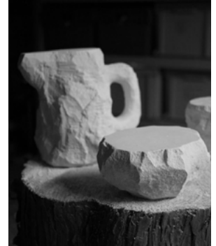
Bamford - Max Lamb

Brompton Design Day – Saturday, September 22 – closes the Festival with more than 20 events and offers from curated tours and designer talks to long lunches and a bread-making masterclass.