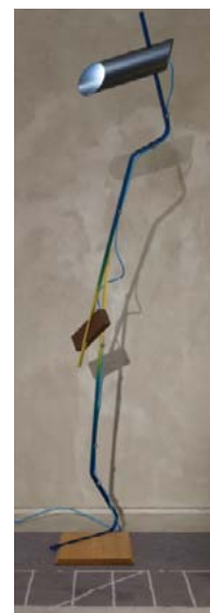
Composizioni Martino Gamper