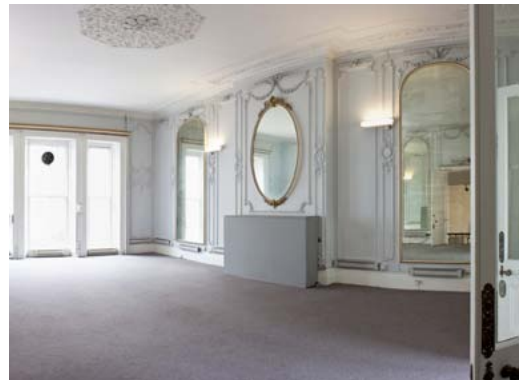
4 Cromwell Place - South Kensington