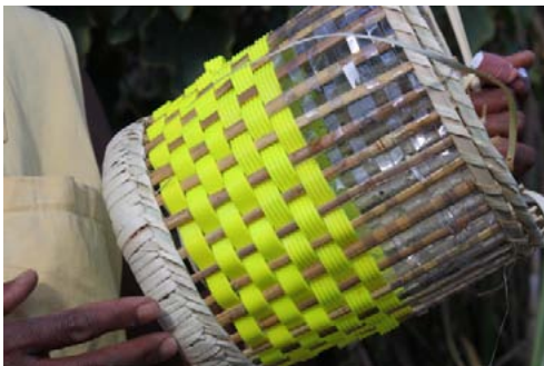
Building Baskets Kingston + Zimbabwe Makers

A Greek invitation to 'take the trouble to come; sit down and share'. An immersive food sharing experience and products that interpret the current economic climate in Europe.