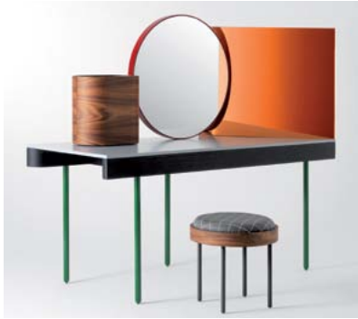
Mint - Chandlo

Skandium – a retrospective of Sweden’s hottest new design duo, Folkform