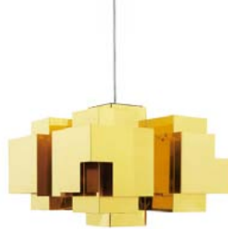
Skandium - Suburban Skyline