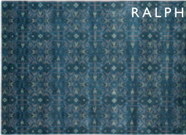
Sheldon, Fine Hand Knotted Wool Rug (in Cape Blue)