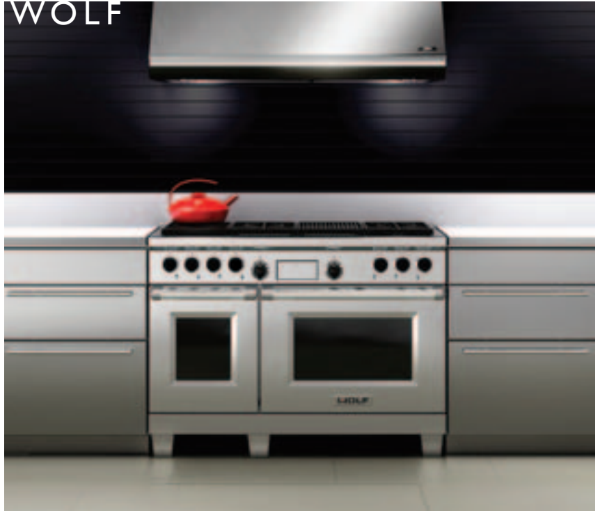
Dual Fuel Range by Wolf