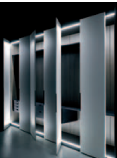
Solferino wardrobe system by Piero Lissoni