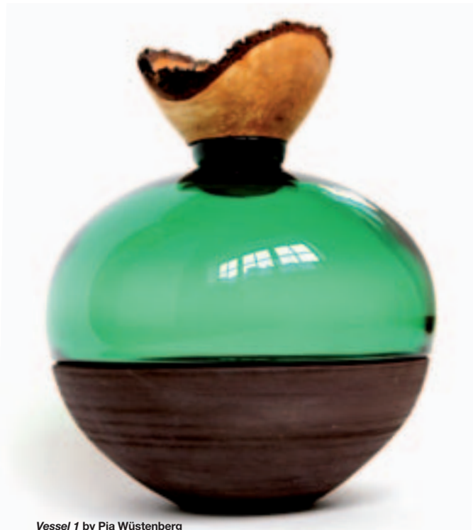
Vessel 1 by Pia Wüstenberg