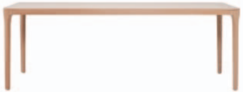
Thonet wooden table by Claudio Bellini