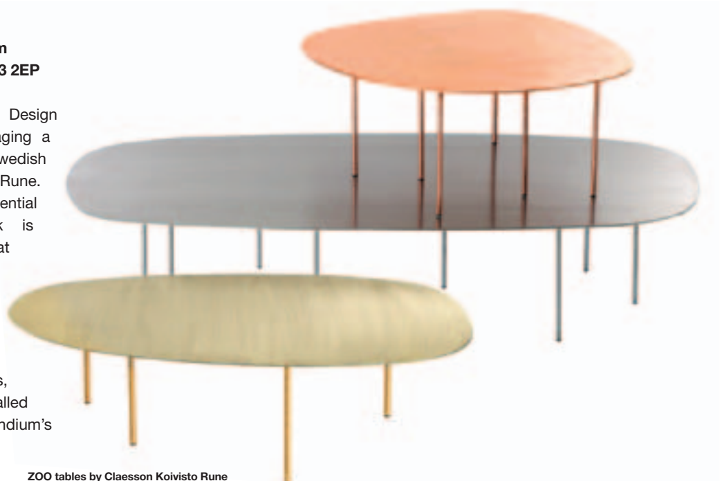
ZOO tables by Claesson Koivisto Rune

For this year's London Design Festival Skandium will be staging a retrospective of the work of Swedish architects Claesson Koivisto Rune. This internationally influential architectural practice's work is typically Scandinavian in that it gives equal emphasis to design and architecture. To reflect this, Skandium's exhibition will feature furniture, tableware, jewellery and a stool for two people called Alter which was made for Skandium's own product range.