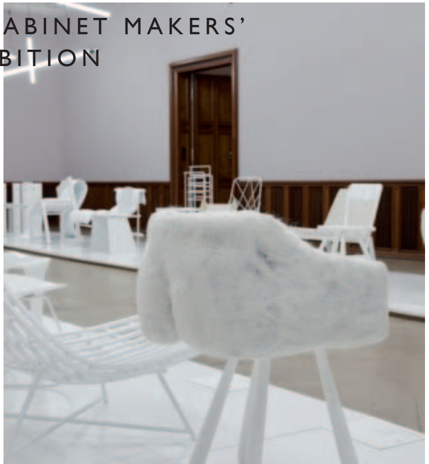
Whiteout at Ordrupgaard, Denmark

The exhibition will be shown at the Drill Hall Depot on Brompton Road, where the industrial setting offers a raw contrast to the light and elegant chairs.