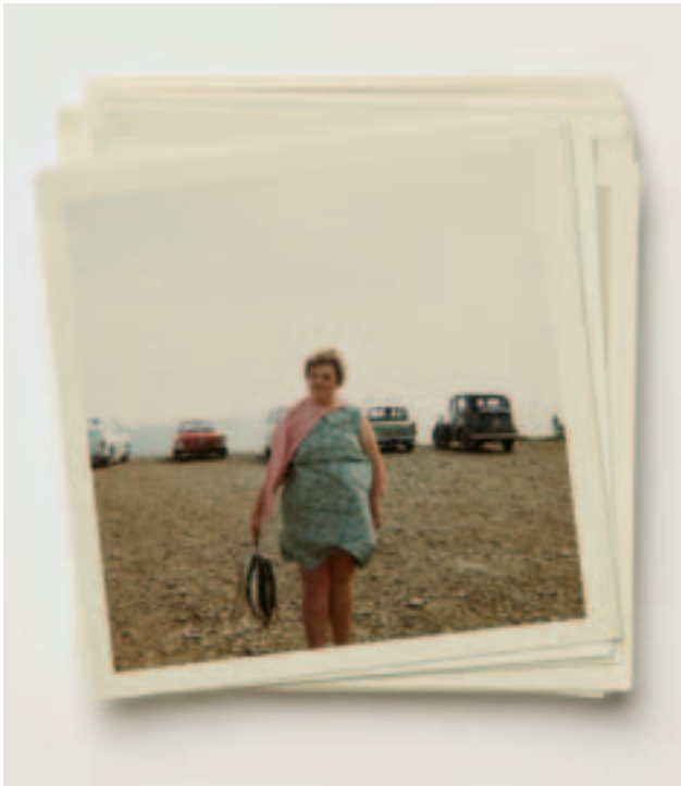
The inspiration for Vera