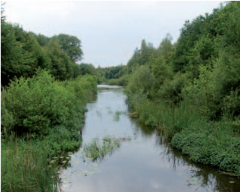
A man-made canal in the Netherlands provides inspiration for Methods of Imitation