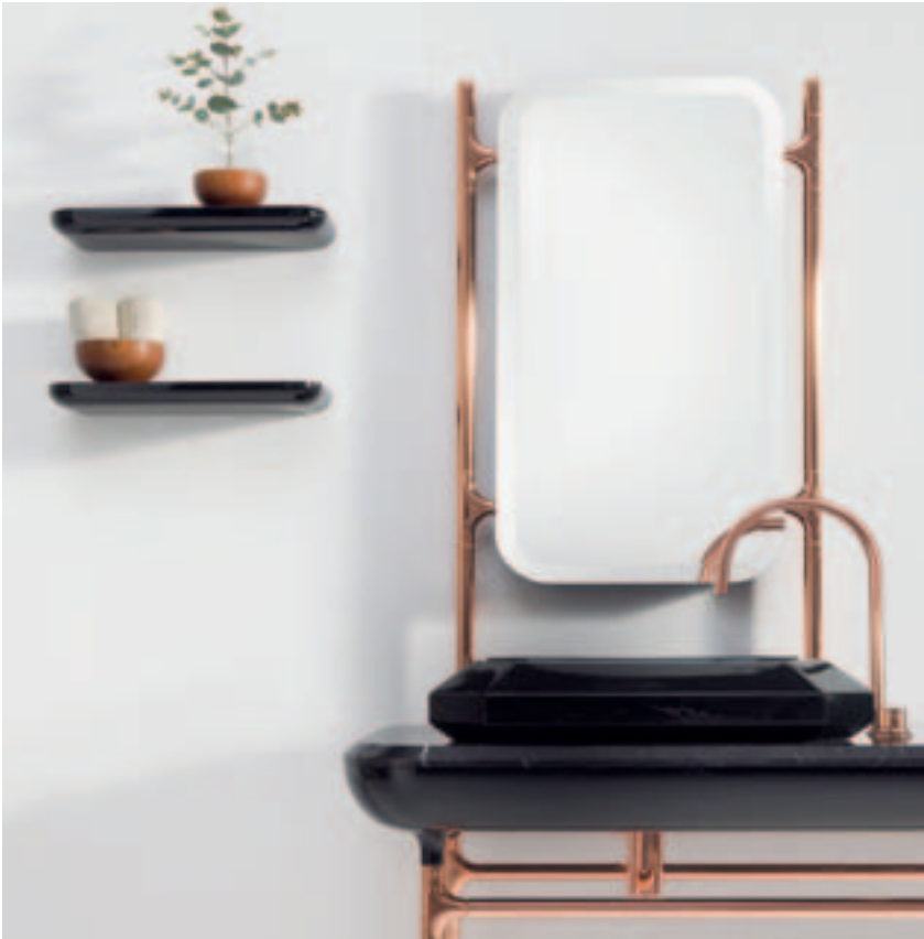
Bisazza Bagno The Hayon Collection