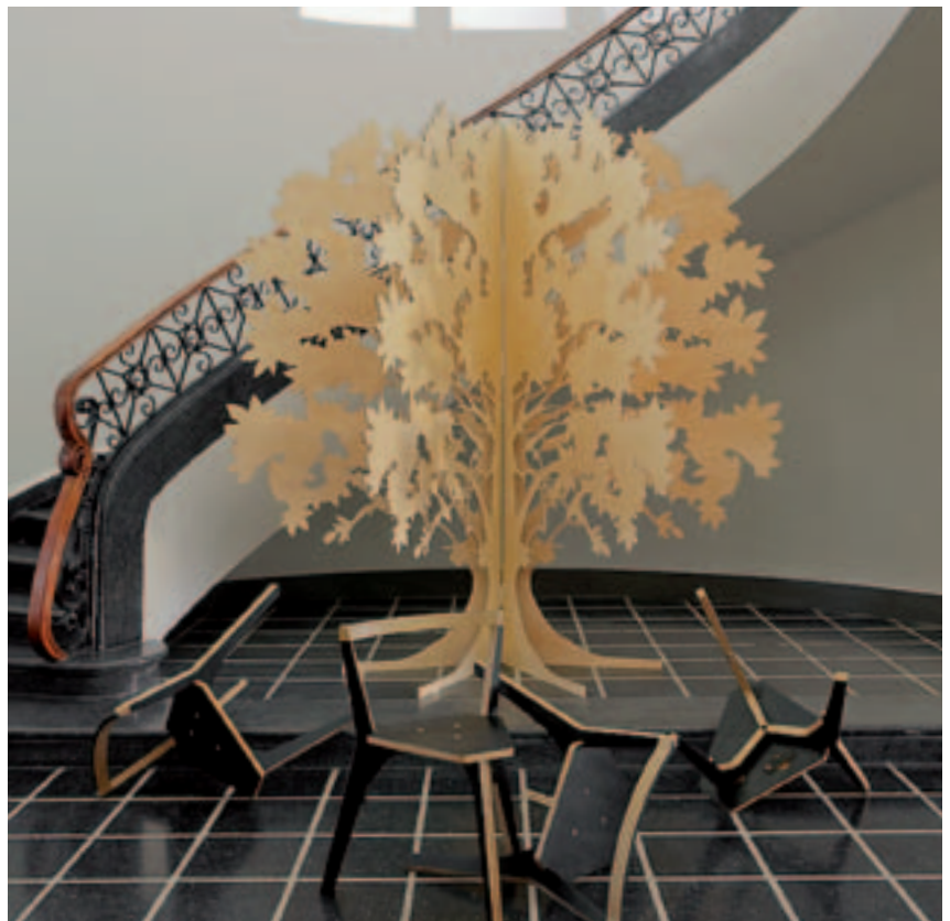
Niu Chair and Pirul by PIRWI at Mint

Mint is also proud to debut the work of Mexican design group PIRWI as well as a host of other new design talents, including Mint's favourite design graduates of 2011. The entire show will also be lit by the exciting Beirut-based .PSLAB.