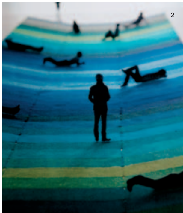
1 - Timber Wave by AL_A and supported by AHEC and Arup 2 - Textile Field by the Bouroullec Brothers with Kvadrat