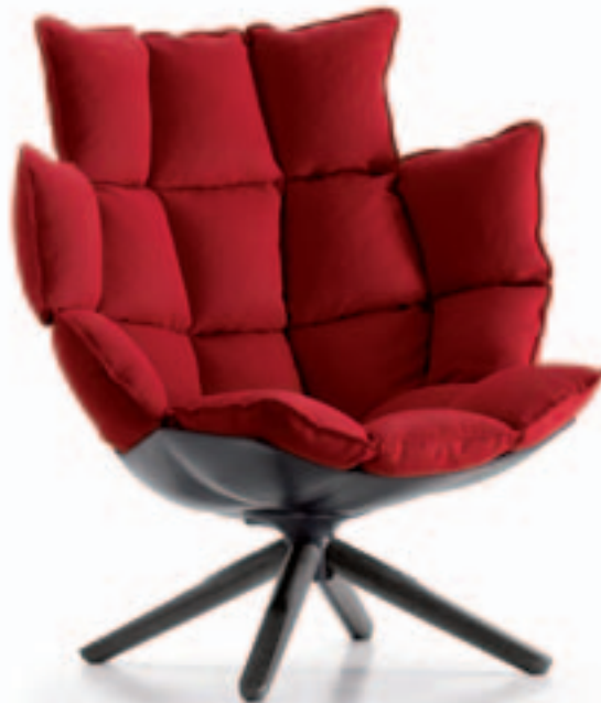
Husk swivel armchair by Patricia Urquiola