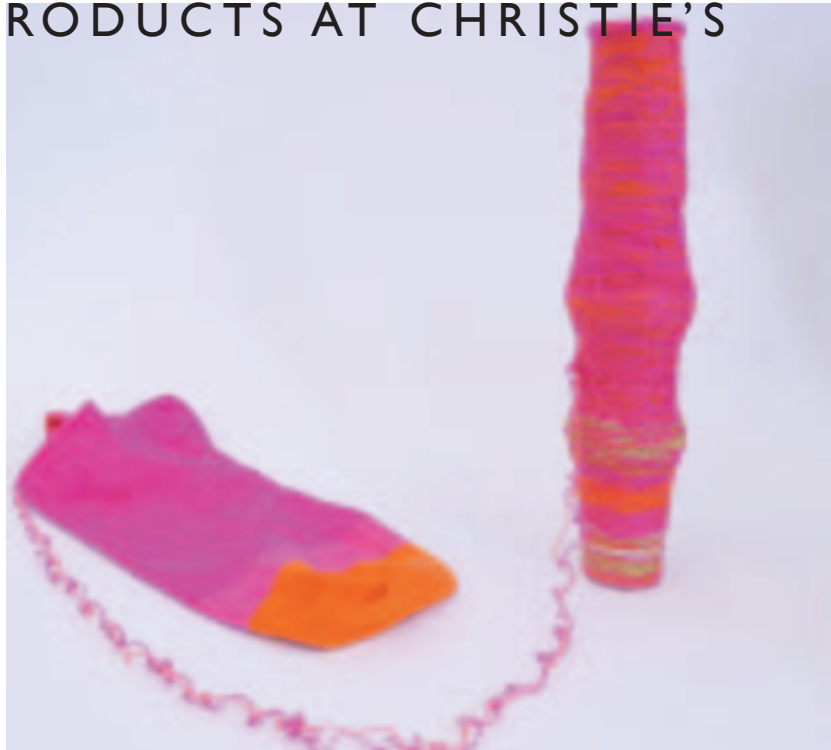
Thread Spinning Machine by Jungin Lee

Expect the unexpected, including a never-seen-before pasta-extruding machine, a re-imagined sausage maker and fruit-skin-textured salad bowls.