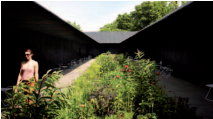
Serpentine Gallery Pavilion 2011 by Peter Zumthor.