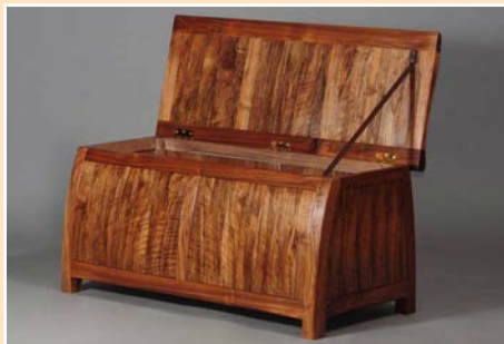
Blanket chest and seat, in figured English walnut.