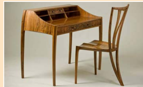
Walnut writing desk and 'V' chair, commissioned by an architect in Northern Ireland.