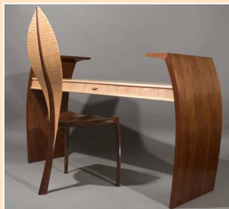
Walnut and rippled maple desk with matching Folium chair.

form is primary, and surface features – colour, pattern, inlay or whatever – back that up and hopefully enhance it."