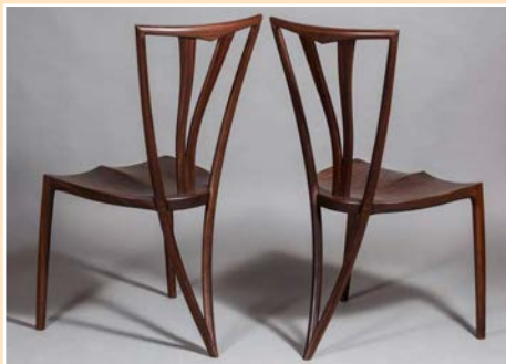
'V' chairs in walnut.