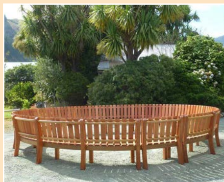
Circular bench built from California redwood, oak and New Zealand red beech. It complemented a gold-medal-winning garden designed by Andrew Fisher-Tomlin for the 2013 Ellerslie International Flower Show in Christchurch's Hagley Park.

"Good furniture for me is a lot about 'stance' and finding a dynamic interplay between the various components. I'm a modernist in so far as I consider