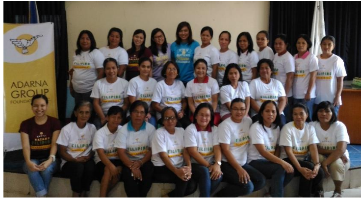
BHWs: Hooray for our new shirts!

midwife from Anao RHU, was appointed Unang Aklat point person. The BHWs actively took part and were delighted when they received their AGFI shirts ☺