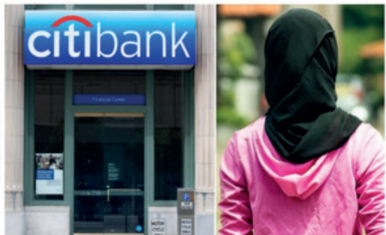
A hijab-wearing woman's attempt to open a Citibank savings account was abruptly scuttled by the mention of her husband's Arabic surname, according to a complaint filed with the city Commission on Human Rights.

Woman in religious headscarf files 'banking while Muslim' complaint charging Citibank with discrimination