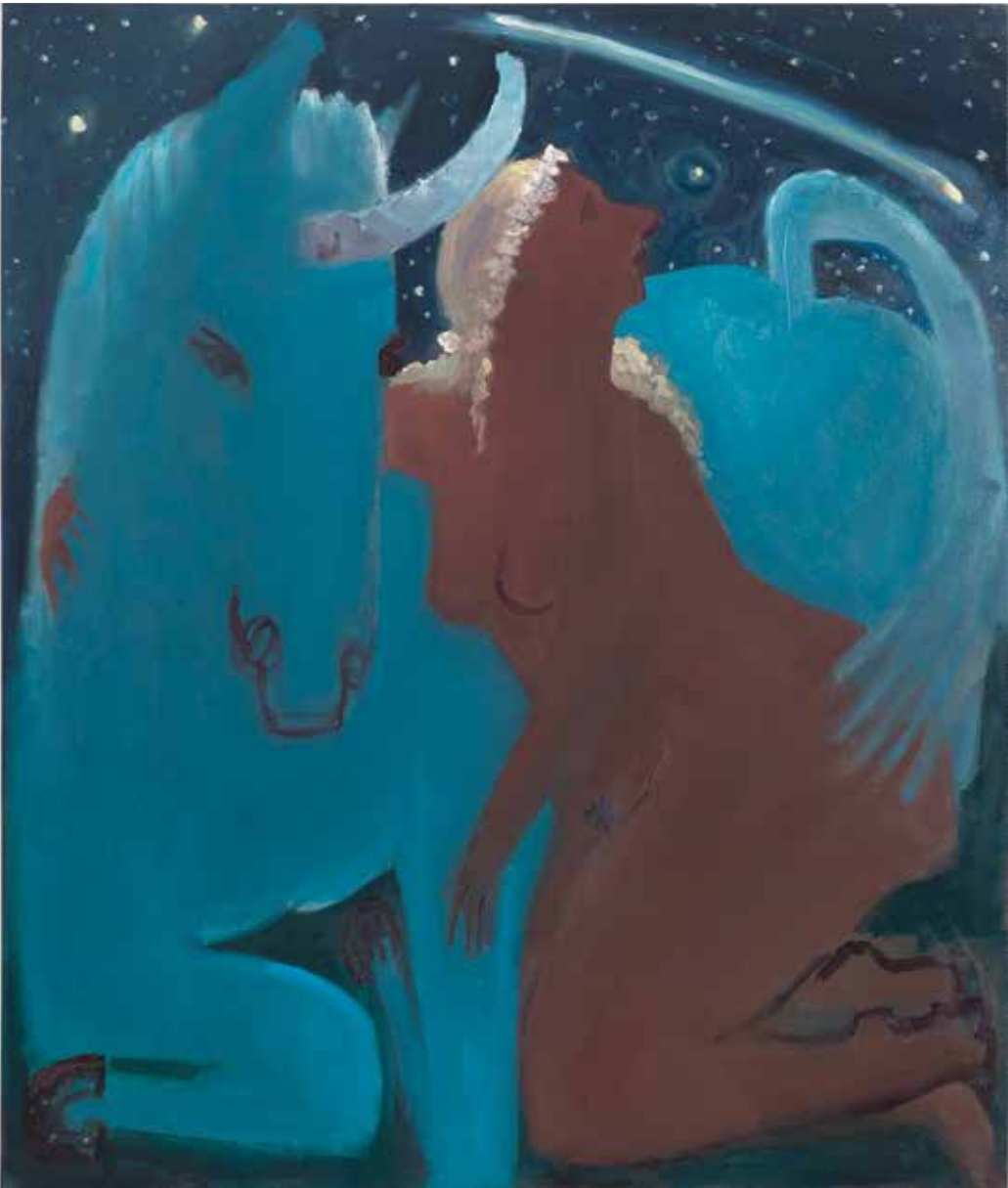
Unicorn and Shooting Star 2015 oil on canvas 36 x42 inches