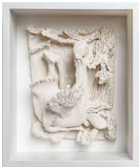
Left: Study for Leda 2015 clay 8 x 10 inches

In paintings like these, Staver recasts fraught or kitsch scenarios in terms that are affectionate and yet strangely somber. She is no theorist, no polemicist, but it's easy to discern an intuitive agenda: a sly, willfully innocent, perhaps girlish, contrarianism. You might imagine the images tipping towards saccharine. Instead they feel macabre and drily comical—in other words emotionally dark, their surface sweetness a form of deadpan.