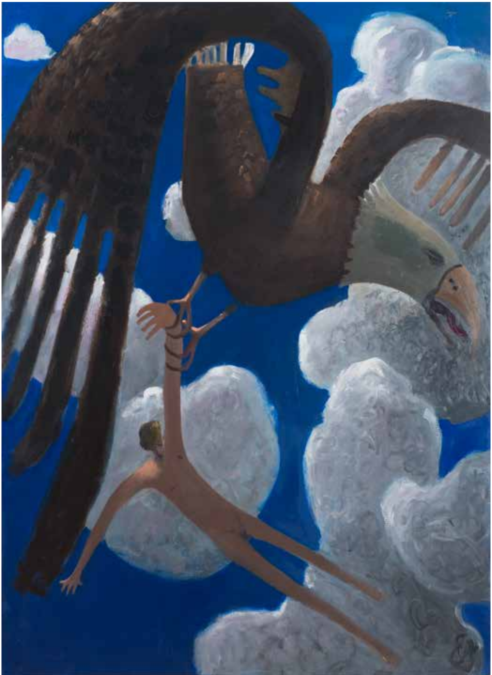
Ganymedes 2015 oil on canvas 58 x 68 inches