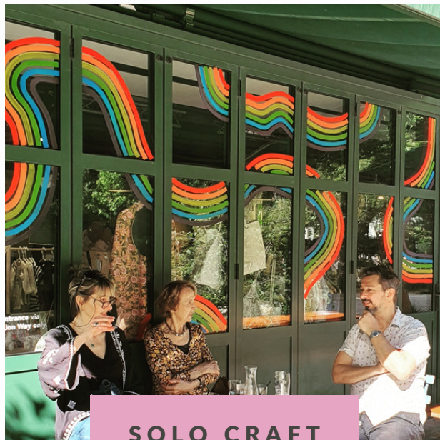
SOLO CRAFT FAIR

Our shop is flooded with natural light thanks to our large bifold doors which can be opened up on to the terrace in summer. The terrace itself is often busy with customers enjoying coffee or cocktails from Little Louie café who we share our space with. We occasionally host events on the terrace too, such as workshops or pop-up craft stalls, which add to the bustling atmosphere.