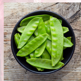
SNOW PEAS $5 PER KILO