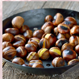
FRESH CHESTNUTS $8 PER KILO (XL SIZE)