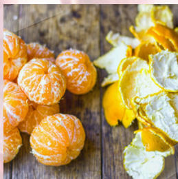
IMPERIAL MANDARIN $24 PER BOX (9KG BOX)