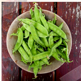
SNOW PEAS $5 PER KG