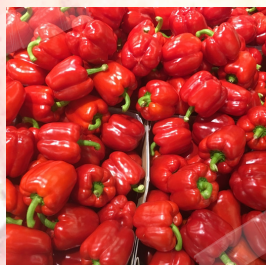
RED CAPSICUMS $15 PER BOX