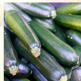
ZUCCHINI $15 PER BOX