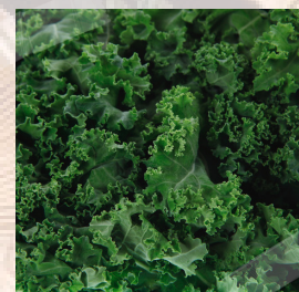
KALE $1 PER BUNCH