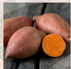
SWEET POTATO $18 PER BOX