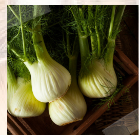
LARGE FENNEL $18 PER BOX