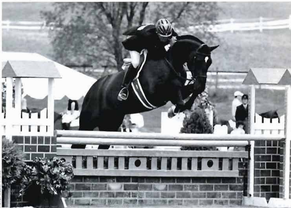
Francis Mauter Photo

I've been breeding a bit so we don't shut down the home farm anymore. We just started in the breeding business. This spring we were up late delivering babies with my daughters right there, who are 5 years and 15 months old. We can look out from the house and see the babies all the time. That's good for our kids."