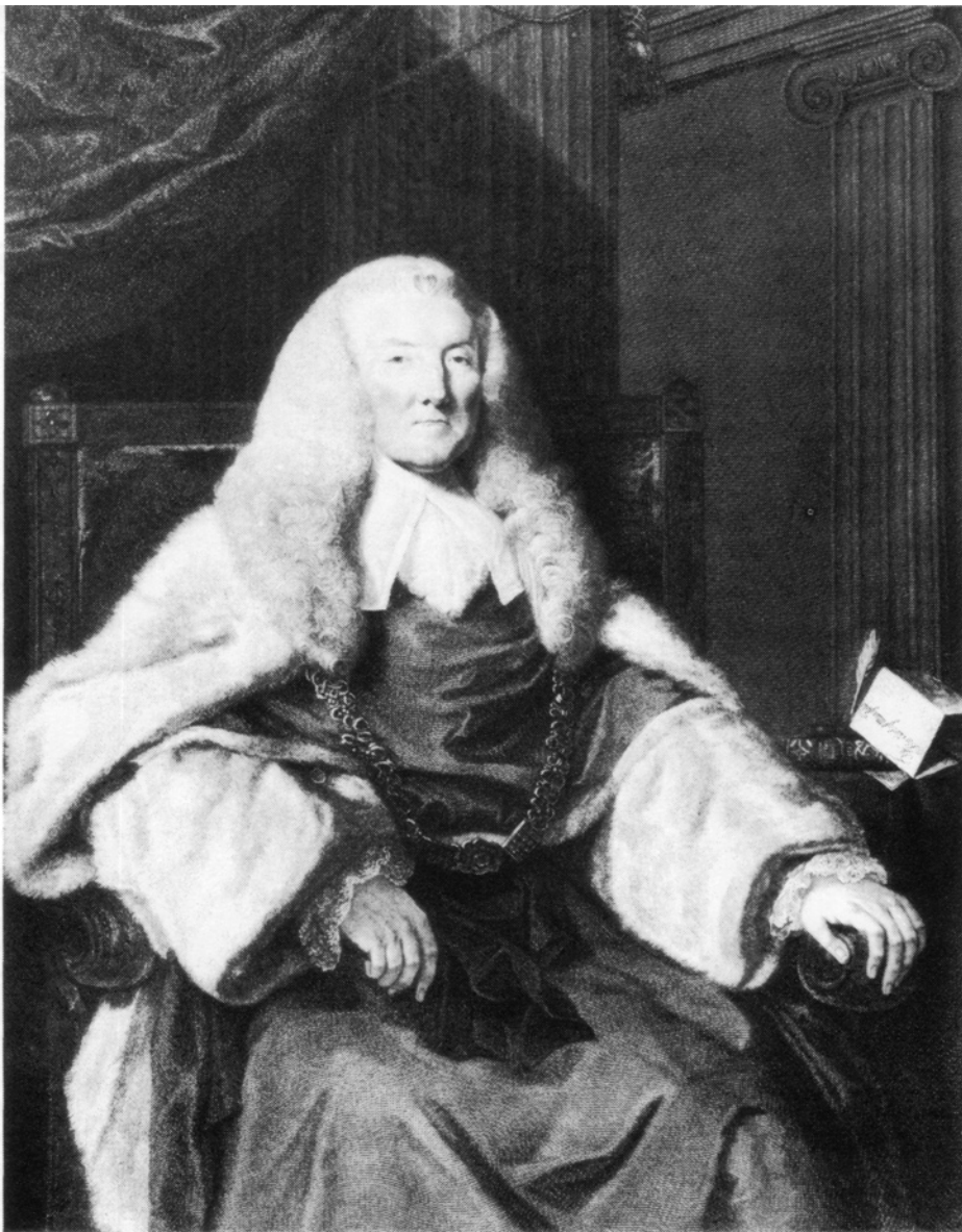
The 1st Earl of Mansfield aged 80; engraving by Bartolozzi after Reynolds (1785).

or “body servants” who were regarded and treated as exotic playthings or status symbols by their aristocratic or rich owners. Sometimes these children were outrageously spoilt as infants and then, as awkward adolescents, were liable to instant dismissal or even cruel “repatriation” to the West Indies where most of them had never been. Owners tiring of their novelty would often advertise these children for sale in local papers and, if a local sale appeared unprofitable, they were sure to make at least some money by selling them to slave captains who would ship them to the West Indies.