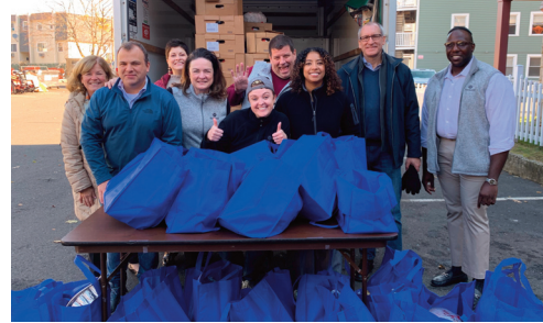
Employees of Bankwell hand out turkeys and roasting pans to our community members in-need during Thanksgiving time.