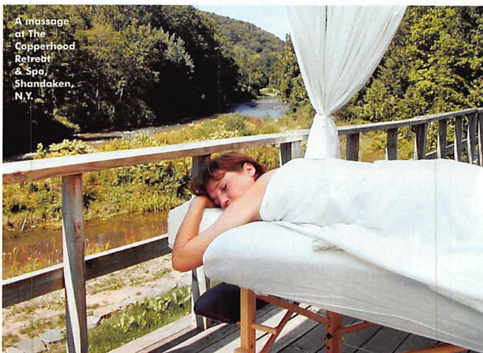
A massage at The Copperhood Retreat & Spa, Shandaken, N.Y.

But at Canyon Ranch you do not spend all your time getting patted and stroked into doughy ecstasy: There are saunas, indoor and outdoor swimming pools, gyms, exercise studios, tennis, racquetball, squash and basketball courts. Mealtime will not remind you in any way of the old ranch grubhouse: Extensive but sensible menus are meant to slim you down and clean you out. Typical dinner starters are creamy carrot