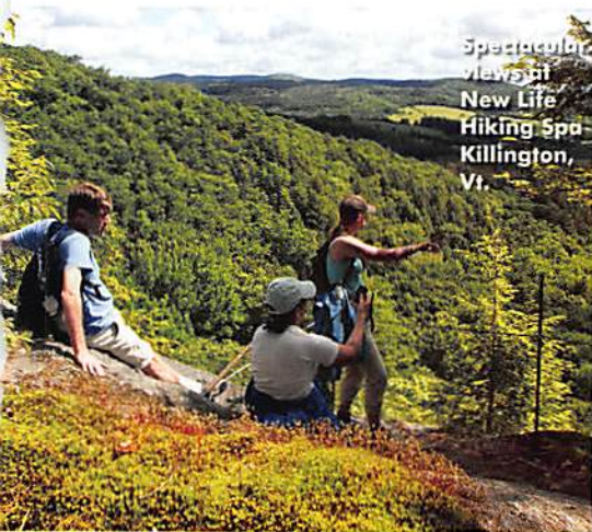
Spectacular views at New Life Hiking Spa, Killington, Vt.