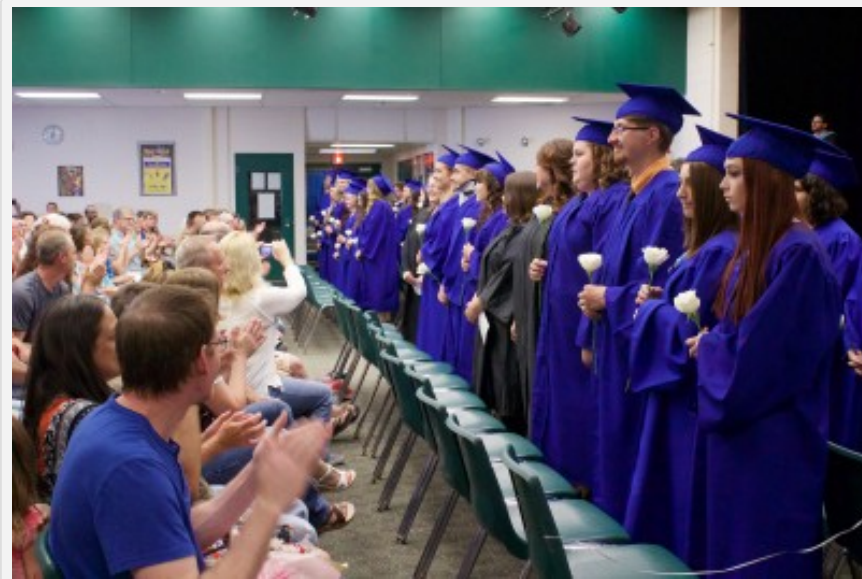
Success Virtual Learning Center graduates face their friends and family who helped them to reach the point of graduation. On Thursday, 41 students representing Belding, Central Montcalm, Lakeview and Tri County received their diplomas.

In a final celebration, students released blue and white balloons with “success” printed on them to mark the end of their high school journey.