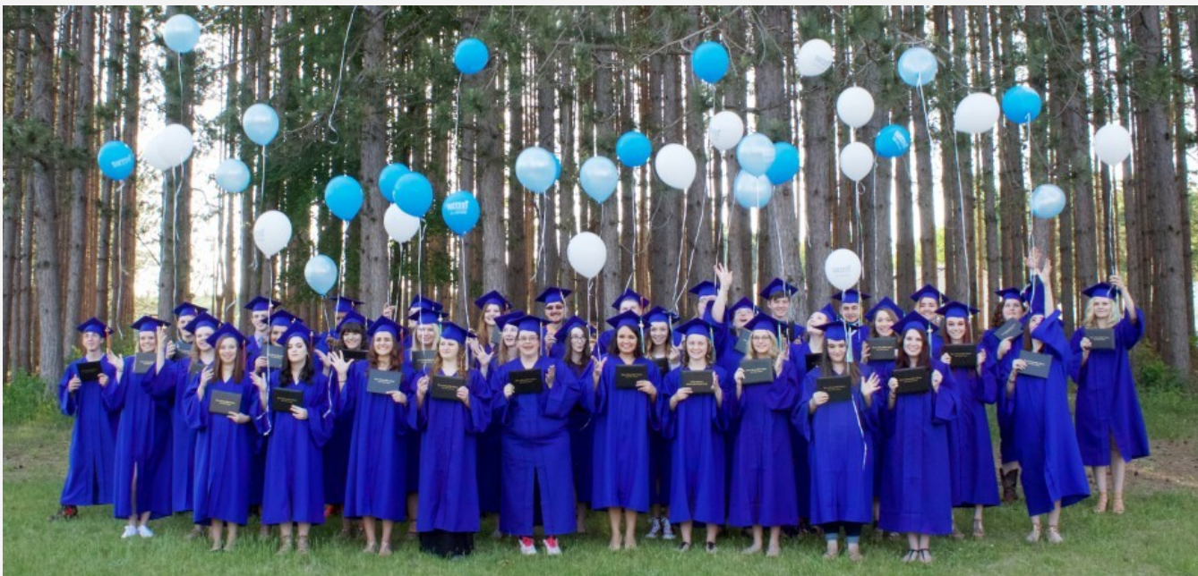
After 41 Success Virtual Learning Center graduates received their diplomas Thursday at Central Montcalm Middle School, they released balloons into the air to represent the end of their high school journey.

STANTON — It was standing room only as family, friends and loved ones packed the Central Montcalm Middle School auditorium Thursday to watch 41 students graduate from the Success Virtual Learning Center.