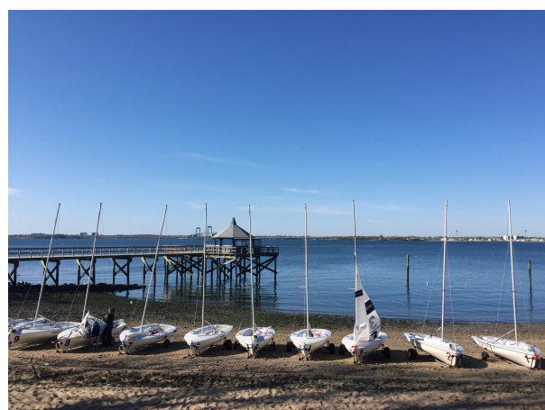
GREATER NY REGATTA HOSTED BY FORDHAM AND COLUMBIA

To see more pictures from our season and to stay updated on CUST happenings, like us on Facebook and follow us on Instagram!