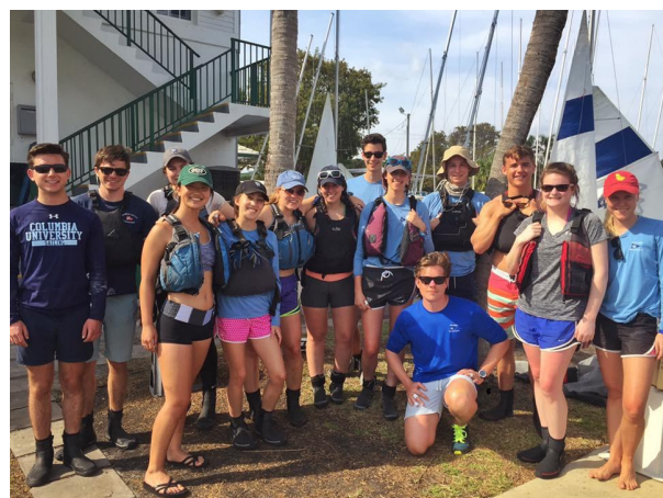
SPRING BREAK TRAINING IN FLORIDA