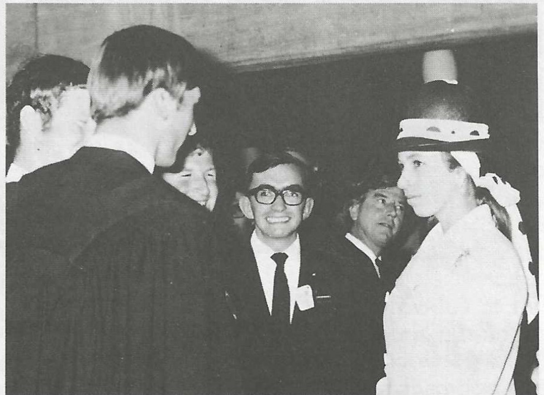
Royal visit Her Majesty, Duke of Edinburgh, Princess Anne to Robb College.