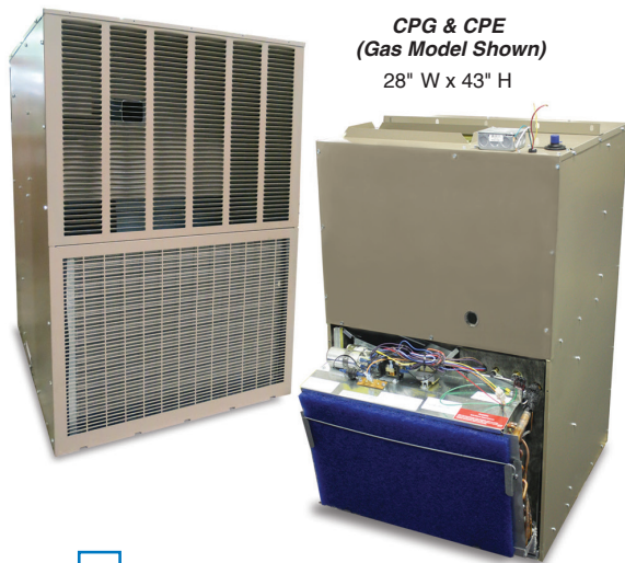
CPG & CPE (Gas Model Shown) 28" W x 43" H