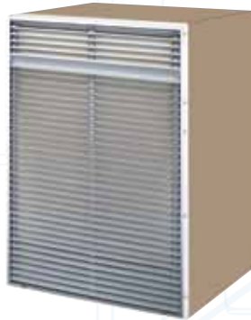
Split-System Architectural Louver Grille (shown in anodized aluminum)