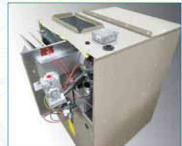
Slide-Out Furnace with Standard 409 Stainless Steel Heat Exchanger on gas models