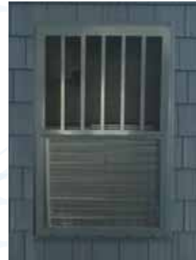
Comfort Pack Powder Coated Stamped Louver