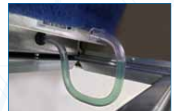
Standard Dual Drain on all models