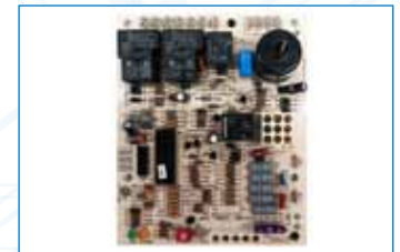
Easy access DSI Control Board on gas models