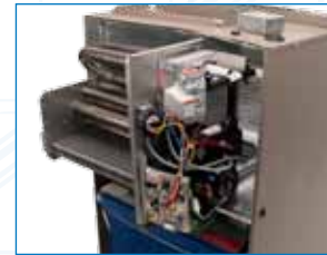
95% Thermal Efficiency, Slide-Out Furnace with Stainless Steel Heat Exchanger