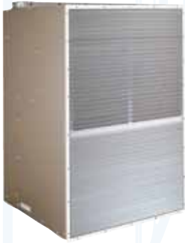
Comfort Pack Architectural Louver Grille (shown in anodized aluminum)

Our louver grilles enhance the appearance of the building, while providing protection from the weather and possible vandalism. Grilles are available in anodized aluminum and in multiple colors.