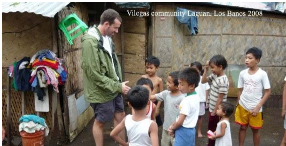
2008 Trip to Philippines