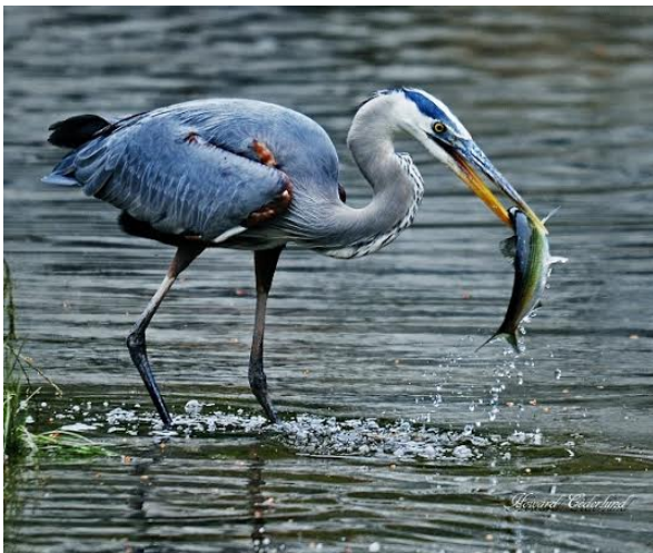
Heron with alewife on the Nequasset River, tributary of the Kennebec River