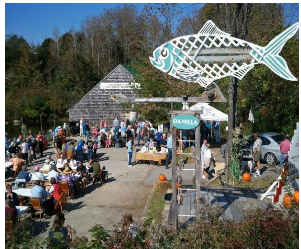
Festival-goers attending the Damariscotta Mills Fish Migration Festival