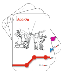
Fig. 3 Pattern card set

Figure 3) contains the essential information that is