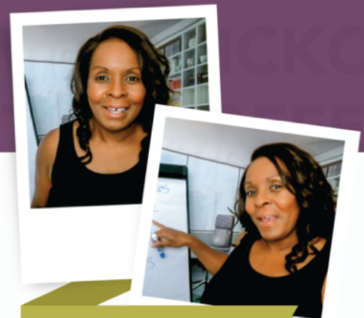
PHOTOS FROM THE EVENT