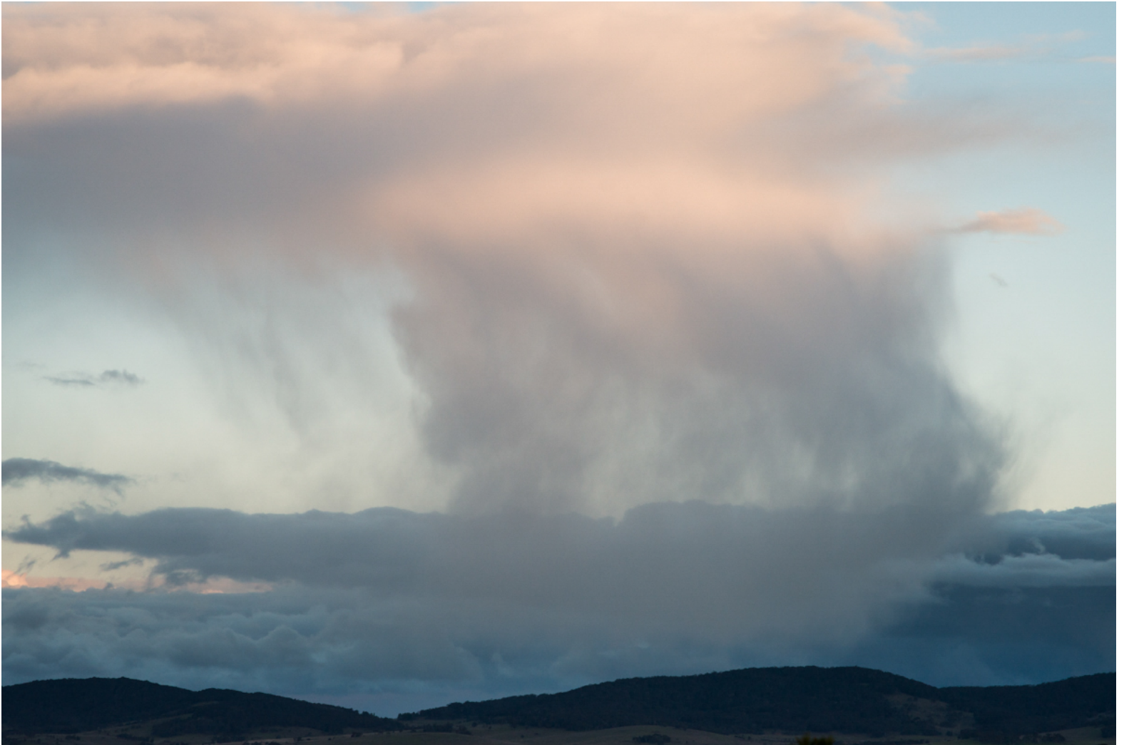
Wraith , 2016. Pigment ink on archival art paper. 110cm x 73.4cm. (Edition of 4 plus 2AP) $3100 unframed