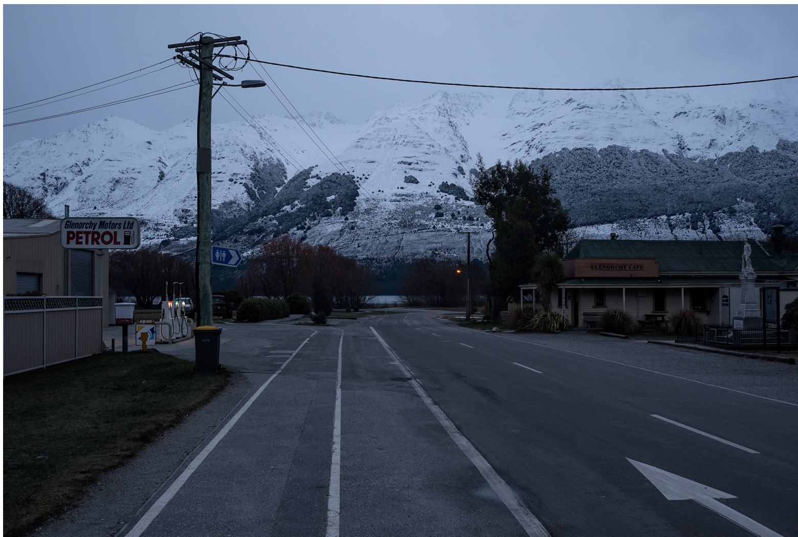
Road to The Lake. , 2016. Pigment ink on archival art paper. 110cm x 73.4cm. (Edition of 4 + 2AP) $3100 unframed. 150cm x 100cm. (Edition of 2 + AP) $4200.00 unframed.