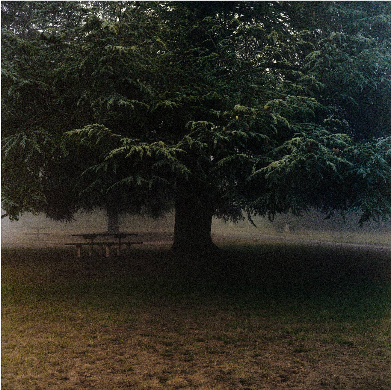
Untitled (DR2011.TS05.06.02), 2011. Pigment ink on archival art paper. 90cm x 90cm. (Edition of 6 plus 2AP) $3100 unframed.