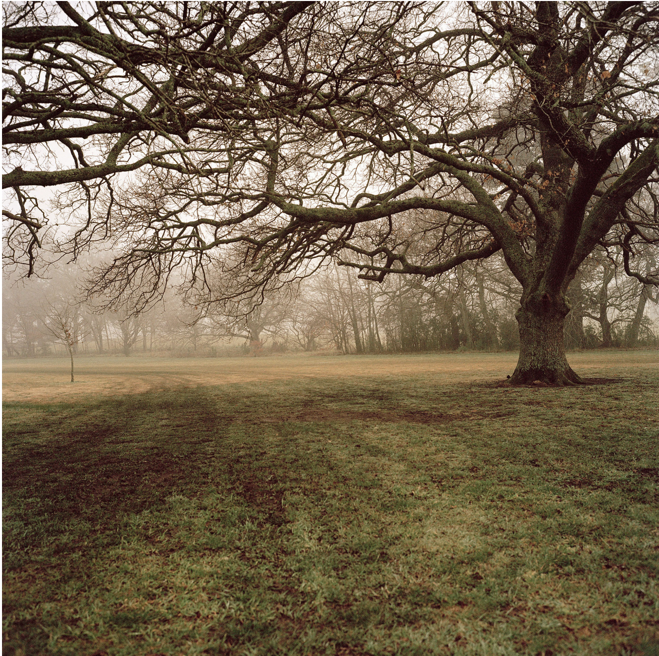
Untitled (DR2011.TS06.06.02), 2011. Pigment ink on archival art paper. 90cm x 90cm. (Edition of 6 plus 2AP) $3100 unframed.