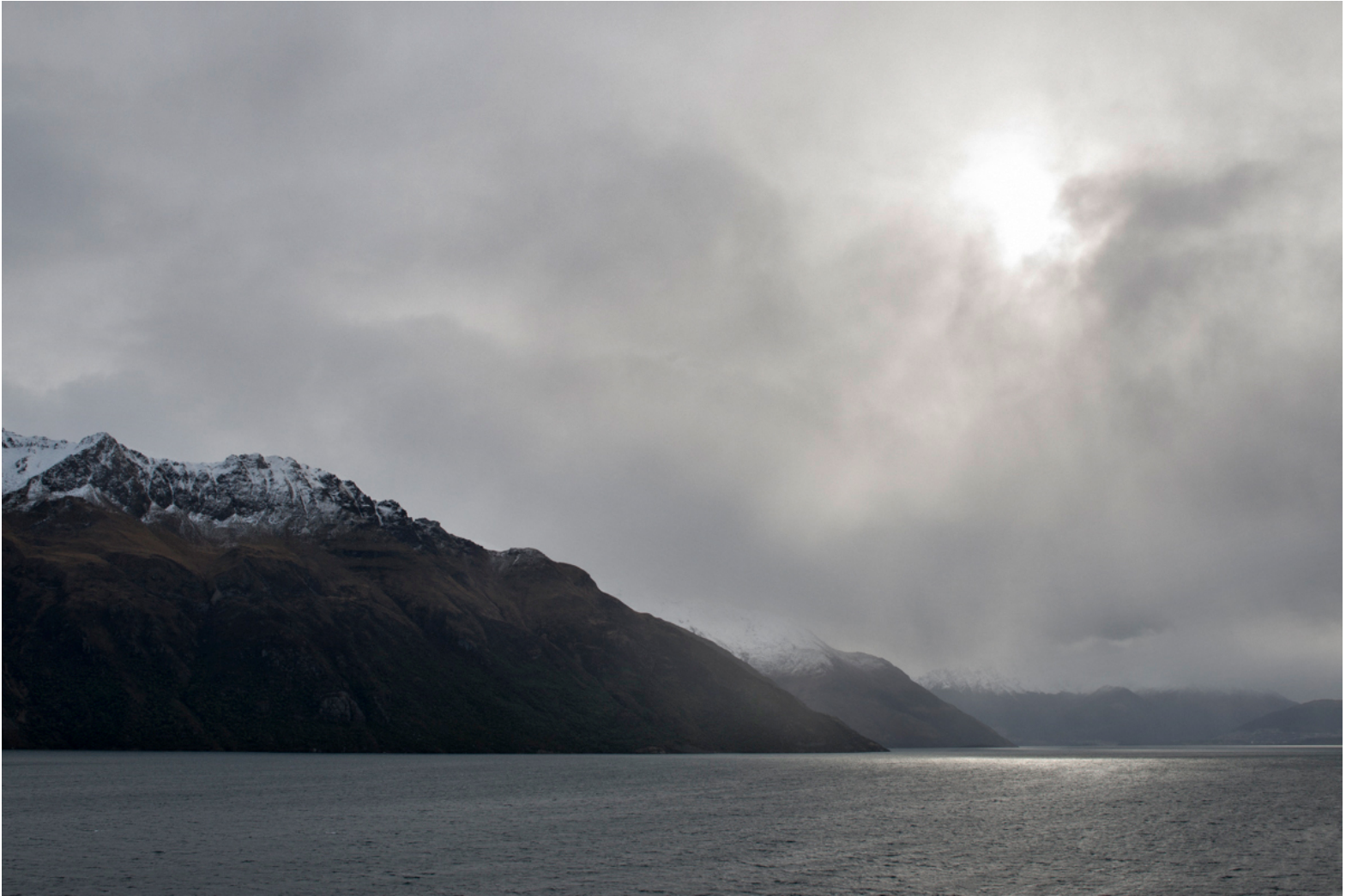
The Athiest No. 1 , 2016. Pigment ink on archival art paper. 110cm x 73.4cm. (Edition of 6 plus 2AP) $3100 unframed