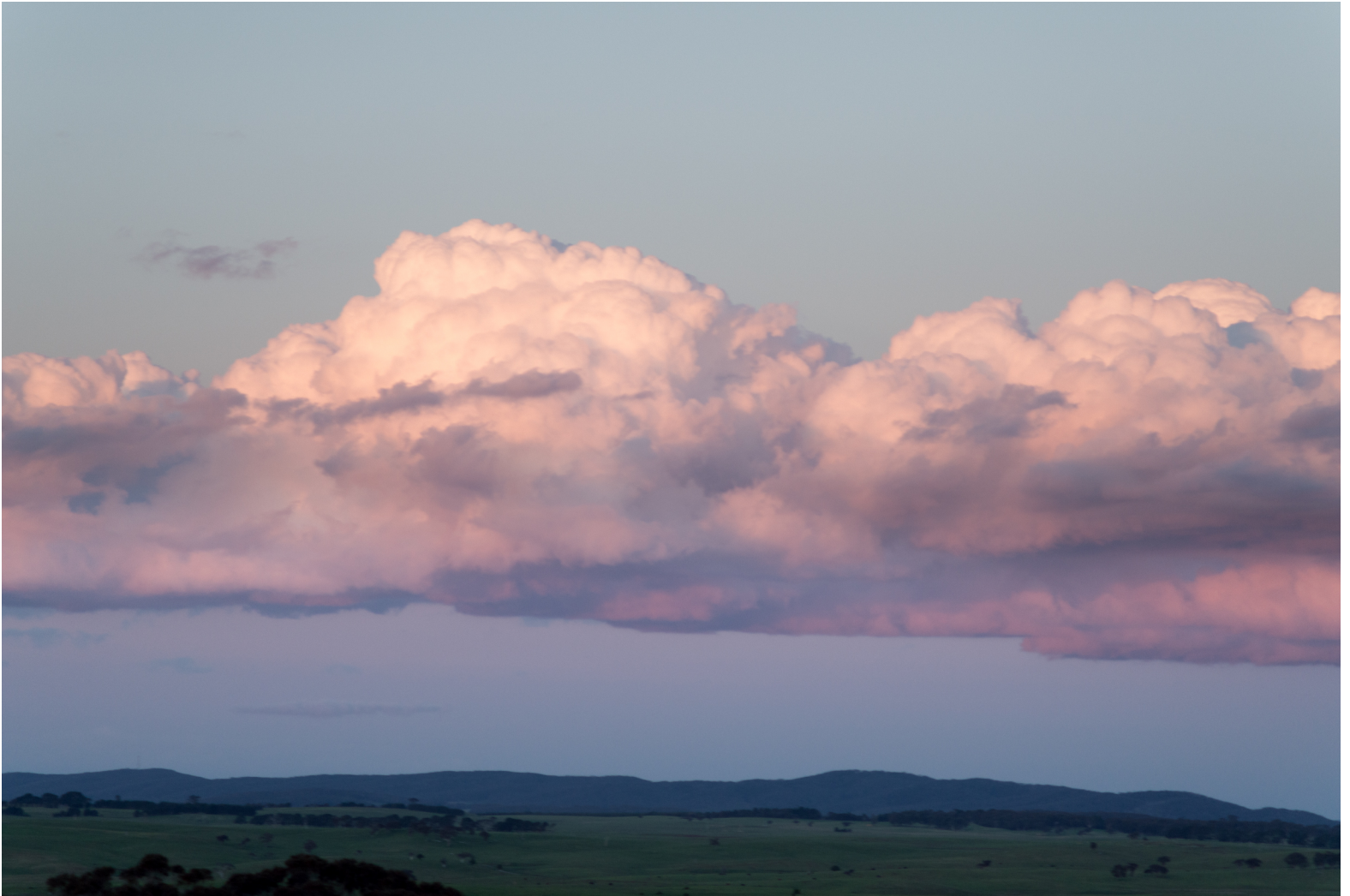
Something greater than us , 2016. Pigment ink on archival art paper. 110cm x 73.4cm. (Edition of 4 plus 2AP) $3100 unframed