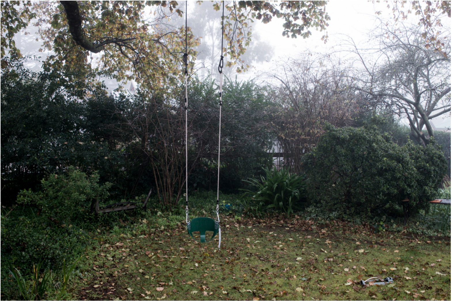
This ain't Kansas Dorothy No.4 , 2014. Pigment ink on archival art paper. 110cm x 73.4cm. (Edition of 6 plus 2AP) $3100 unframed