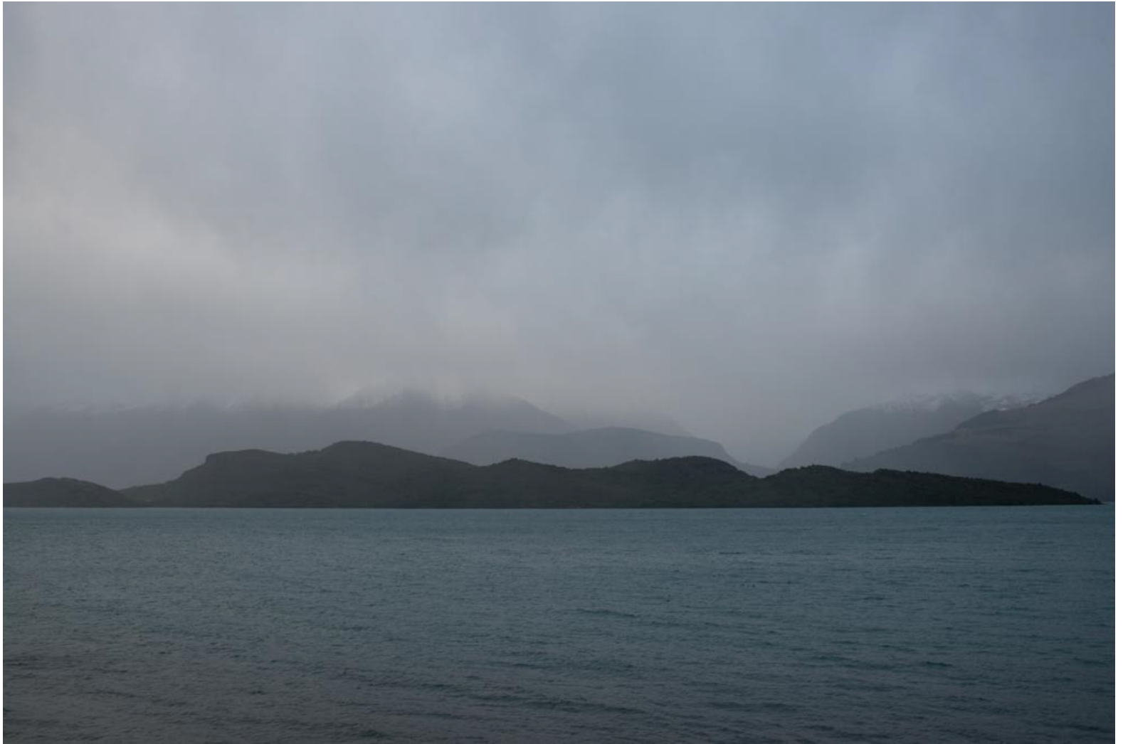
Love & Treachery , 2016. Pigment ink on archival art paper. 110cm x 73.4cm. (Edition of 6 plus 2AP) $3100 unframed 150cm x 100cm. (Edition of 2 + AP) $4200.00 unframed.