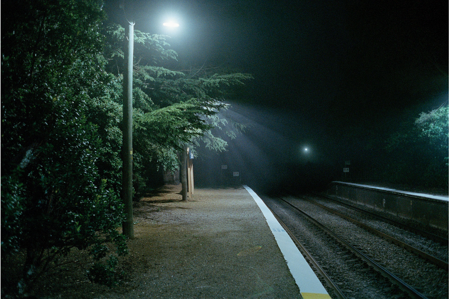
Untitled (DR2012.ES05.06.02) , 2012. Pigment ink on archival art paper. 110cm x 73.4cm. (Edition of 6 plus 2AP) $3100 unframed.