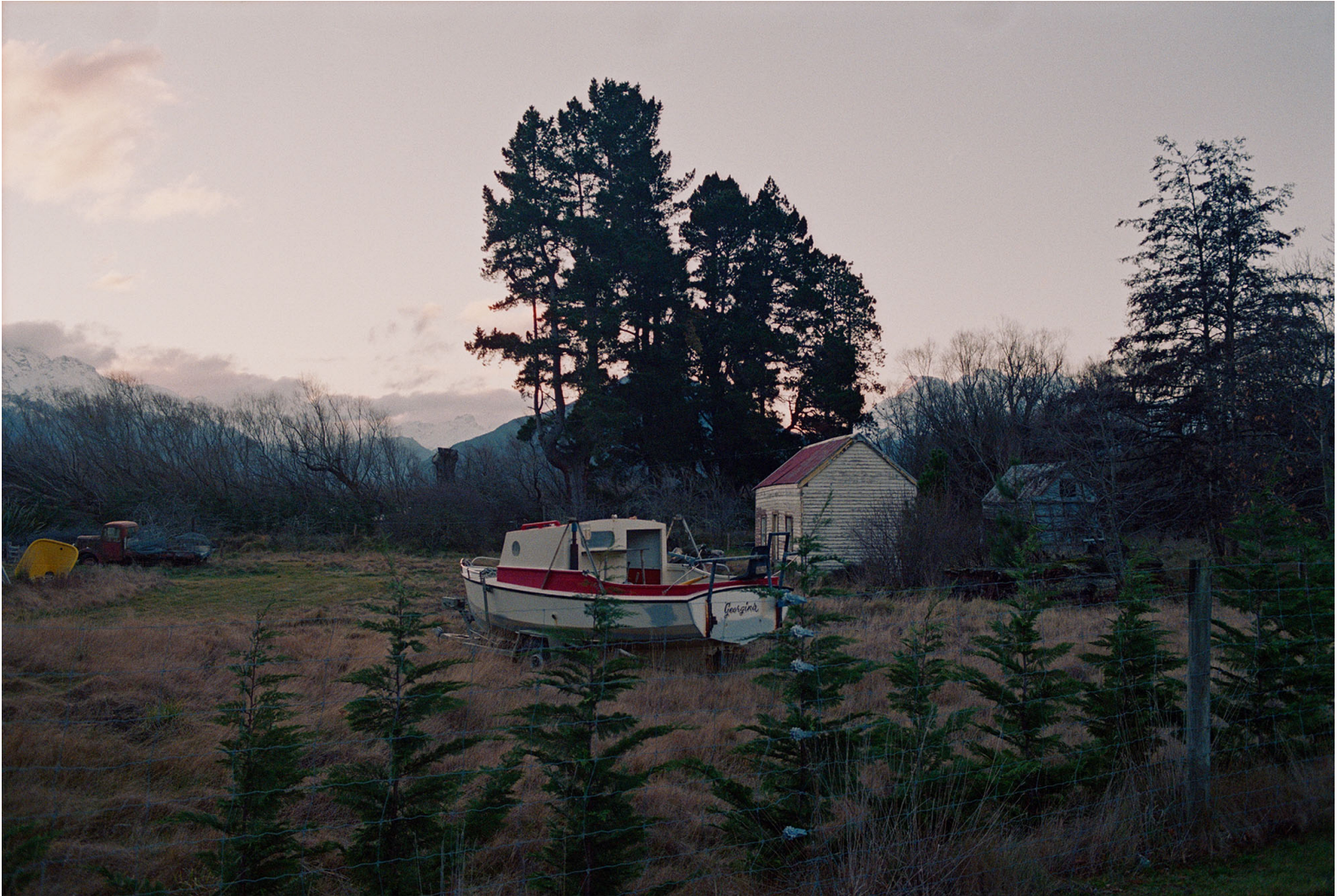
Waiting for The Flood , 2016. Pigment ink on archival art paper. 110cm x 73.4cm. (Edition of 4 + 2AP) $3100 unframed.