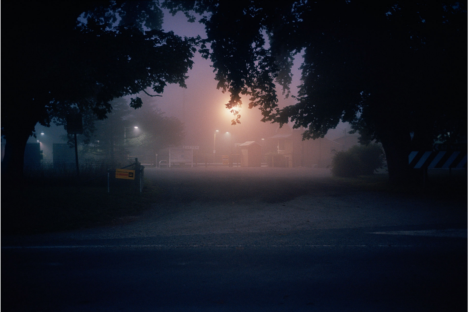
Untitled (DR2012.ES01.06.02) , 2012. Pigment ink on archival art paper. 110cm x 73.4cm. (Edition of 6 plus 2AP) $3100 unframed.