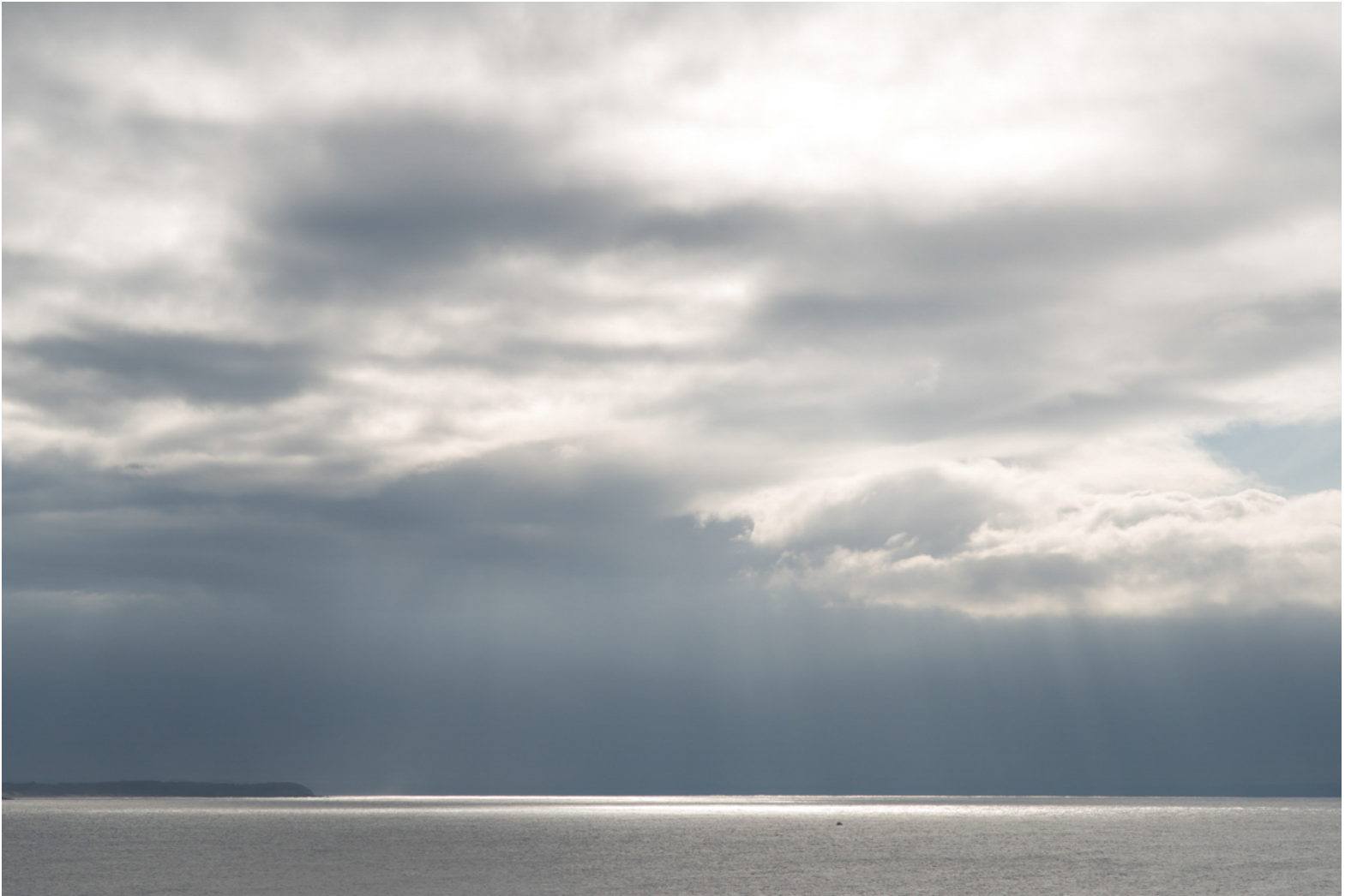
Untitled (DR2014.TAKD19.06.02), 2014. Pigment ink on archival art paper. 150cm x 100cm. (Edition of 6 plus 2AP) $4200 unframed.