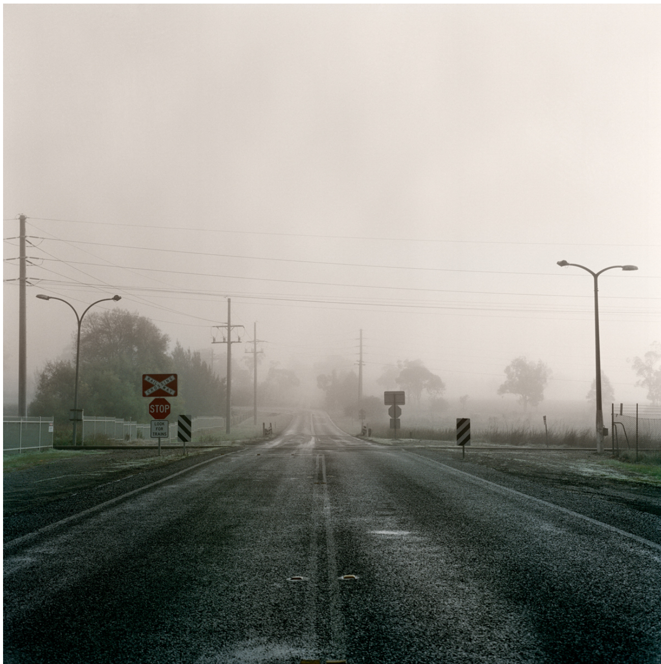
Untitled (DR2012.CW01.06.02), 2012. Pigment ink on archival art paper. 90cm x 90cm. (Edition of 6 plus 2AP) $3100 unframed.