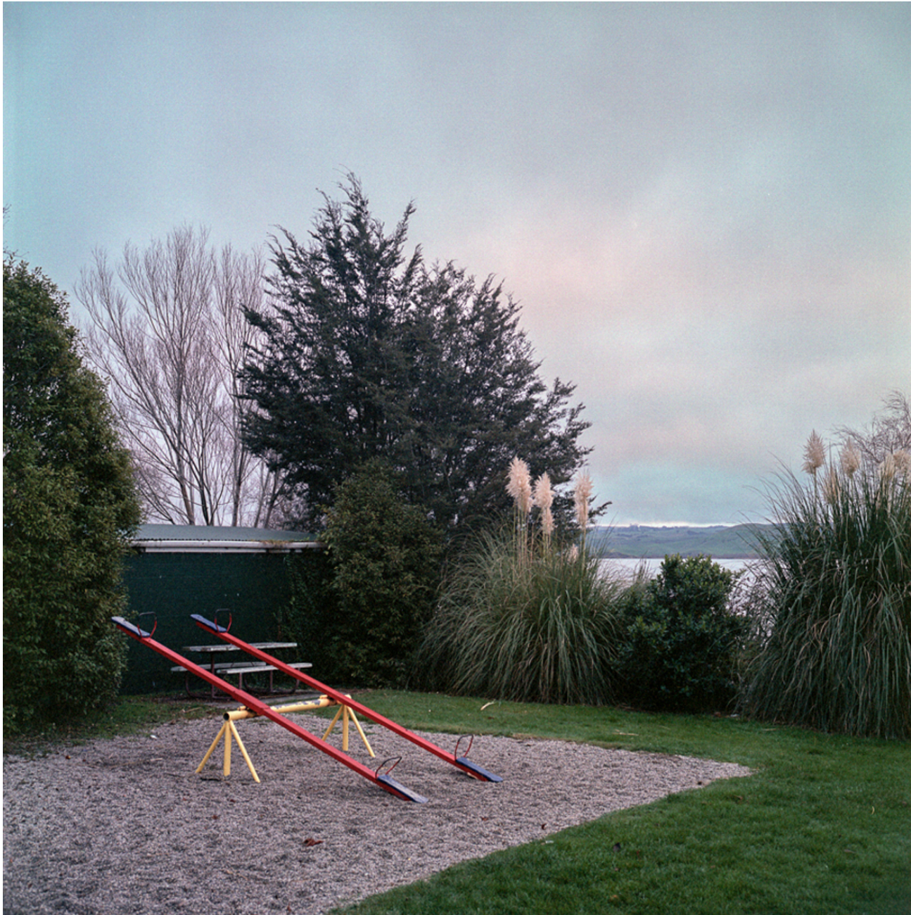
You made me wait , 2012. Pigment ink on archival art paper. 90cm x 90cm. (Edition of 6 plus 2AP) $3100 unframed.