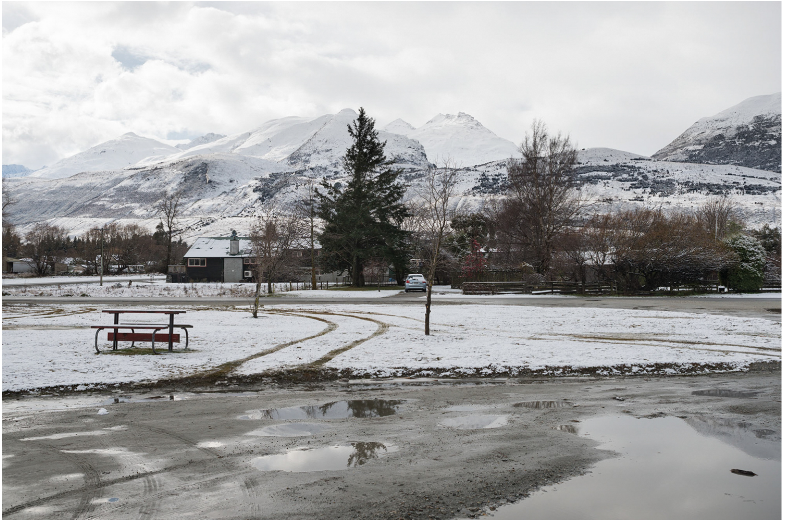
Picnic Table & Mountain , 2016. Pigment ink on archival art paper. 110cm x 73.4cm. (Edition of 4 + 2AP) $3100 unframed. 150cm x 100cm. (Edition of 2 + AP) $4200.00 unframed.