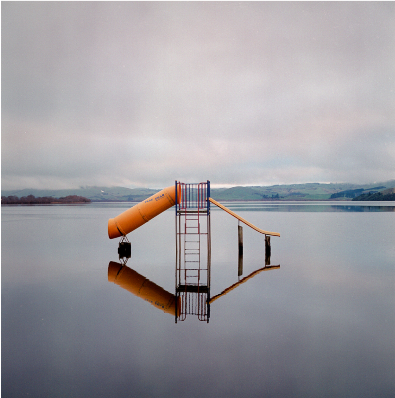
Edge of The Lake , 2012. Pigment ink on archival art paper. 90cm x 90cm. (Edition of 6 plus 2AP) $3100 unframed.