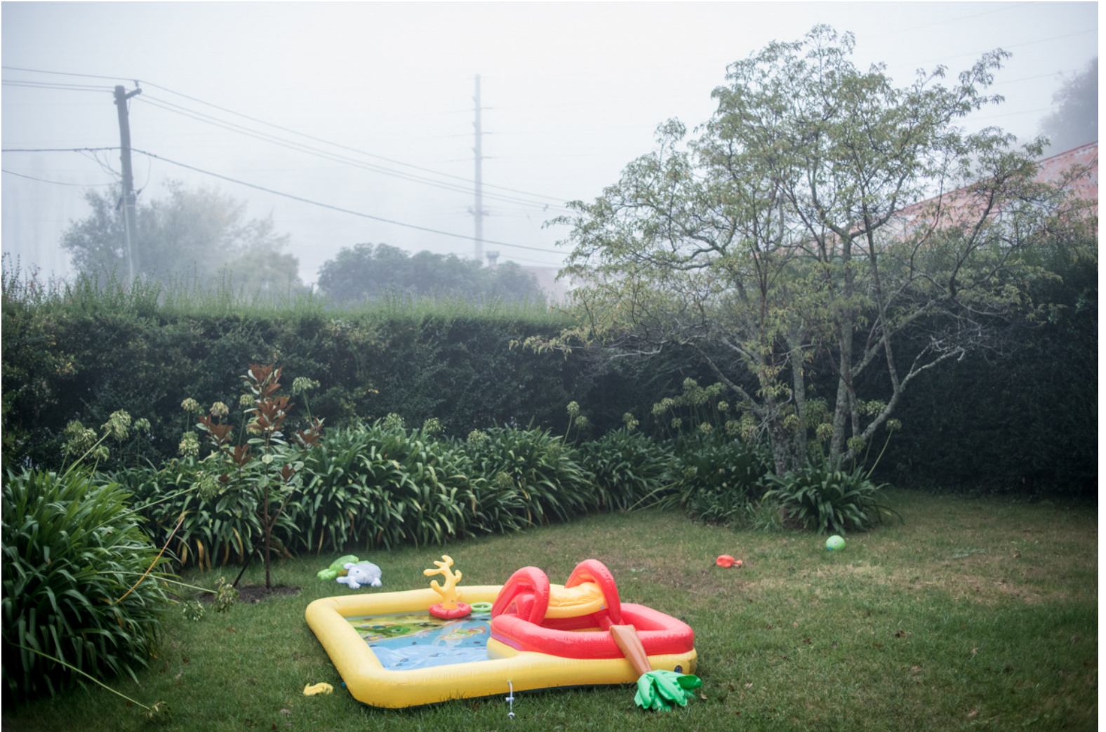
This ain't Kansas Dorothy No.2 , 2014. Pigment ink on archival art paper. 110cm x 73.4cm. (Edition of 6 plus 2AP) $3100 unframed