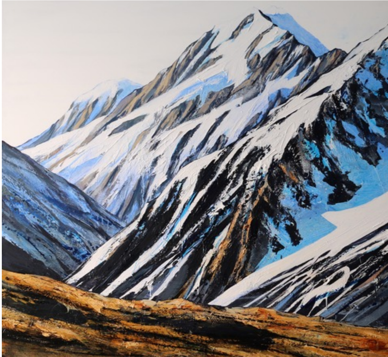
Ice Wall 2017 Acrylic on canvas 197 x 197cm