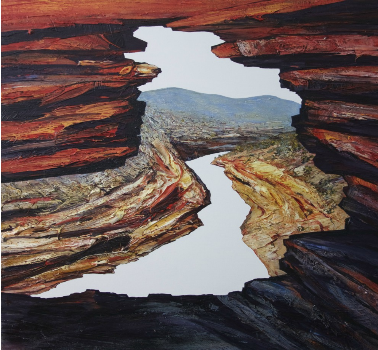
Eye Spy 2013 Acrylic on canvas 112 x 112cm