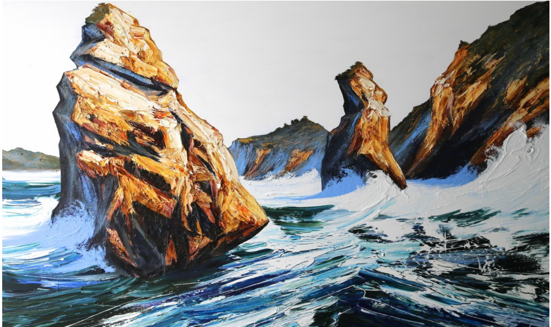
Swept Shore 2019 Acrylic on canvas 195 x 296cm Price (including GST): $40,000