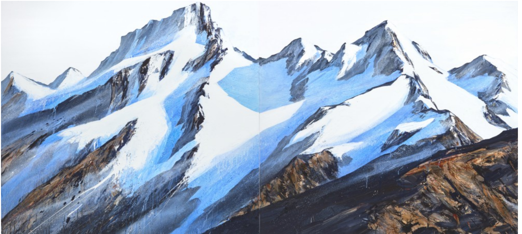
Snow Drop 2017 Acrylic on canvas 153 x 306cm