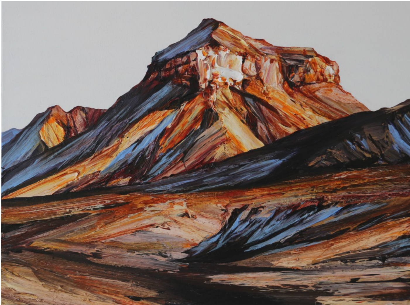
Red Hill 2017 Acrylic on canvas 62 x 81cm