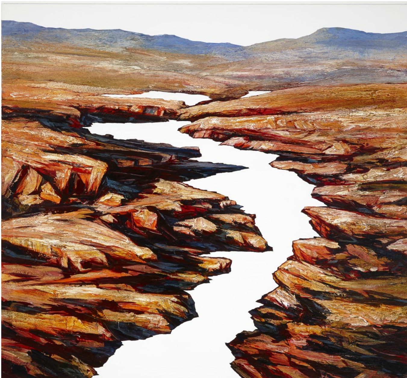
On Point 2014 Acrylic on canvas 198 x 198cm