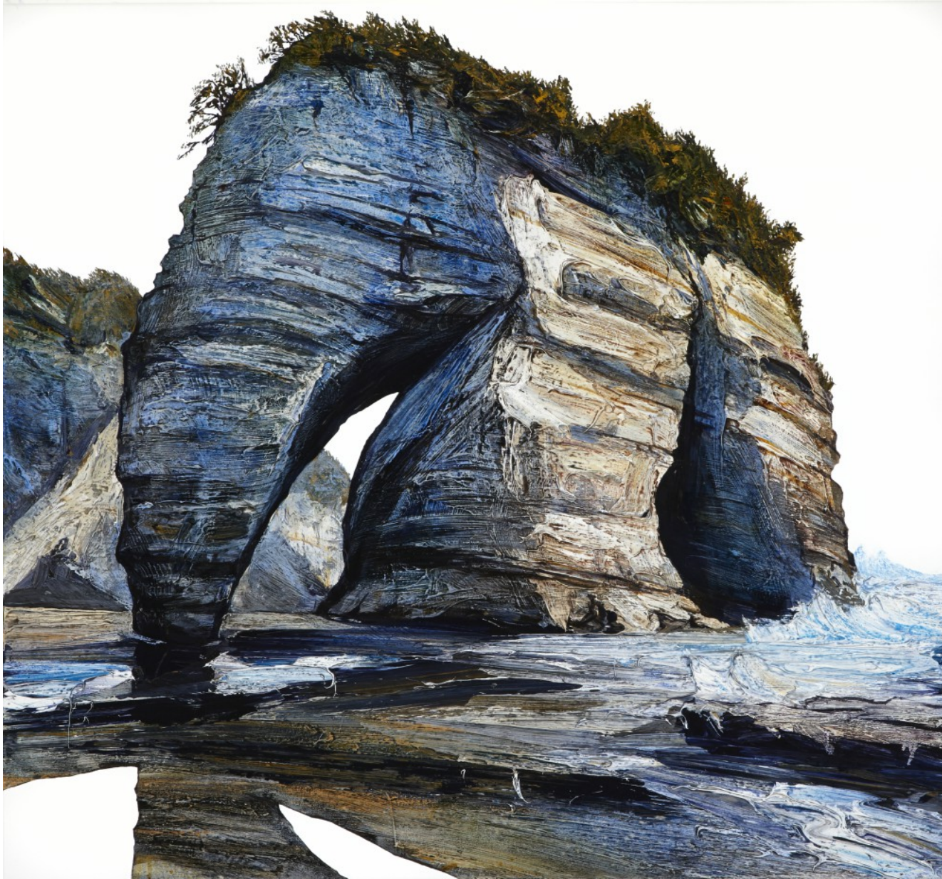
Three Steps 2013 Acrylic on canvas 110 x 110cm