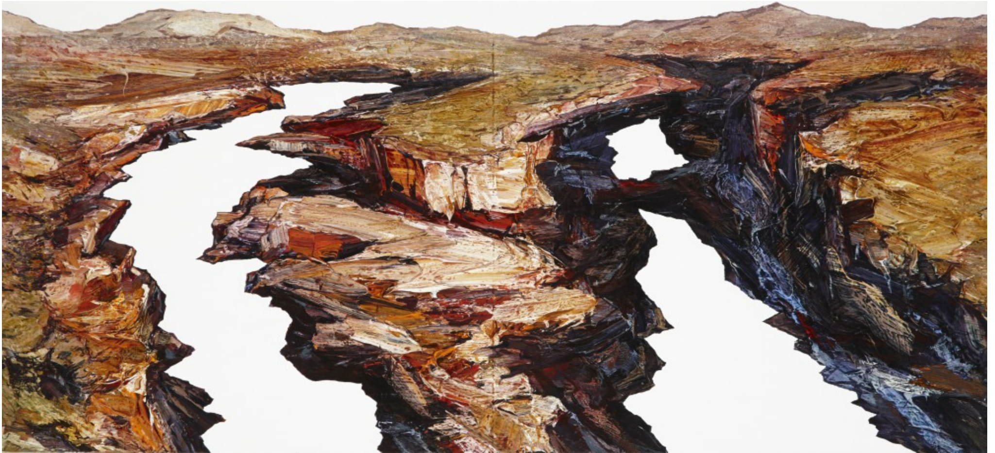
Twin River Study 2014 Acrylic on canvas 65 x 126cm