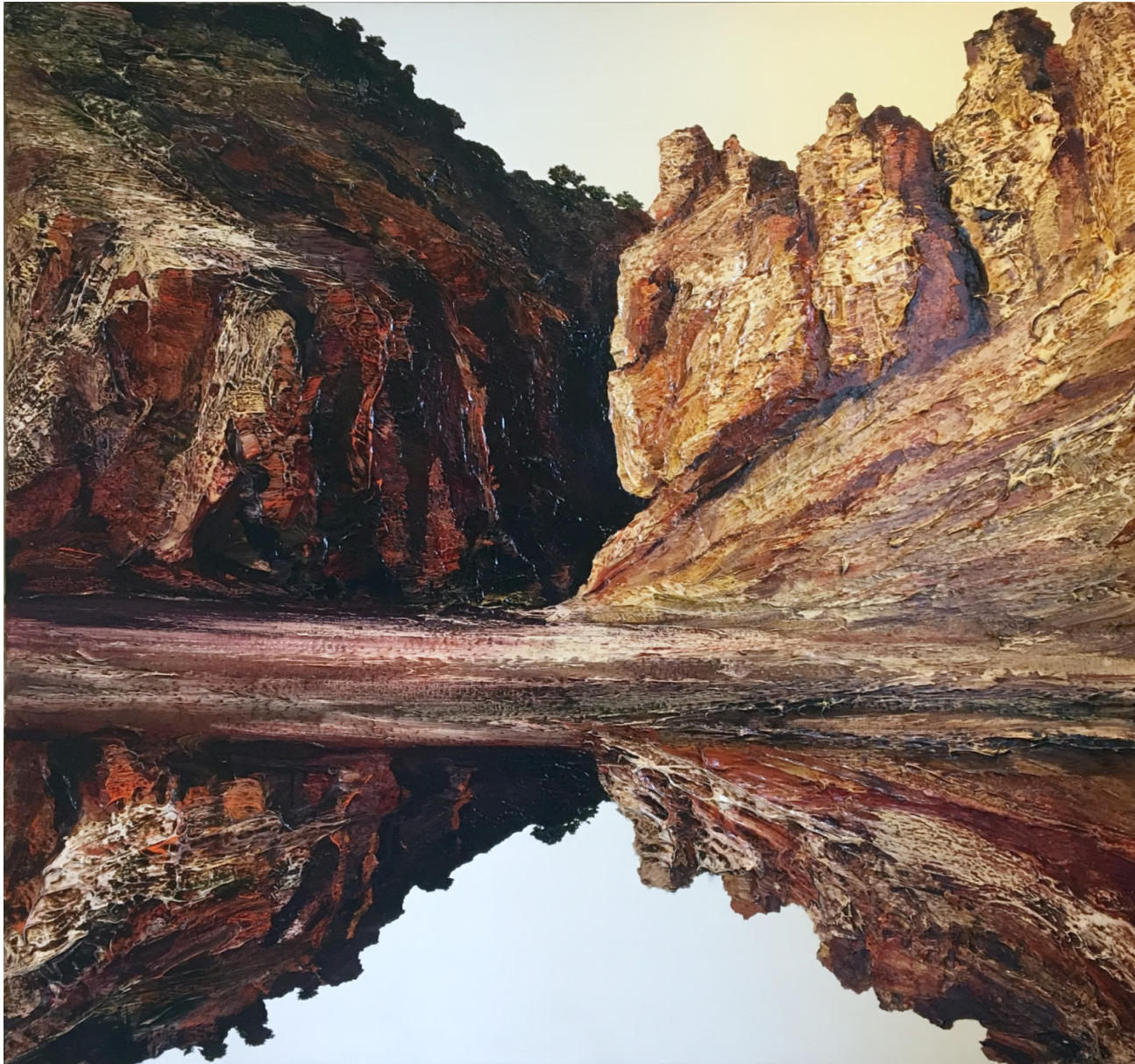
Red Interior 2008 Acrylic on canvas 152 x 152cm