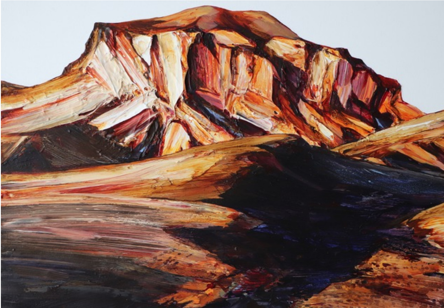
Rusty 2018 Acrylic on canvas 62 x 81cm