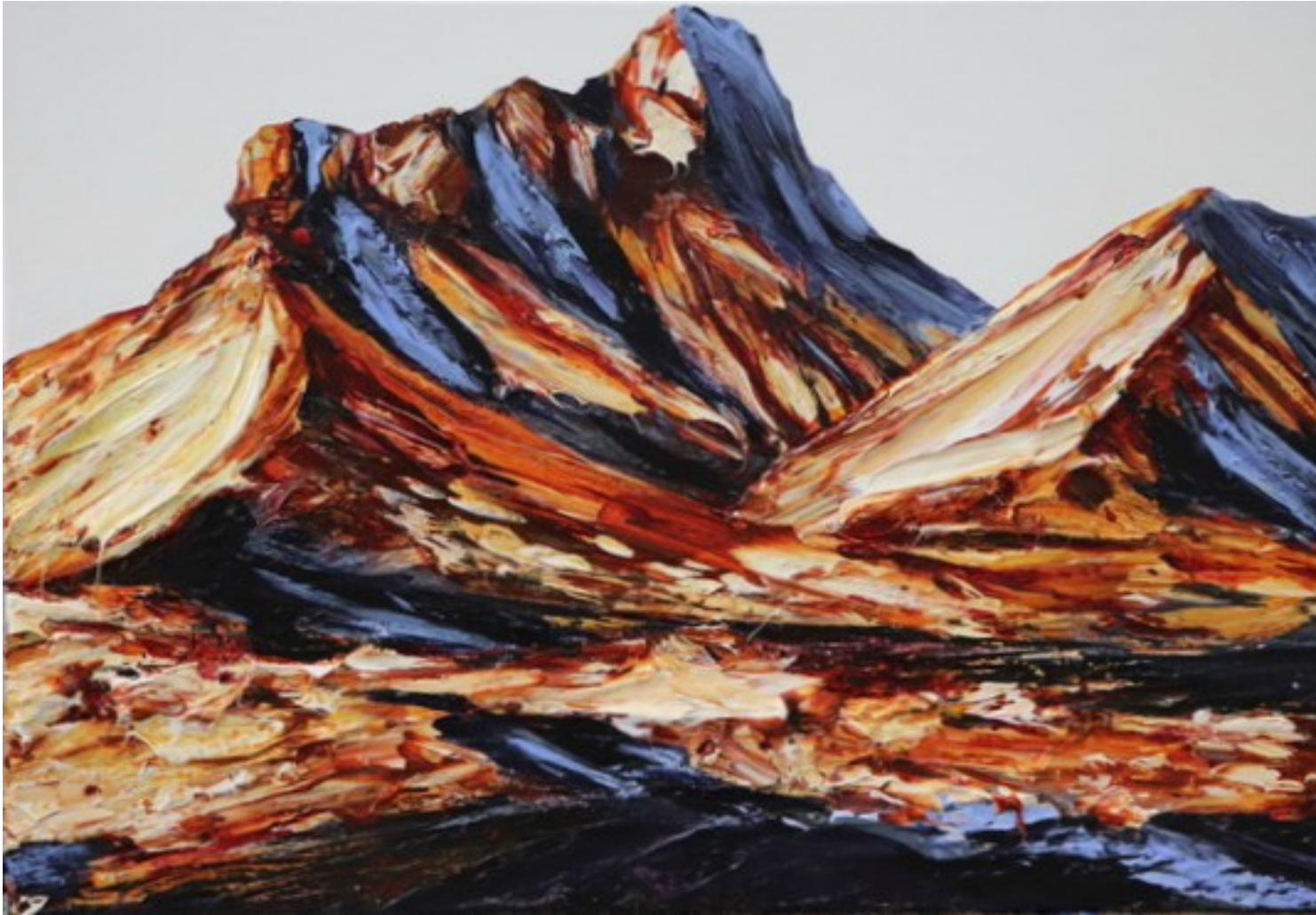
Changing to Blue 2018 Acrylic on canvas 62 x 81cm