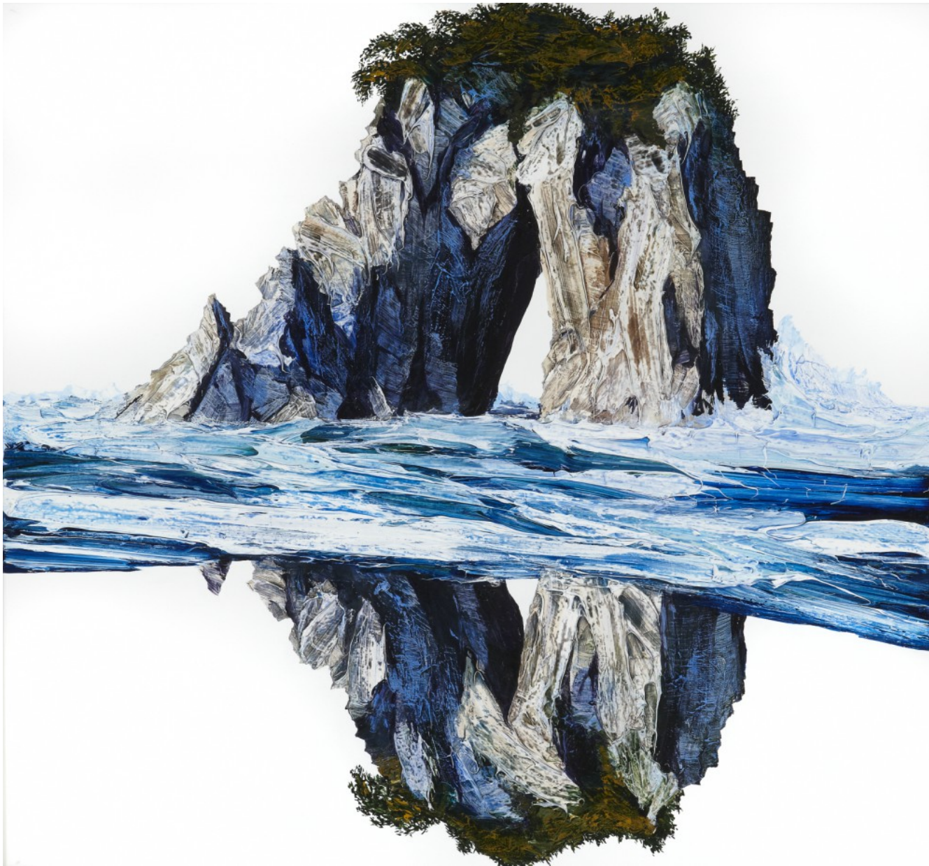
Lash 2013 Acrylic on canvas 112 x 112cm