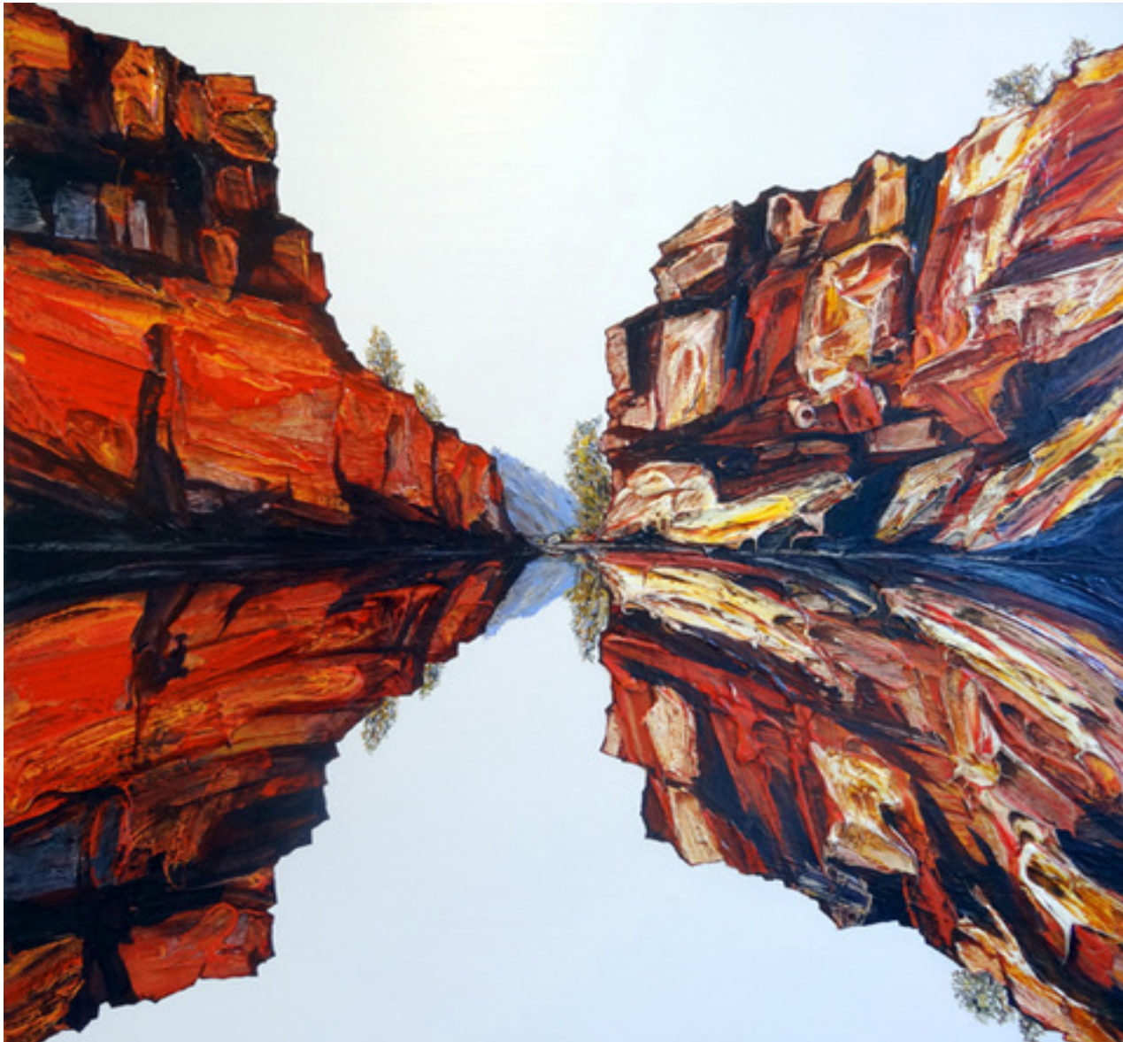
First Point 2014 Acrylic on canvas 112 x 112cm