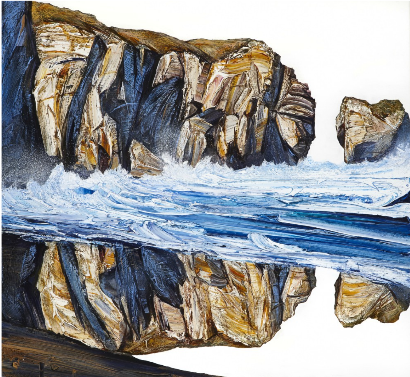
Rocky Bight 2013 Acrylic on canvas 112 x 112cm