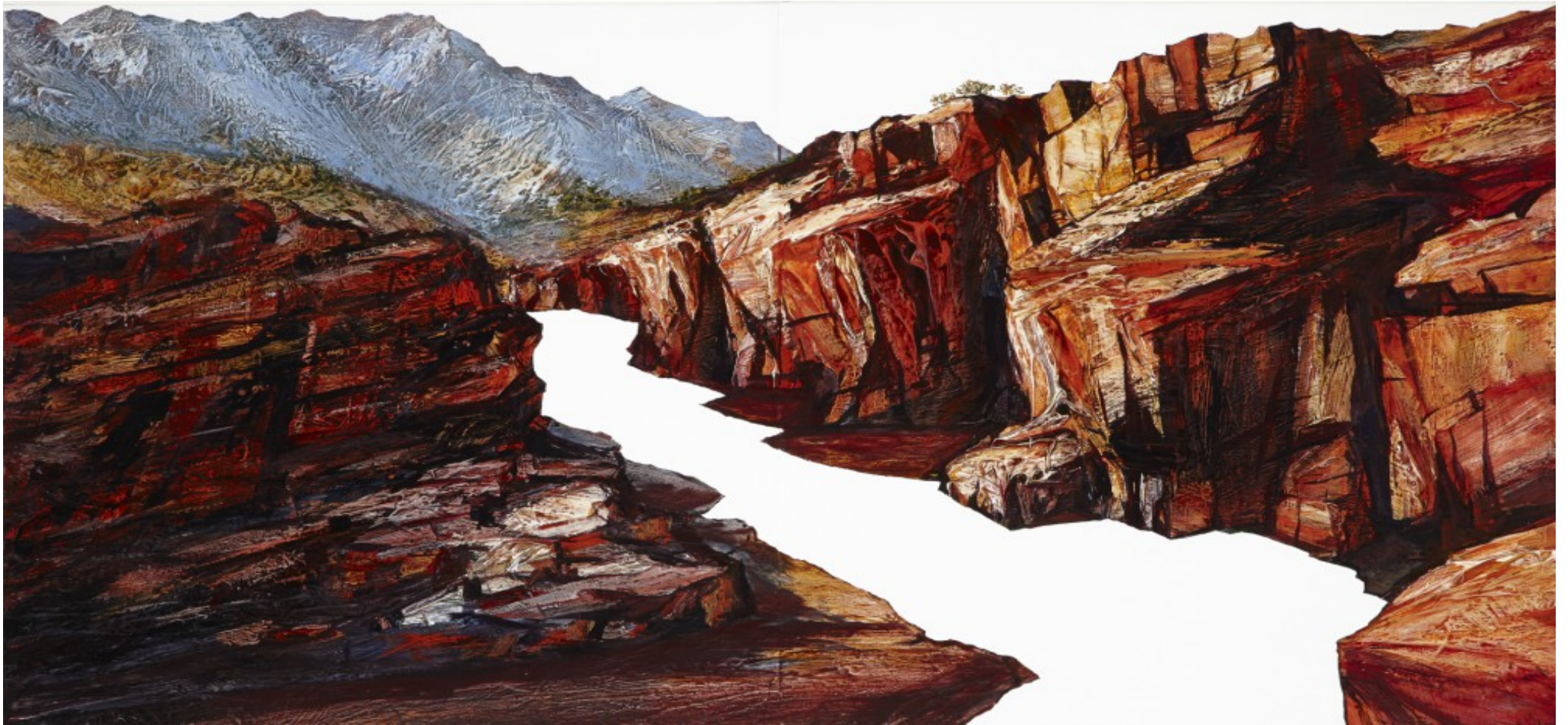
Beyond Red 2014 Acrylic on canvas 80 x 157cm