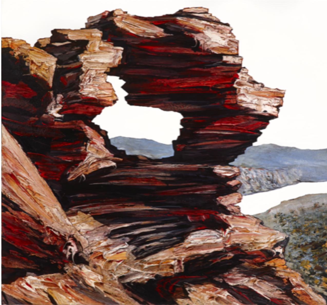
Loop Twist study 2014 Acrylic on canvas 137 x 137cm