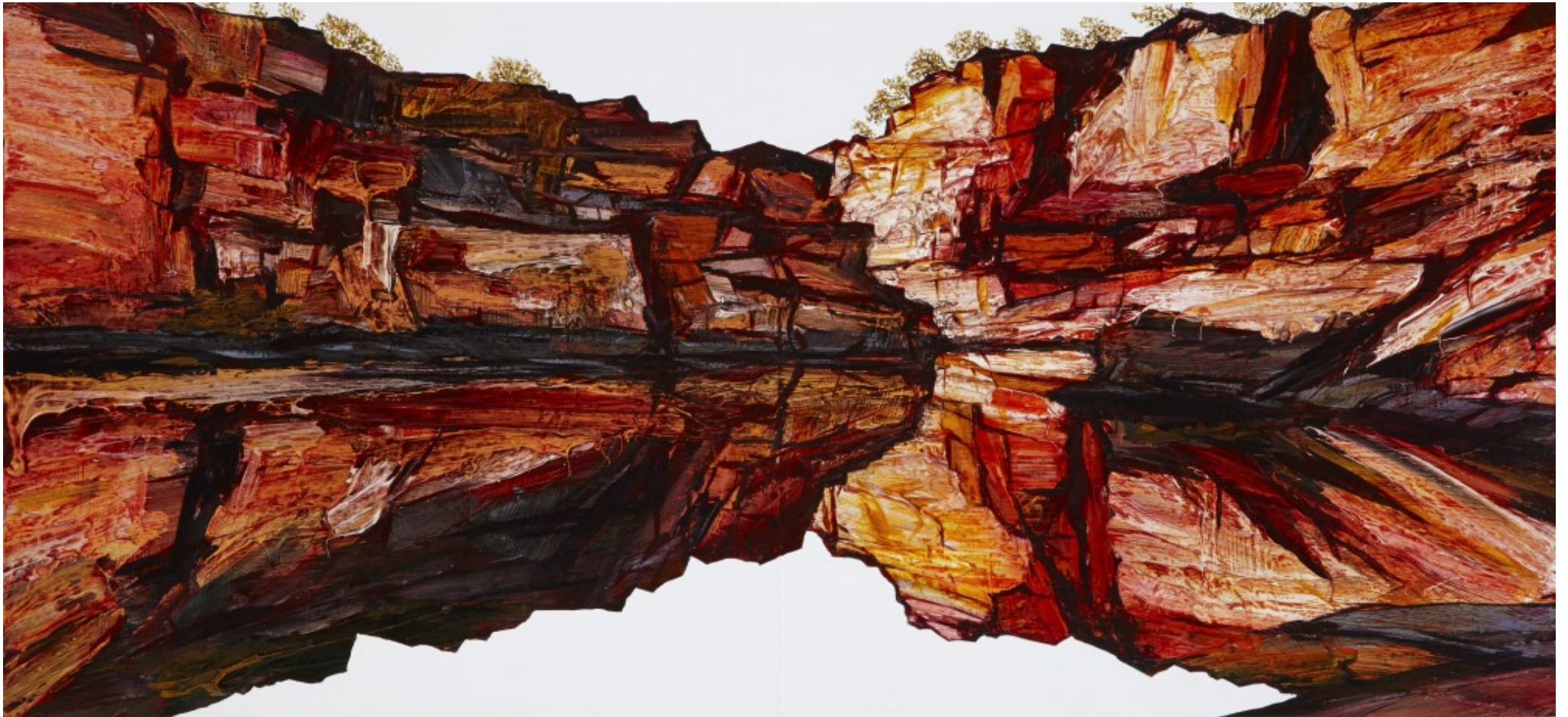
Still Water Red 2014 Acrylic on canvas 65 x 126cm