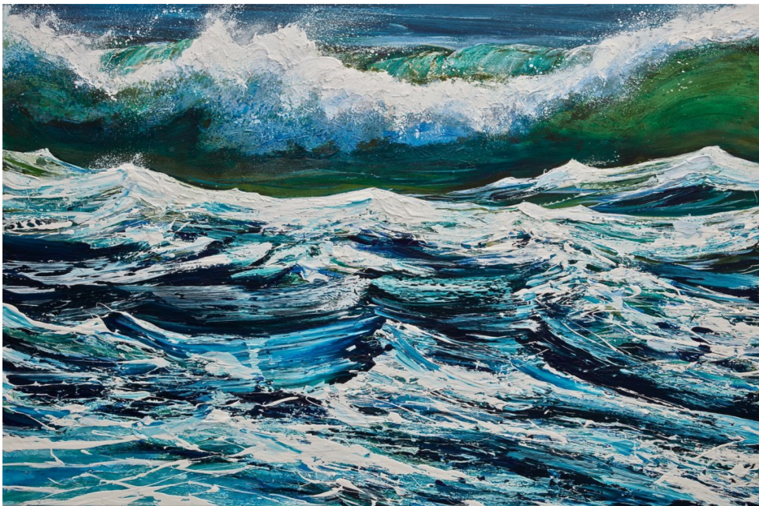
Storm Break 2018 Acrylic on canvas 152 x 212cm Price (including GST): $27,000