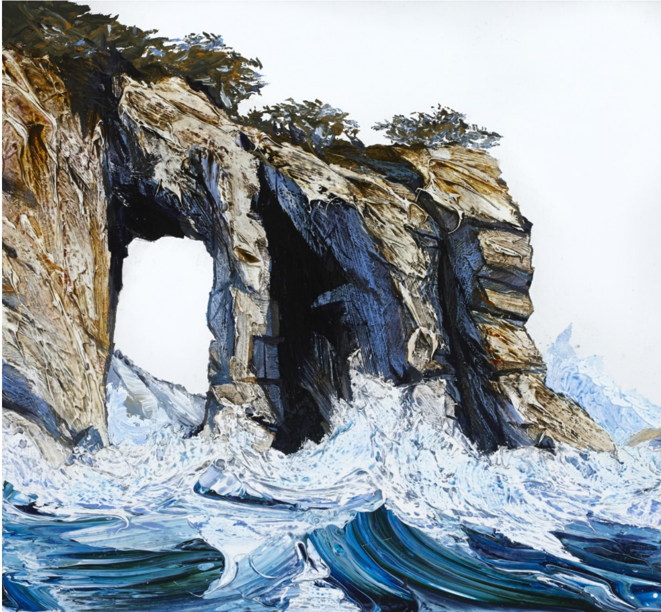
Three Fold 2013 Acrylic on canvas 112 x 112cm