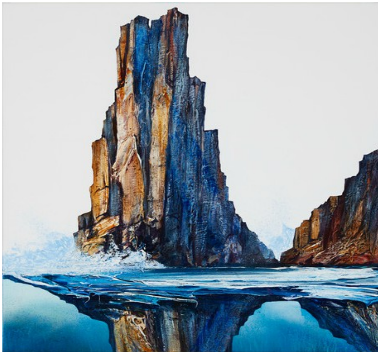
Fin 2016 Acrylic on canvas 76 x 76cm