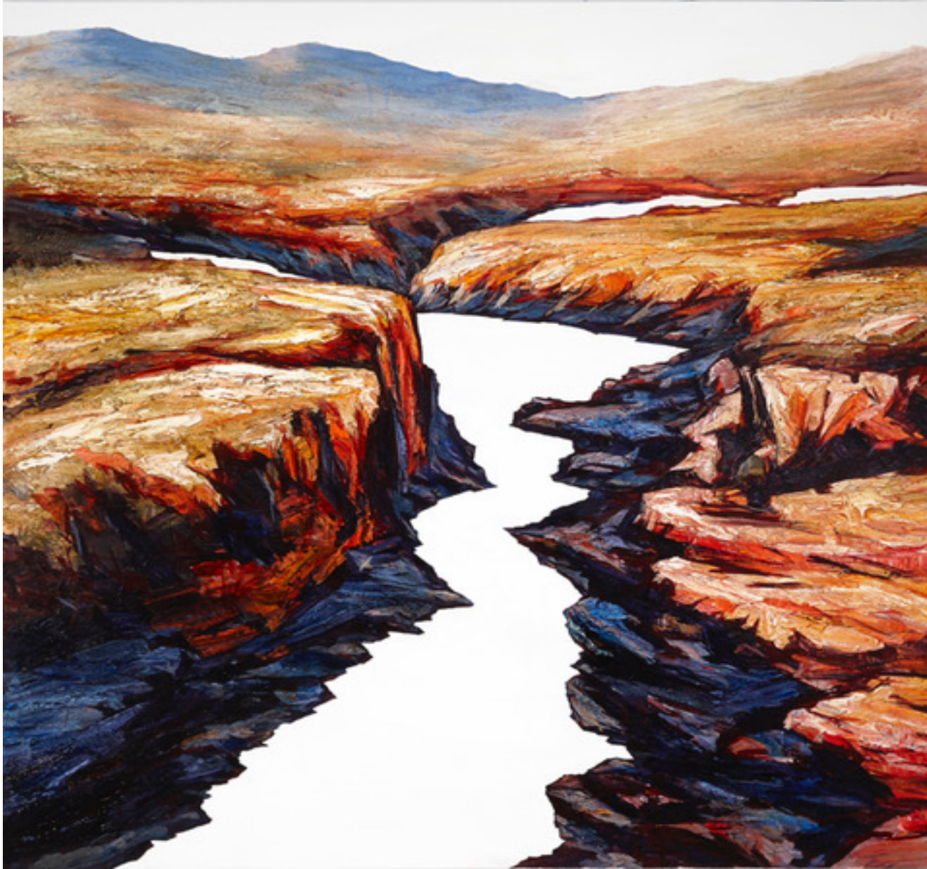
Way Forward 2014 Acrylic on canvas 197 x 197cm