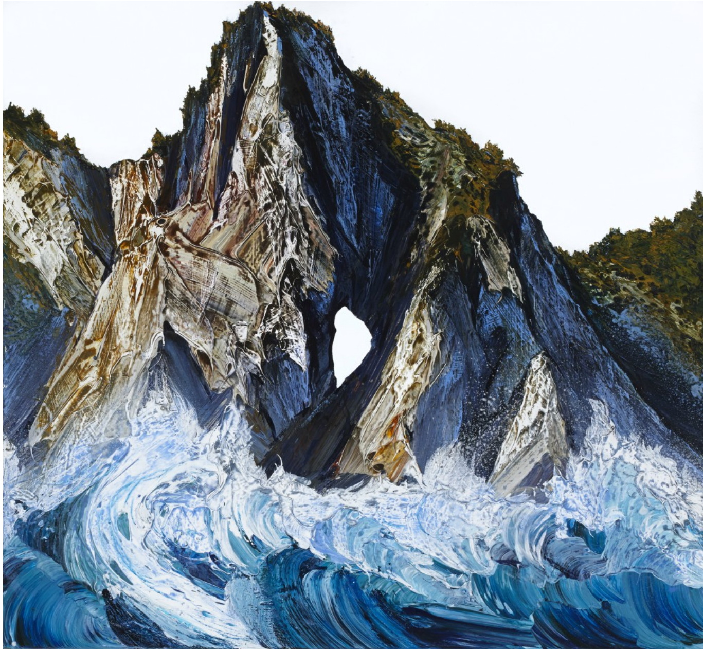
Axis 2013 Acrylic on canvas 76 x 76cm