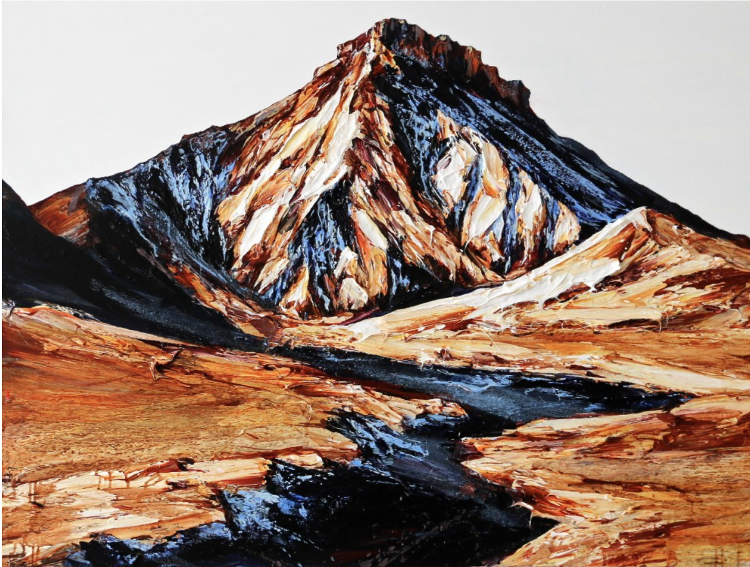
Painted Valley 2018 Acrylic on canvas 112 x 137cm