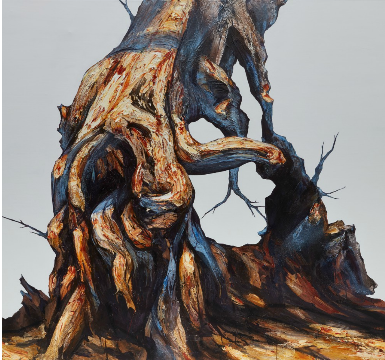
Pieta 2018 Acrylic on canvas 198 x 198cm