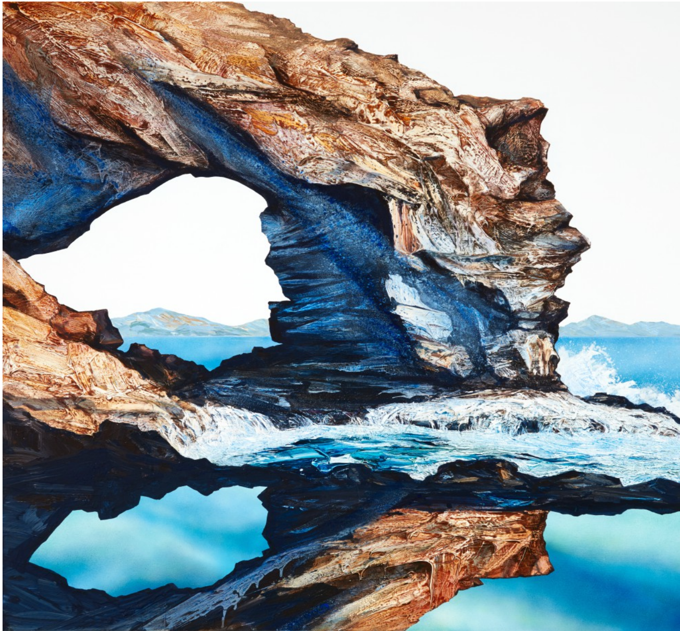
Blue Eyes 2016 Acrylic on canvas 137 x 137cm