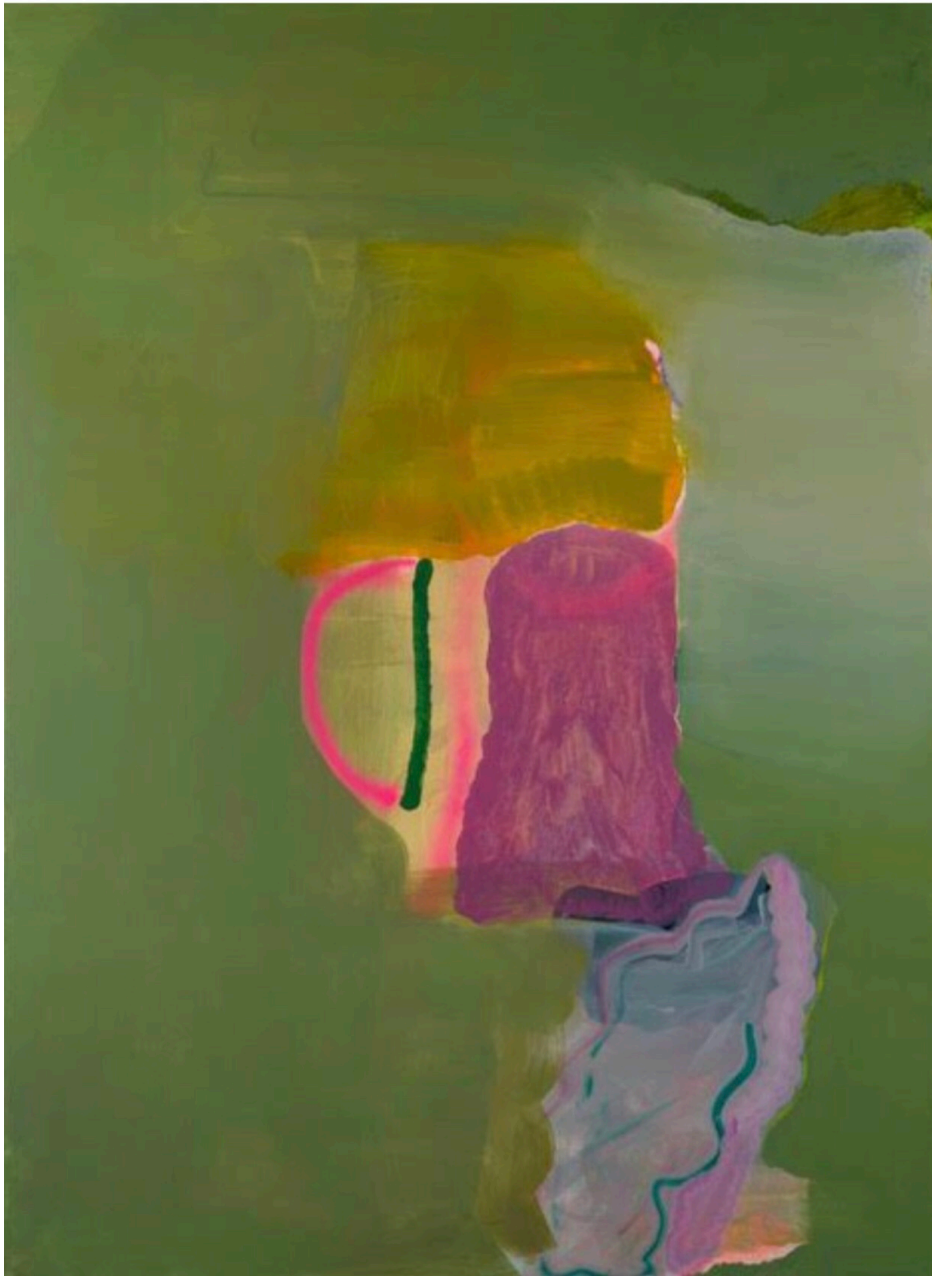
The Etruscans and the Afterlife 2019 168 x 122cm Oil and acrylic on linen