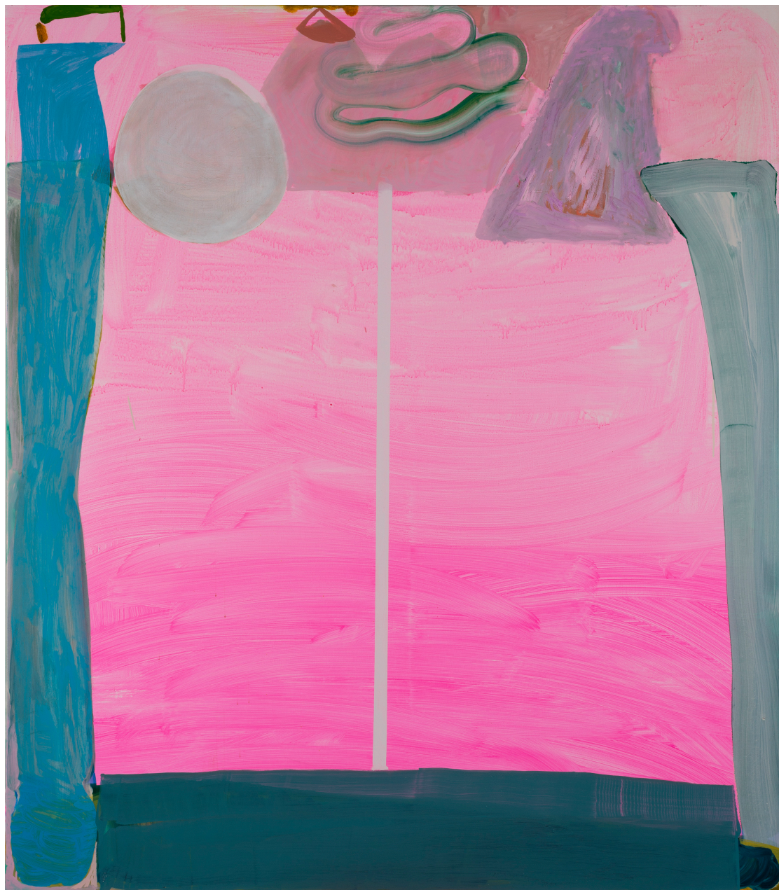
Table Tennis and Skull Mountain 2019 Oil and acrylic on linen 156 x 140cm