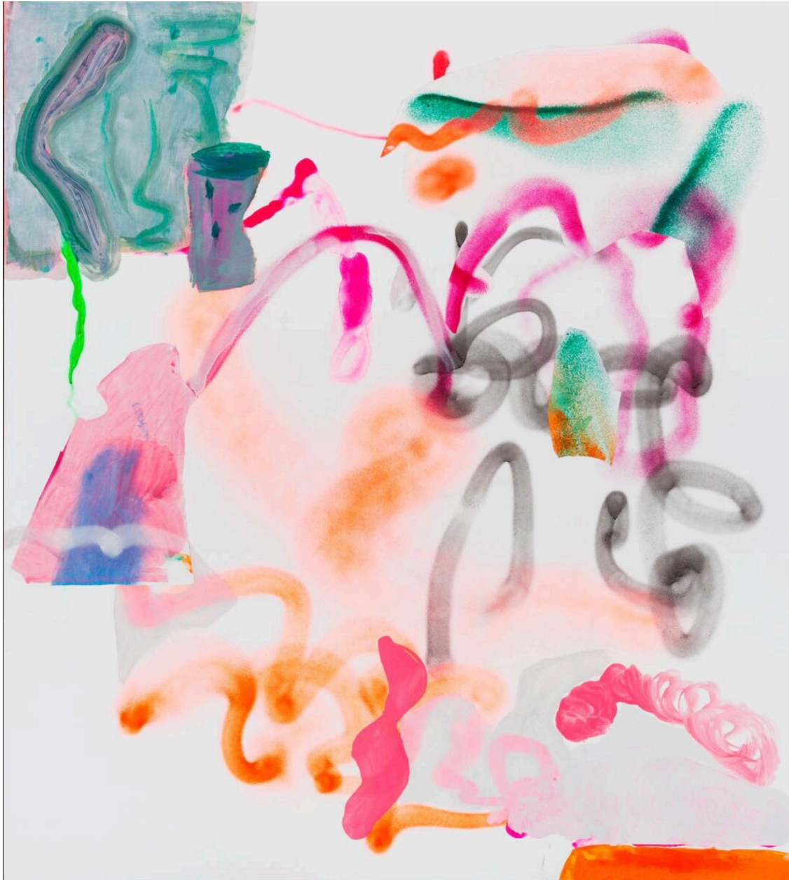
Journey in Satchidananda II 2015 Oil, acrylic and collage on linen 156 x 140cm