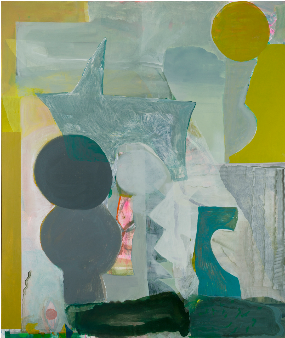
Untitled Tapestry 2017-2018 Oil and acrylic on linen 225 x 185cm