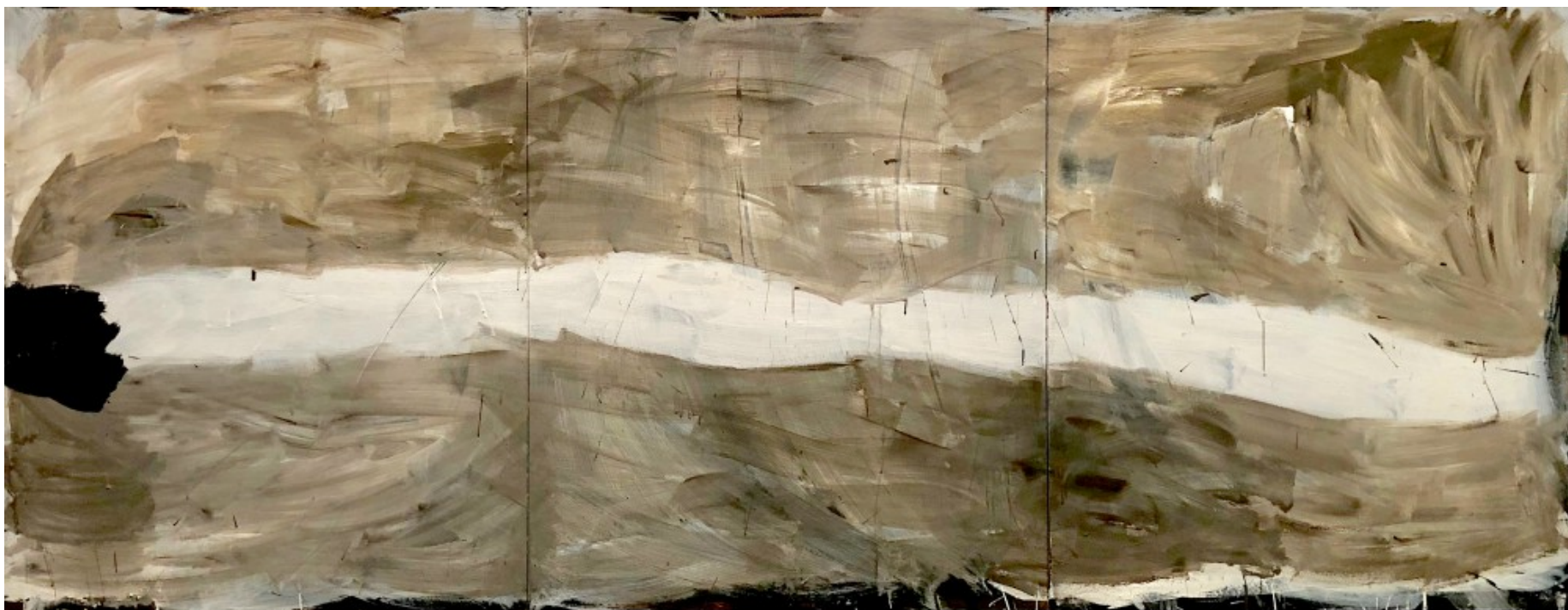
Ever and Ever 2018 Acrylic on board 124 x 315cm