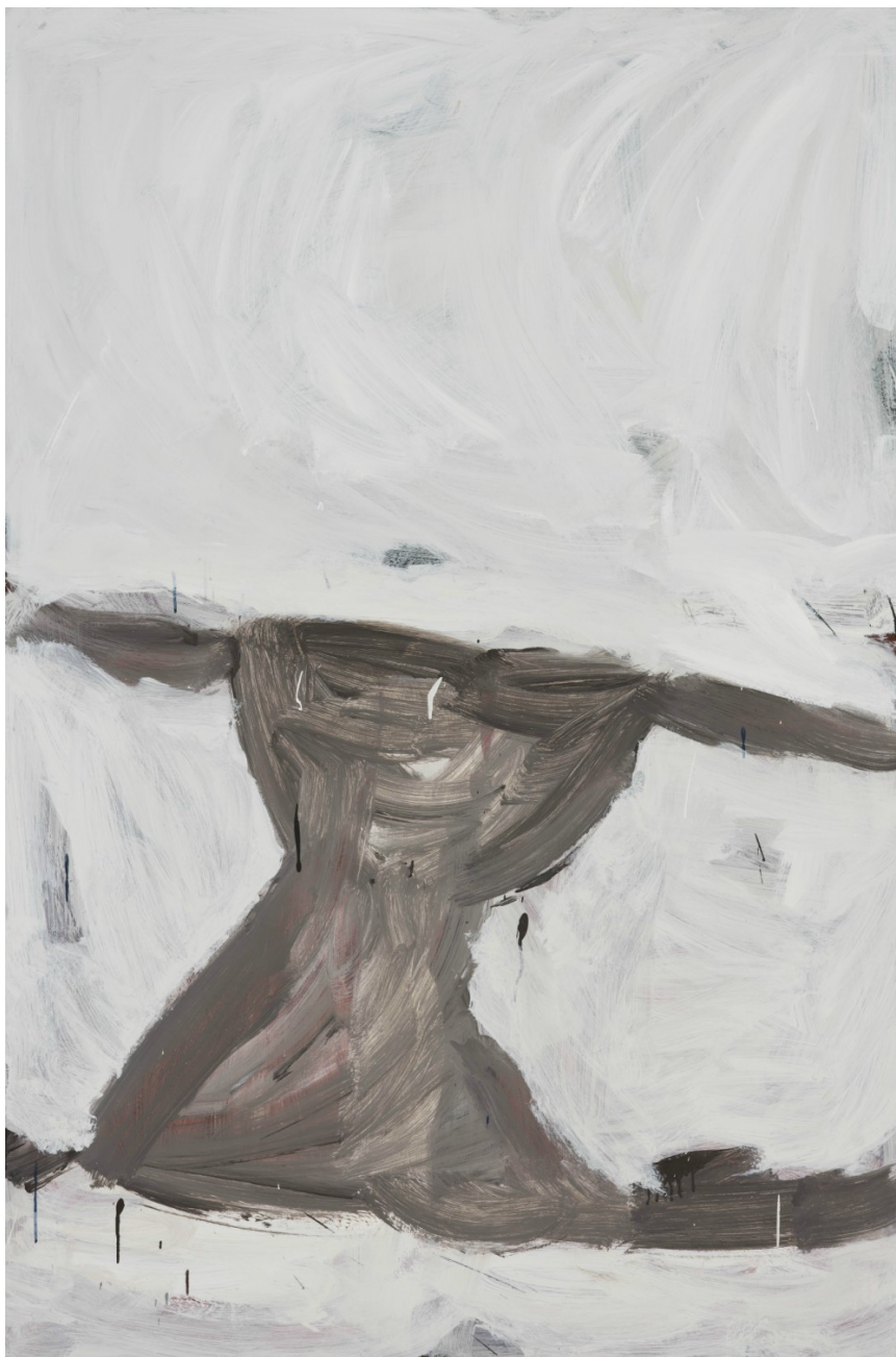
I Put It Here For You To See (1) 2018 acrylic on board 180 x 120cm