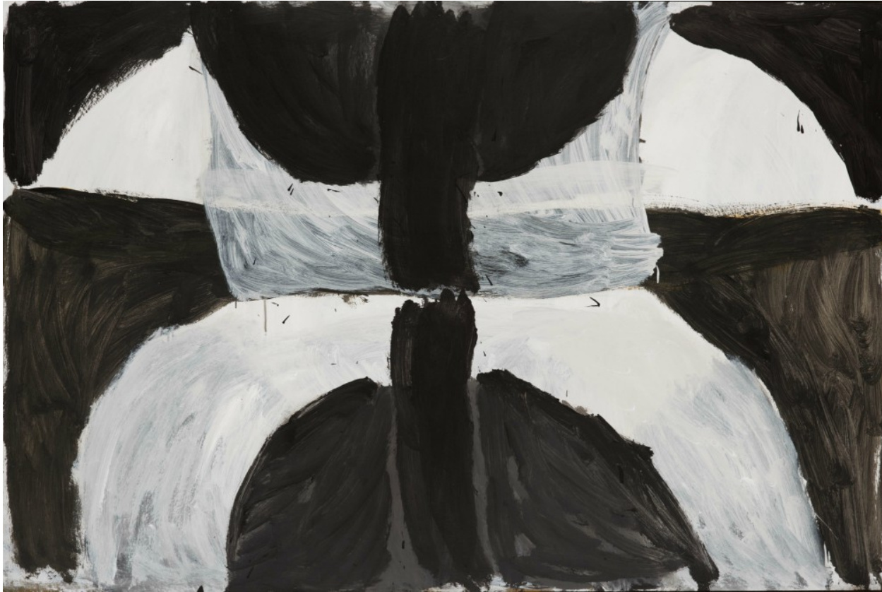
Mimicking Your Endlessness 2018 Acrylic on board 120 x 180cm