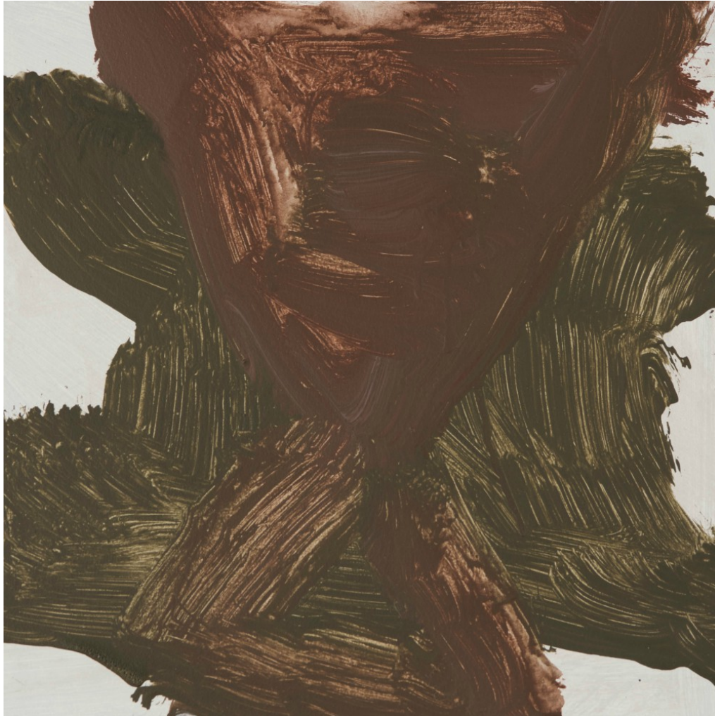
Never End (2) 2018 Acrylic on board 30 x 30cm