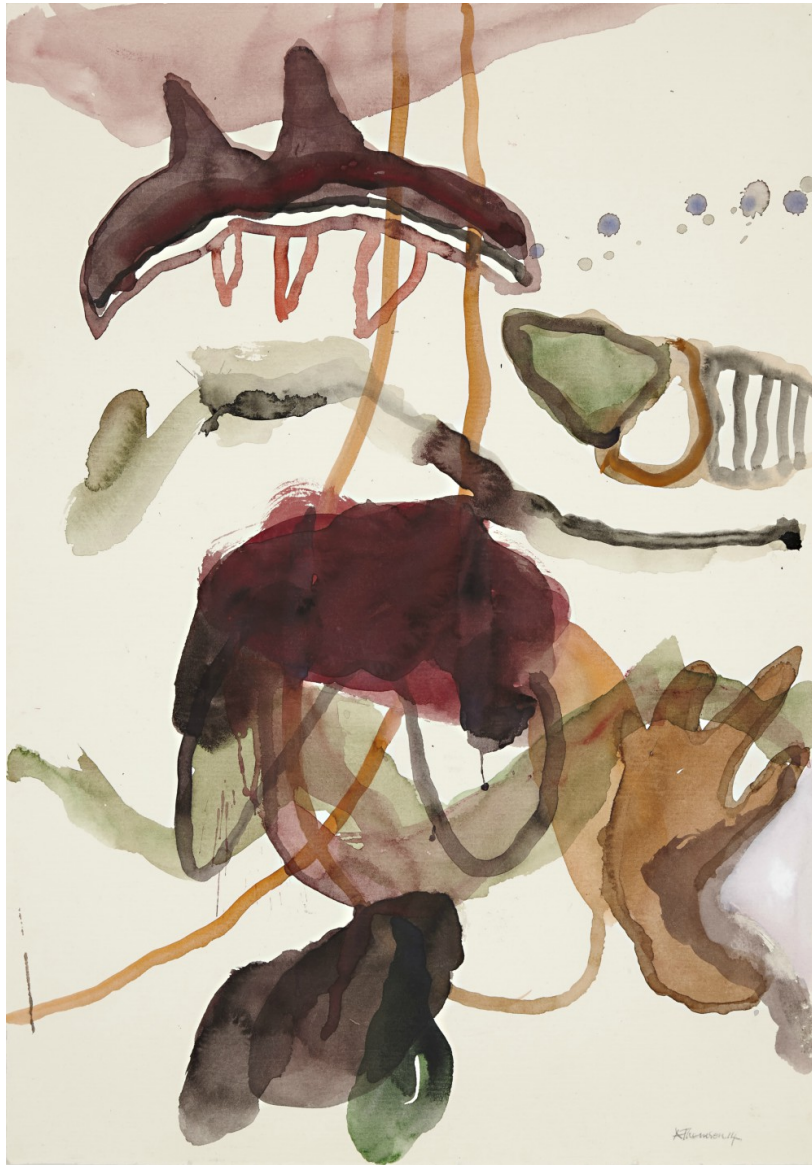
Vibrato II 2014 Gouache on paper 66 x 51.5cm