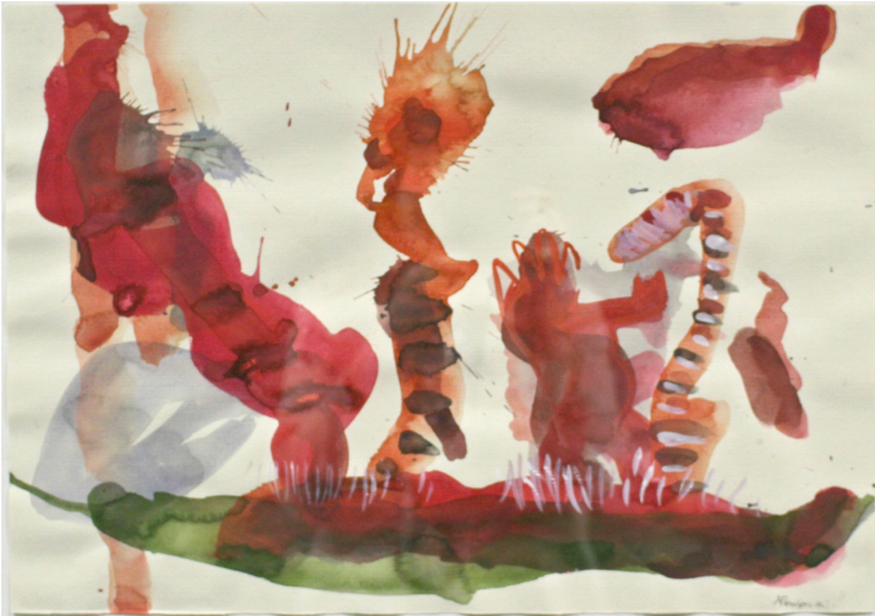
Aria 2014 Gouache on paper 35 x 49cm