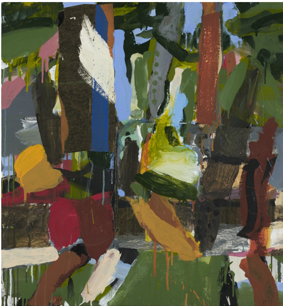
Rainforest II 2017 Acrylic and tarred paper collage on linen 76 x 71cm