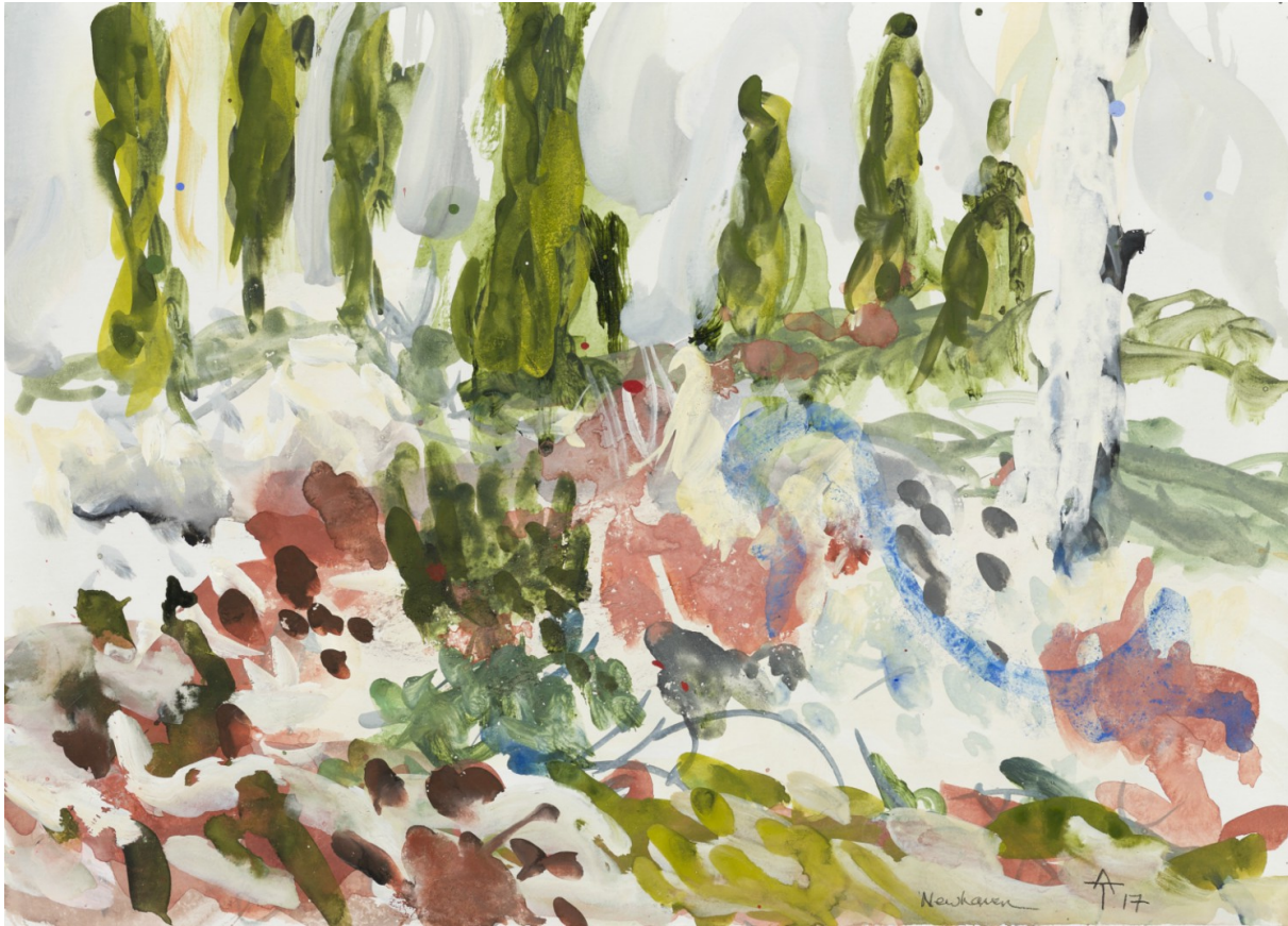
AWC Newhaven Series XXIII 2018 Gouache on paper 28.5 x 35cm