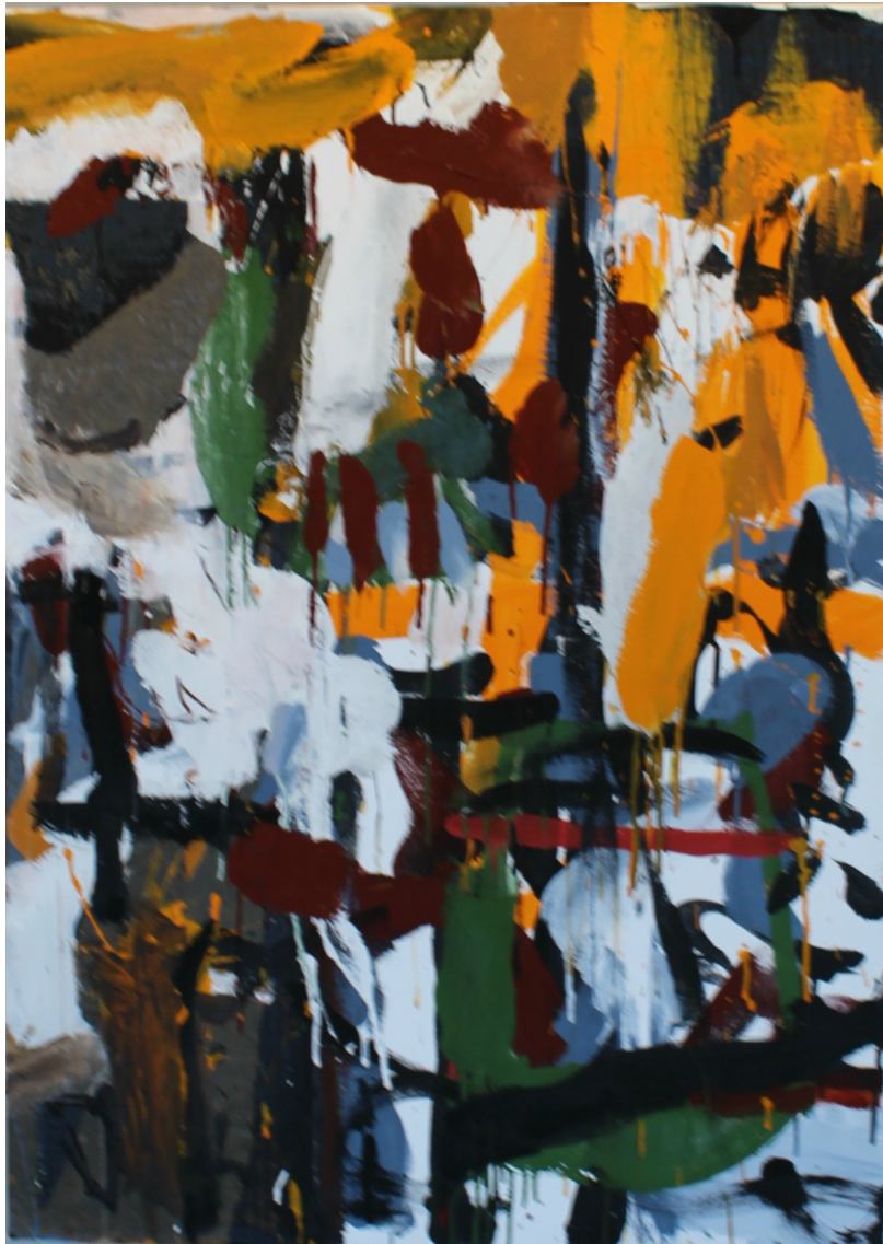
After Hong Kong 2019 Acrylic and tarred paper collage on linen 70 x 60.5cm