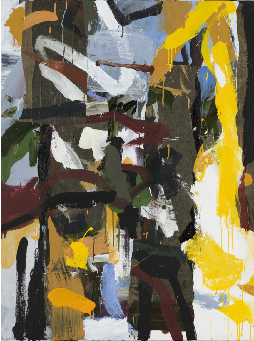
Sun's Force 2017 Acrylic and tarred paper collage on linen 122 x 91.5cm