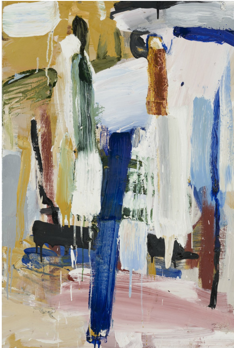
Polarize 2002 Oil on linen 92 x 61cm