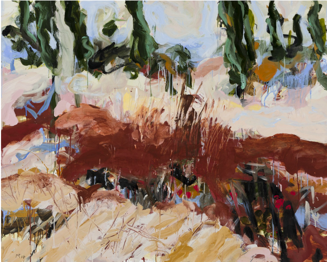
Newhaven VI 2018 Acrylic on canvas 122 x 153cm