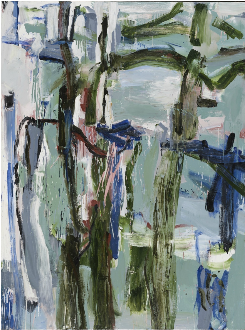
Tidal 2005 Oil on linen 183 x 137cm