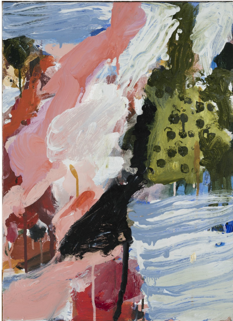
Hill 2019 Acrylic on linen 55.5 x 40.5cm