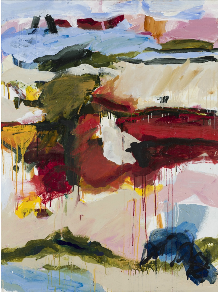
Rising ground 2016 Acrylic on linen 122 x 91cm