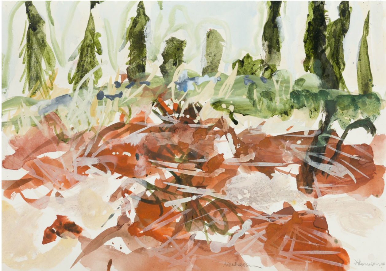
AWC Newhaven Series XV 2018 Gouache on paper 28.5 x 38cm