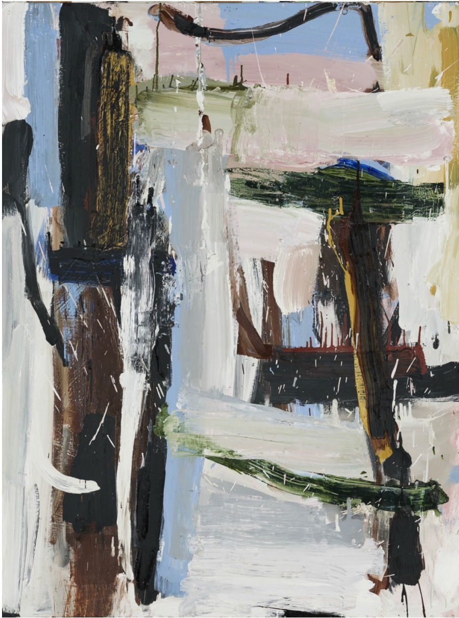
Tempe 2002 Oil on linen 122 x 91.5cm