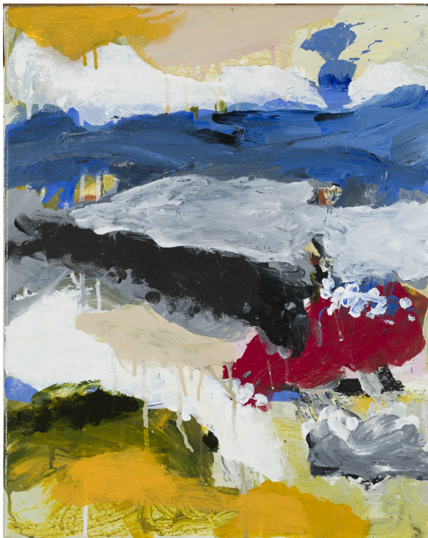
Hill End 2017 Acrylic on linen 50 x 40cm