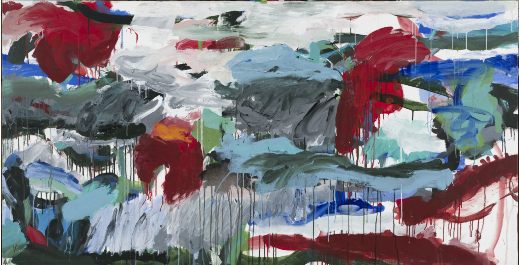
Treble, Reims 2014 Acrylic on linen 104 x 202cm