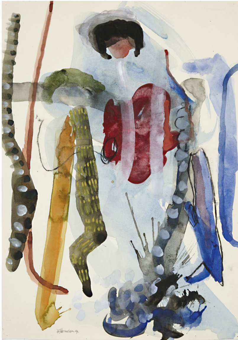
Vibrato IV 2014 Gouache on paper 50 x 35cm