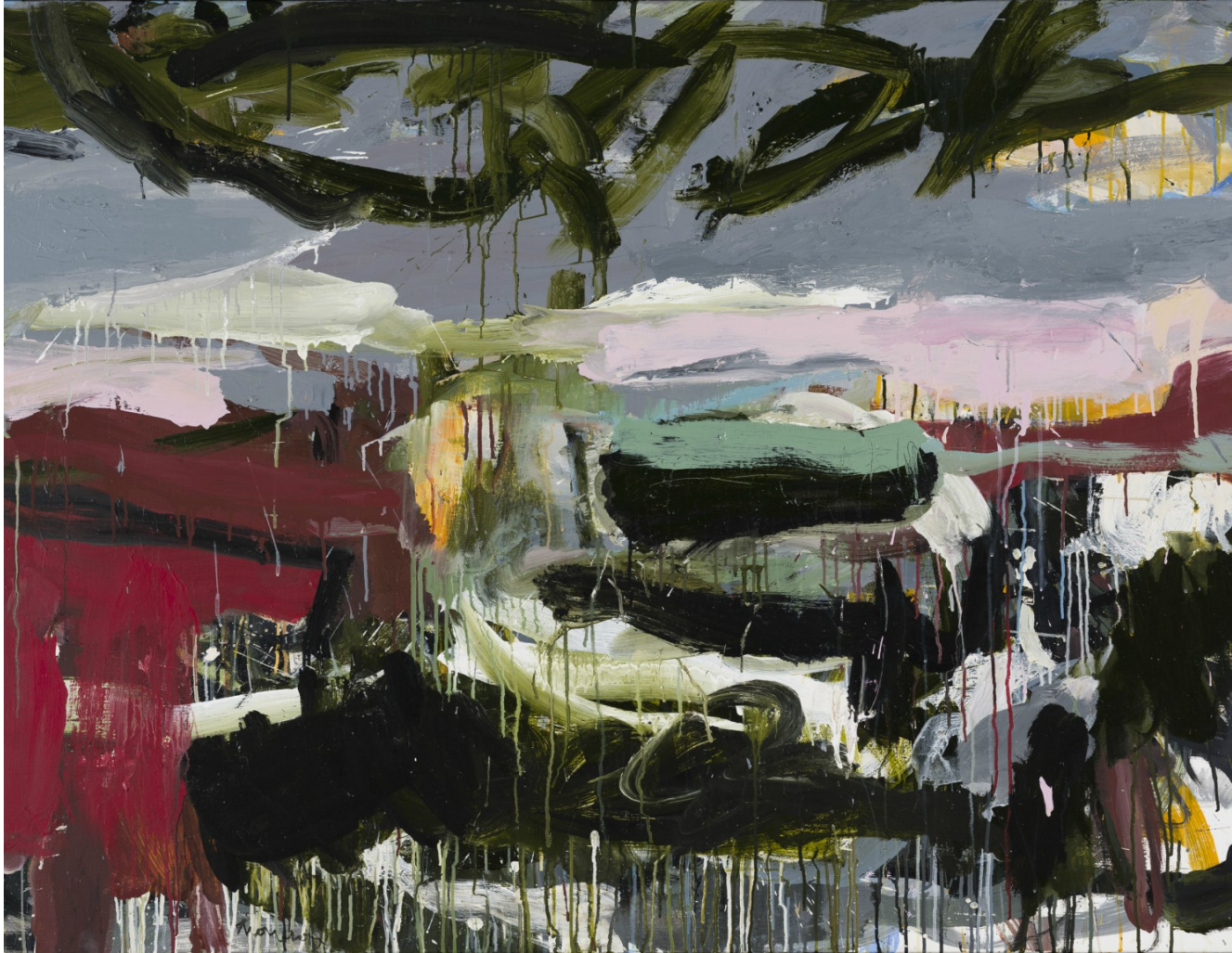
Elegy 2015 Acrylic on linen 122 x 152cm