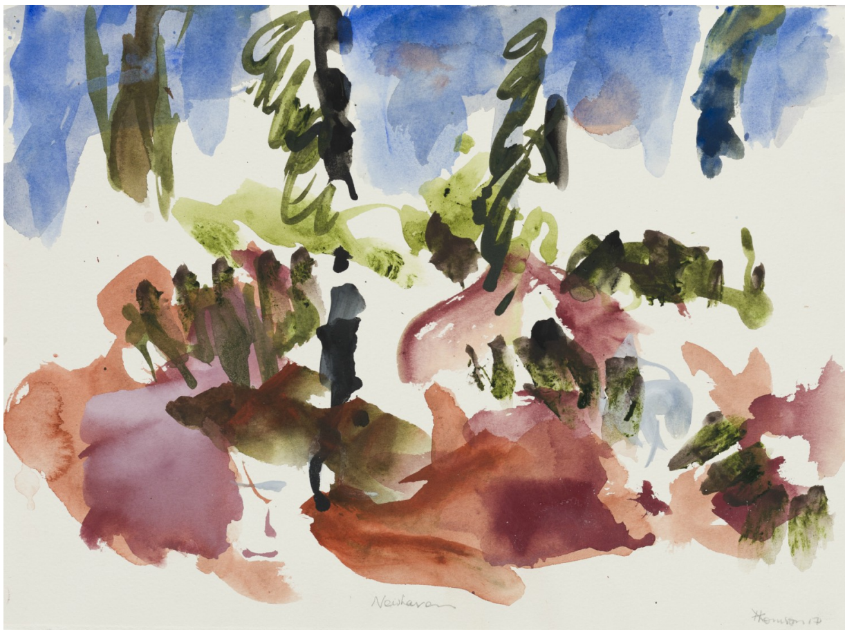
AWC Newhaven Series XXII 2018 Gouache on paper 28.5 x 28cm