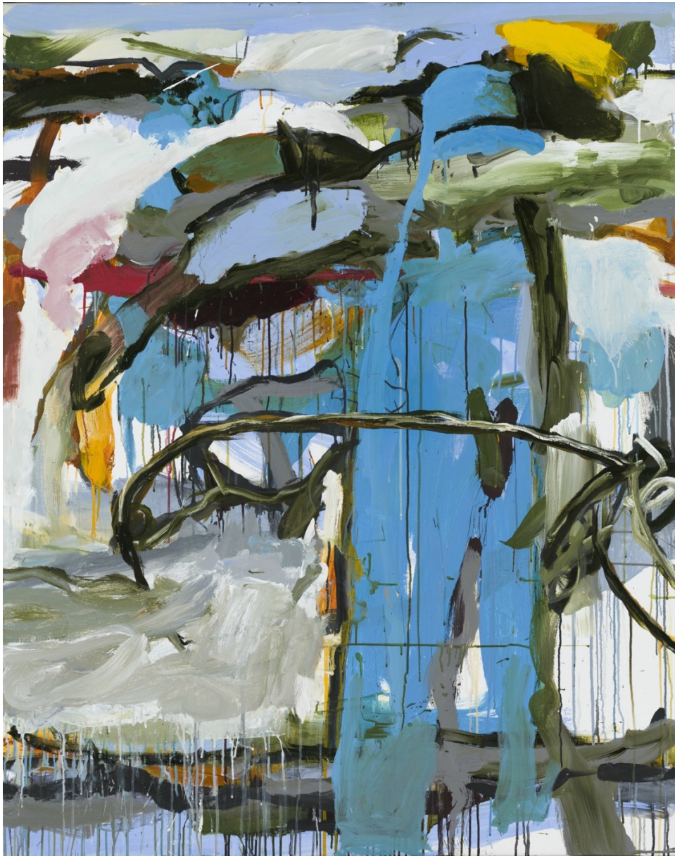
Transition 2018 Acrylic on linen 153 x 122.5cm