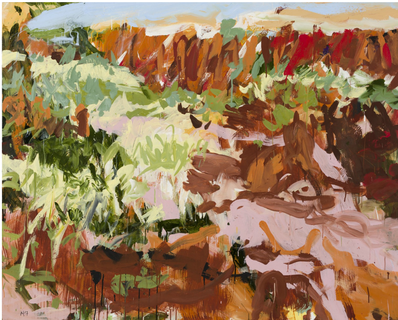
Newhaven IV 2018 Acrylic on canvas 122 x 153cm