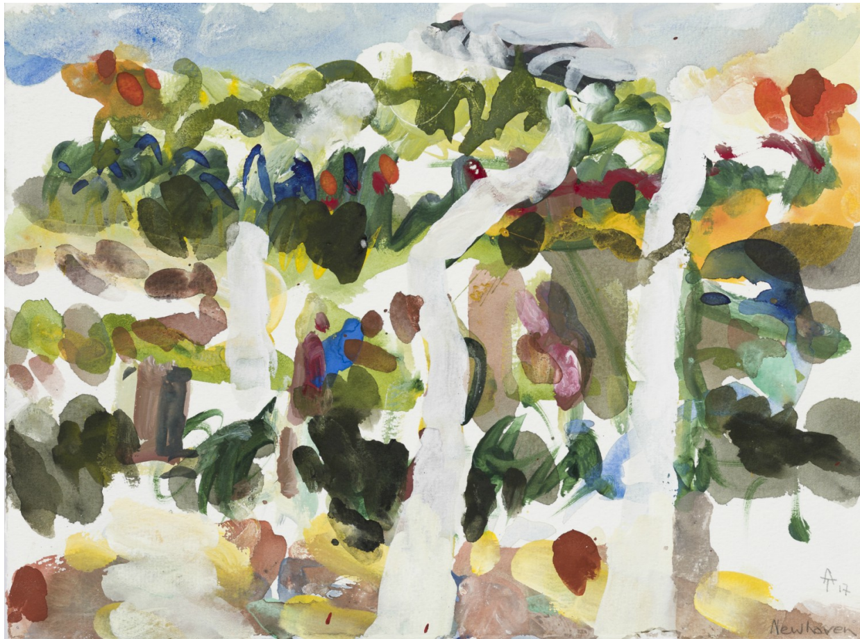
AWC Newhaven Series XXIV 2018 Gouache on paper 28.5 x 38cm