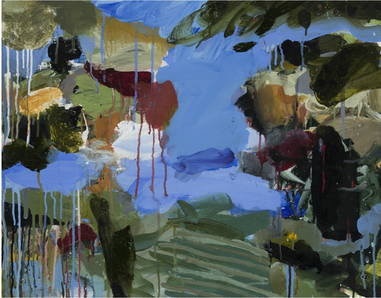
In the Wind 2010 Acrylic on linen 56 x 71.5cm