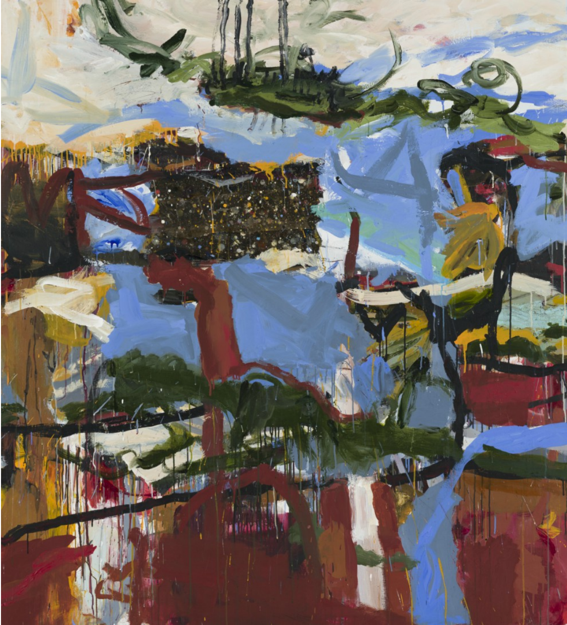
Bizarre Dream 2013

Oil on tarred paper collage on linen 183 x 167cm