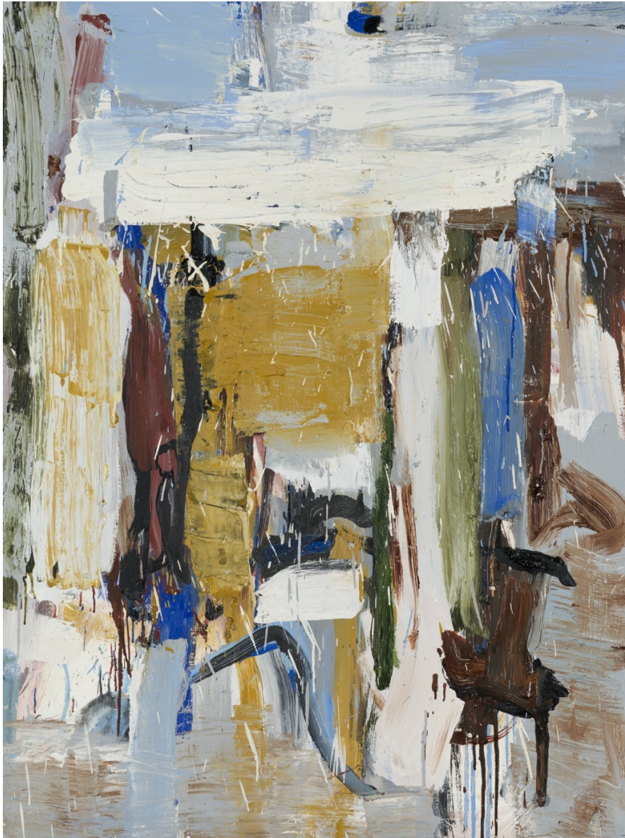
Sea Eagle 2002 Acrylic on linen 122 x 91cm