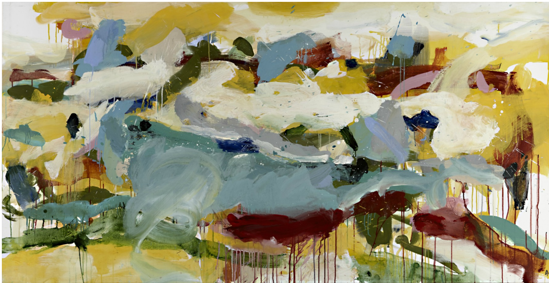
Orion 2014 Acrylic on linen 102 x 200cm