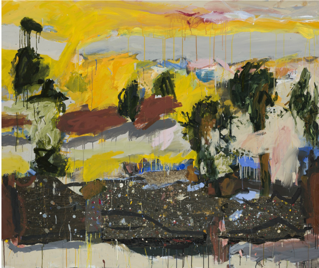
Quantum Morning 2014-2016 Acrylic and tarred paper collage on linen 152.5 x 183cm