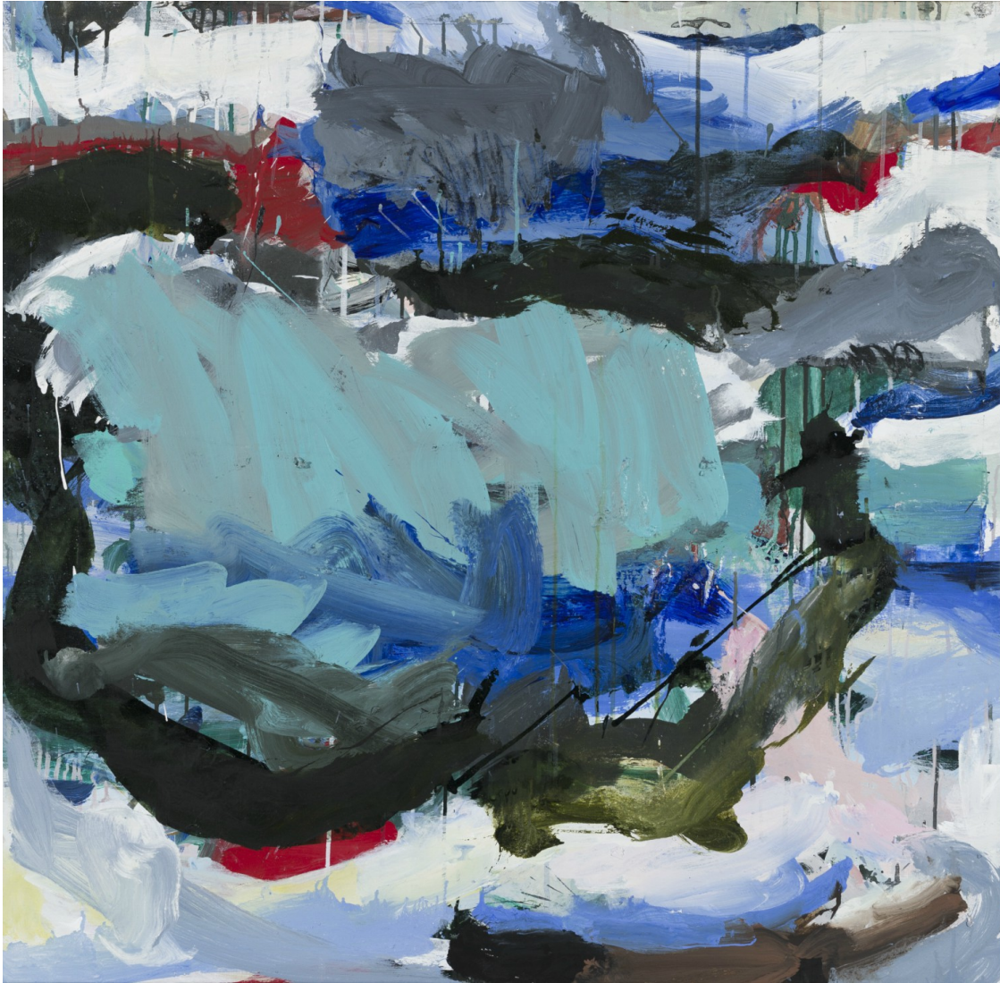
Ceil, Reims 2014 Acrylic on linen 96 x 97.5cm