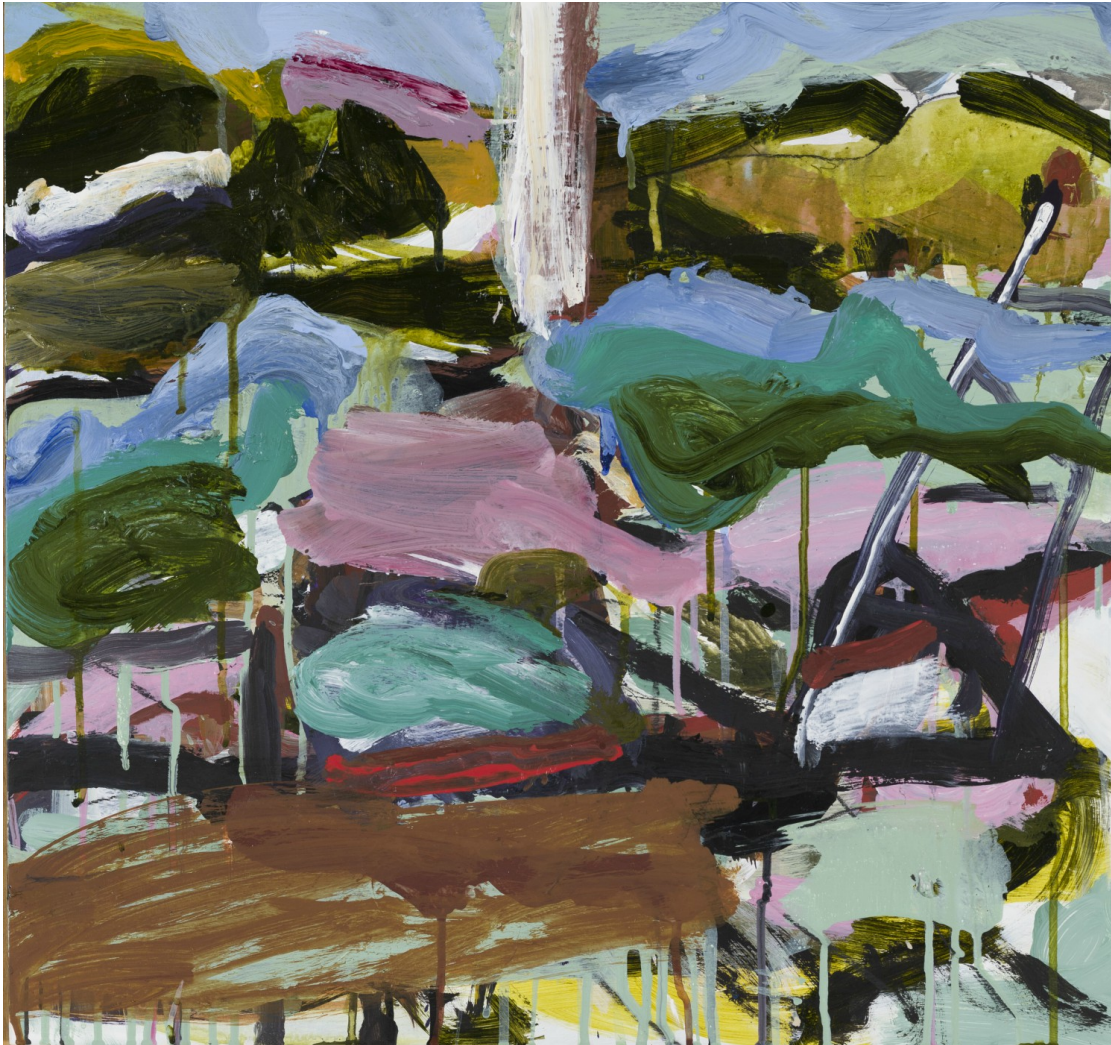
Aspect 2014 Acrylic on board 53 x 56cm