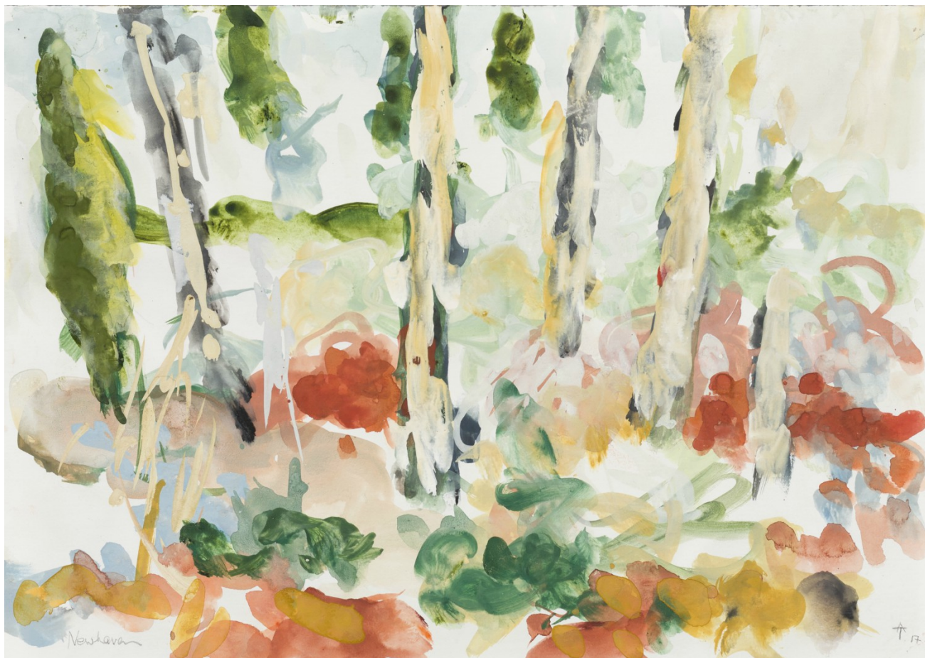
AWC Newhaven Series IX 2018 Goauche on paper 28.5 x 38cm