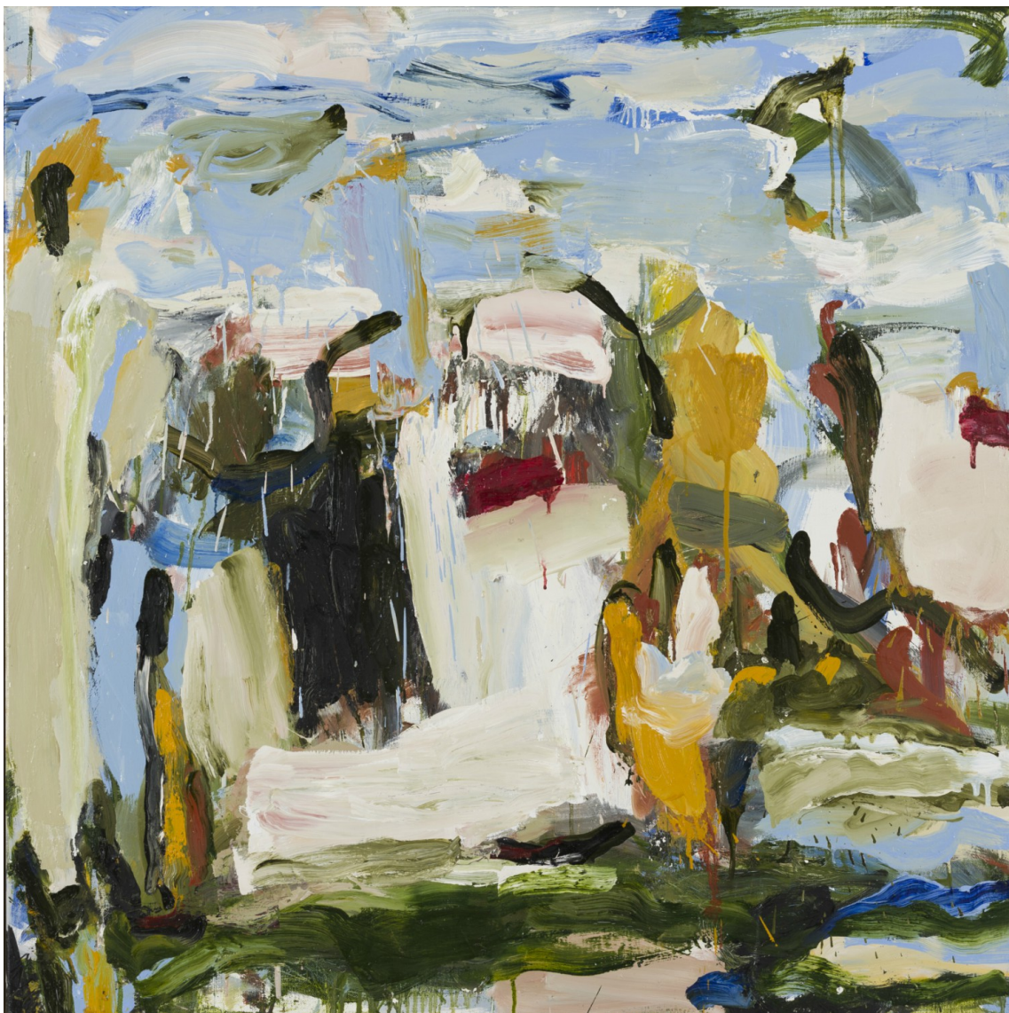
Changing Winds 2013 Oil paint on linen 122 x 122cm