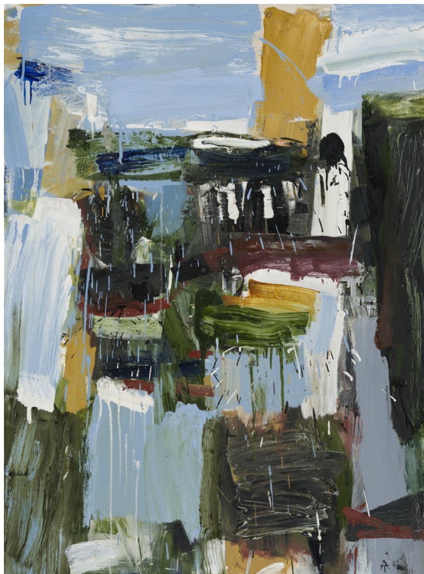
Ocean's Apart 2003 Oil on linen 138 x 102cm