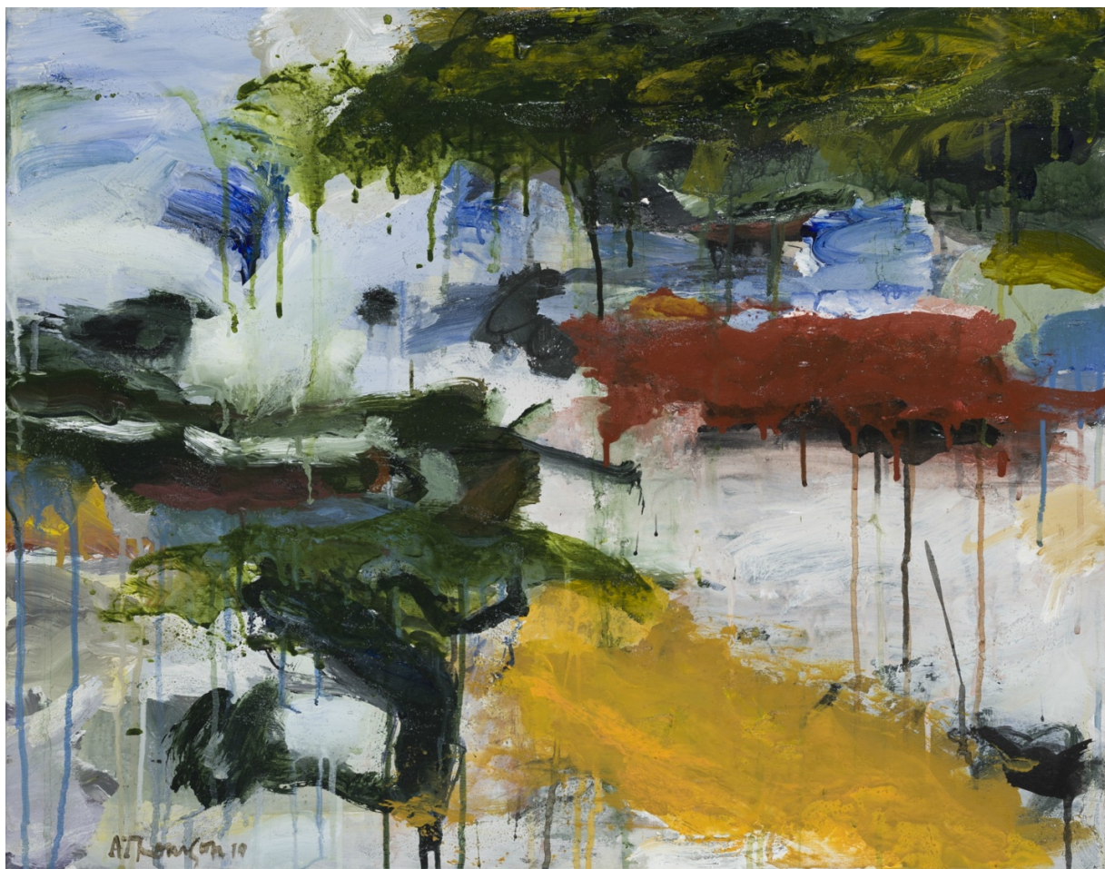
Threshold of light 2010 Oil on linen 56 x 72cm