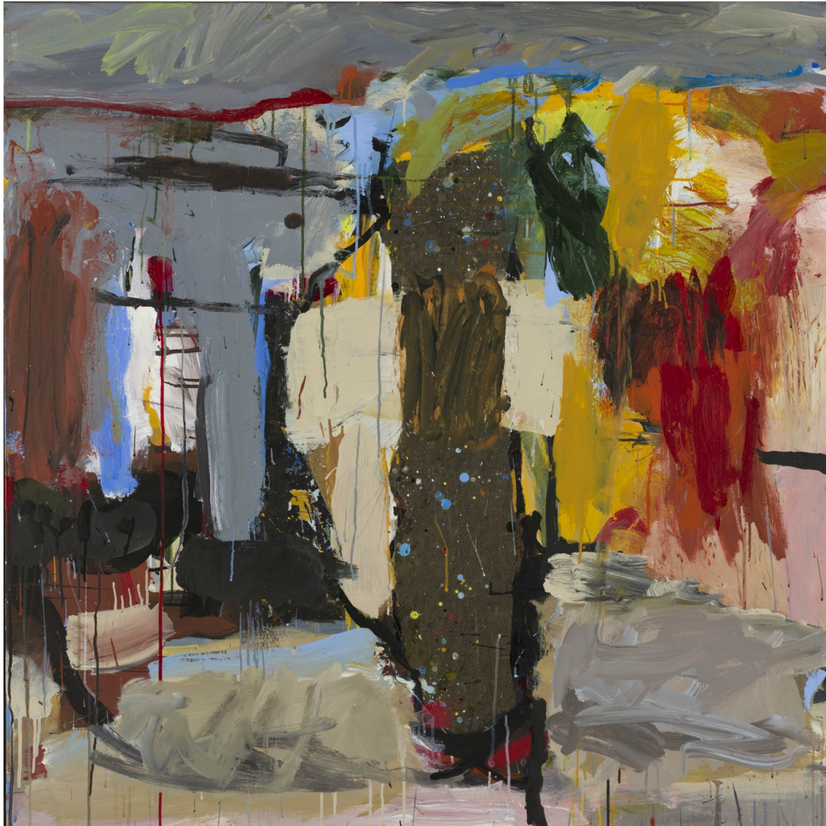
Calypso 2008 Oil paint on linen 122 x 122cm