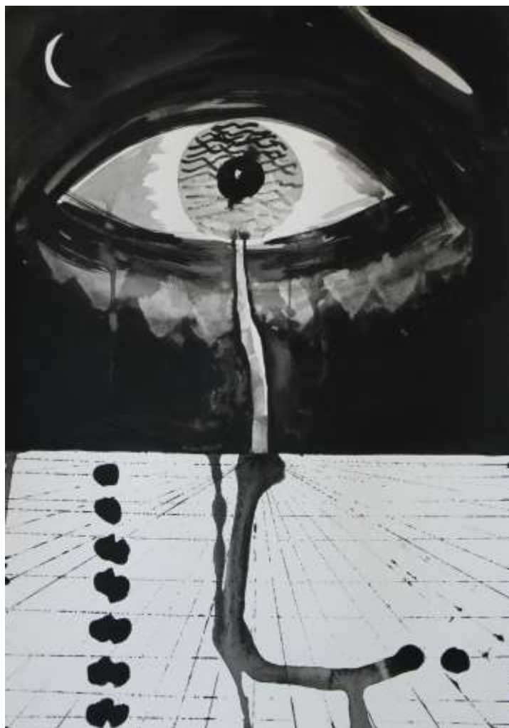
Shaminists don't buy crystals, #33 2019 Ink on rag paper 42 x 29.7cm (paper)