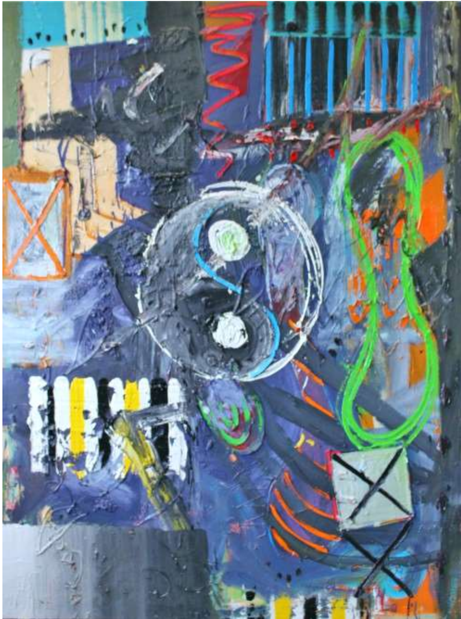
Being Nothing 2018 Oil on canvas 183 x 137cm