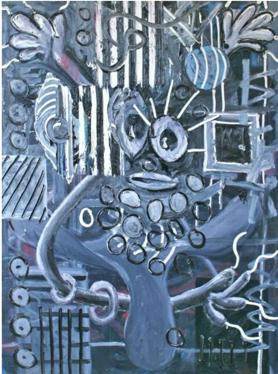
Milk 2018 Oil on canvas 183 x 137cm