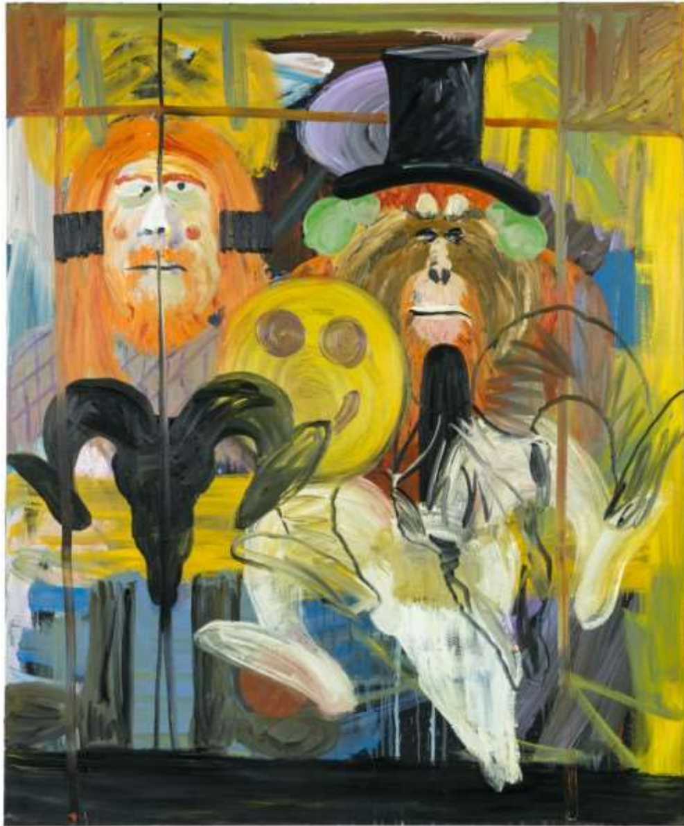
Twins Palmtree Bass Budda 2017 Oil on canvas 183.5 x 152.5 cm