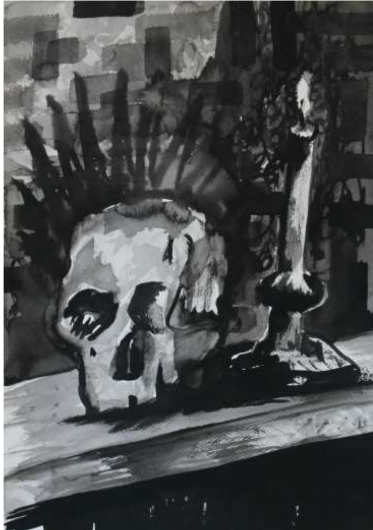
Shaminists don't buy crystals, #34 2019 Ink on rag paper 42 x 29.7cm (paper)