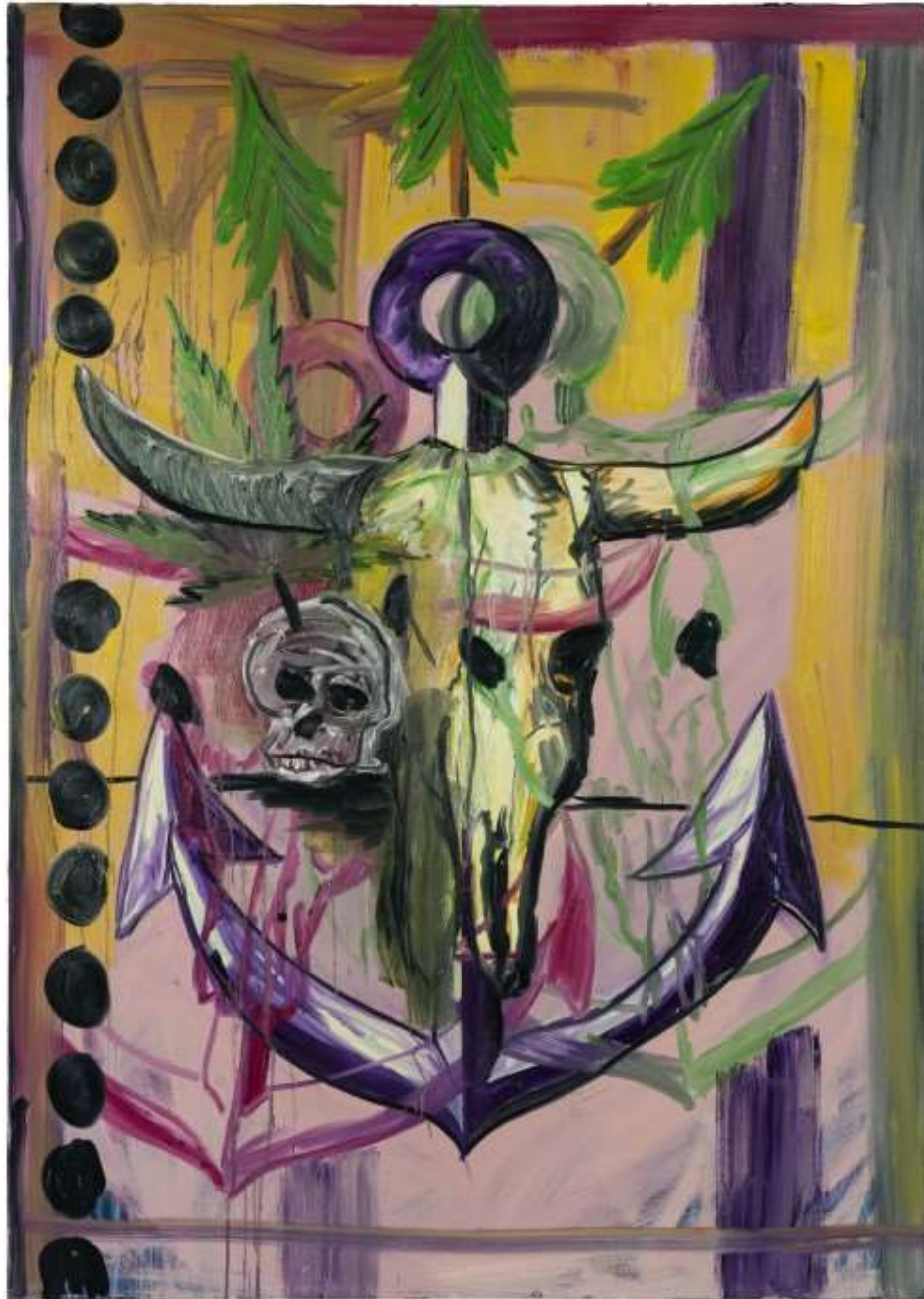
Diaspora is a word, so is holy crap Palmtree Bass Buddha 2017 Oil on canvas 213 x 152 cm