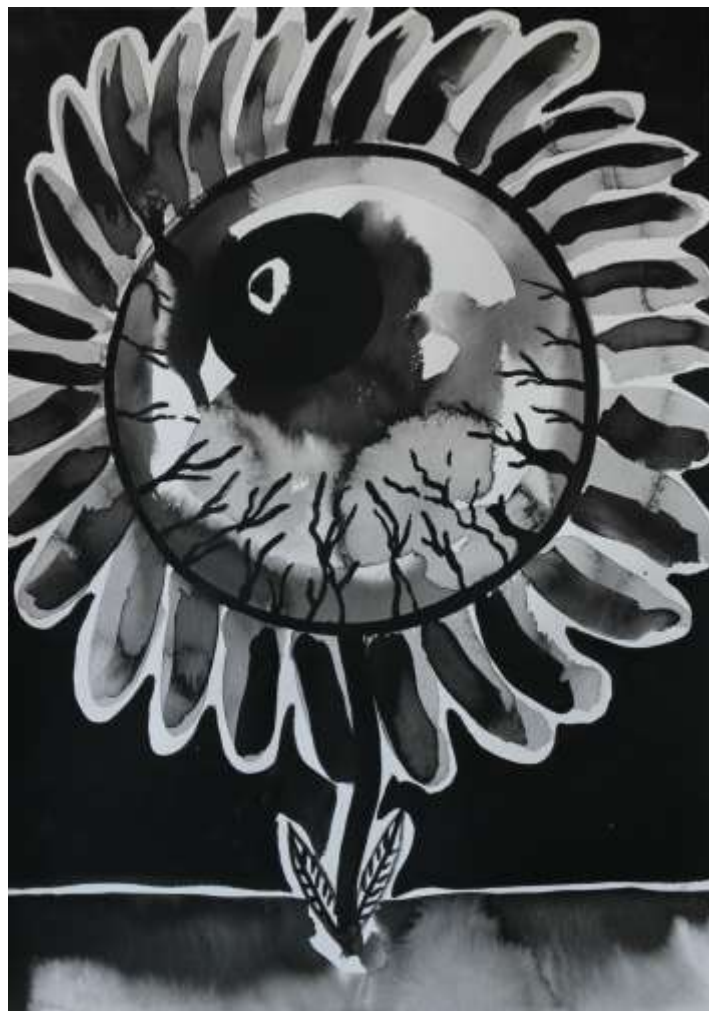
Shaminists don't buy crystals, #31 2019 Ink on rag paper 42 x 29.7cm (paper)