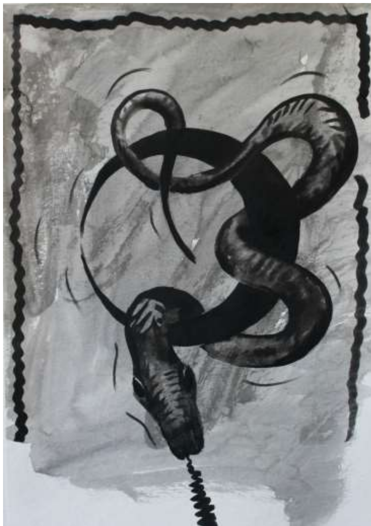
Shaminists don't buy crystals, #30 2019 Ink on rag paper 42 x 29.7cm (paper)