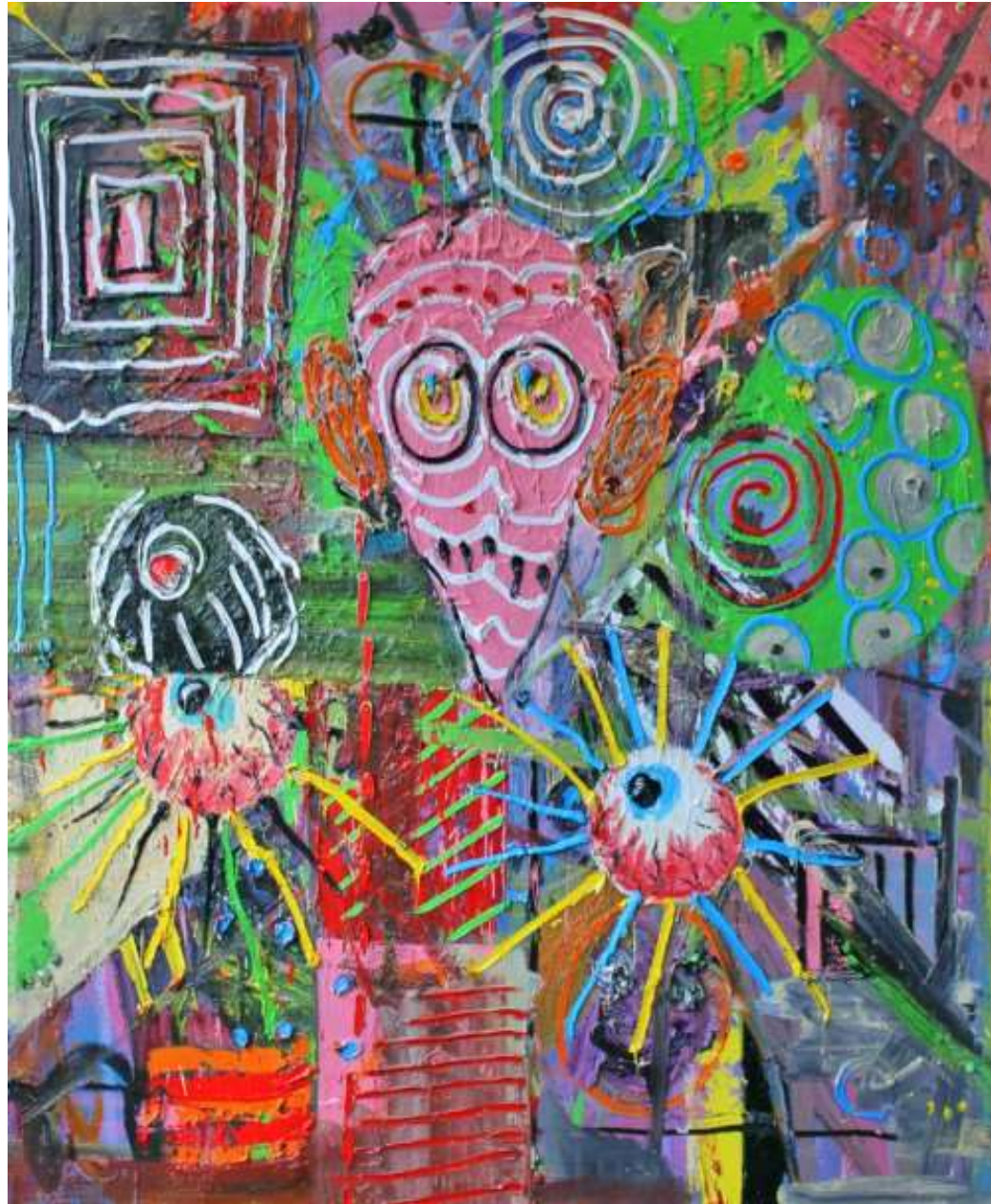
Hegelian Dialectic 2019 Oil on canvas 198.5 x 162.5cm