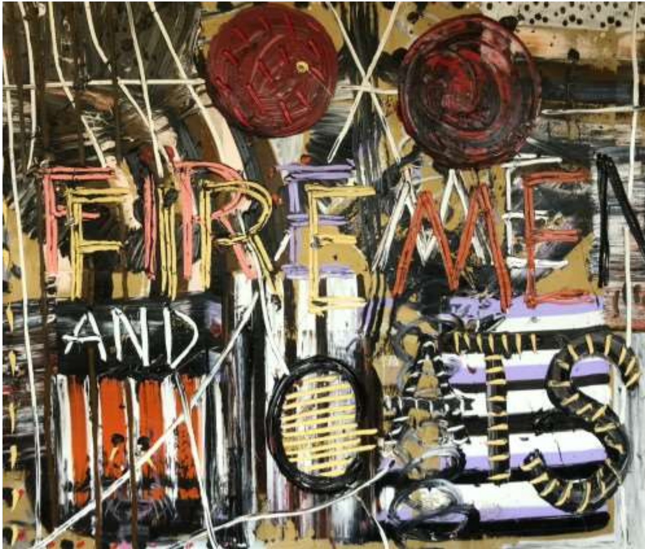
Firemen and cats 2019 Oil on canvas 168 x 198.5cm