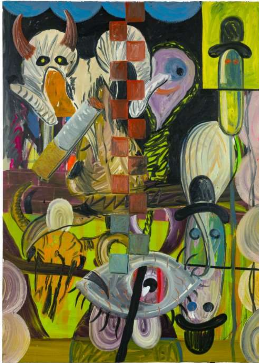
1968 bass kill desert Palmtree Bass Budda 2017 Oil on canvas 214 x 152 cm