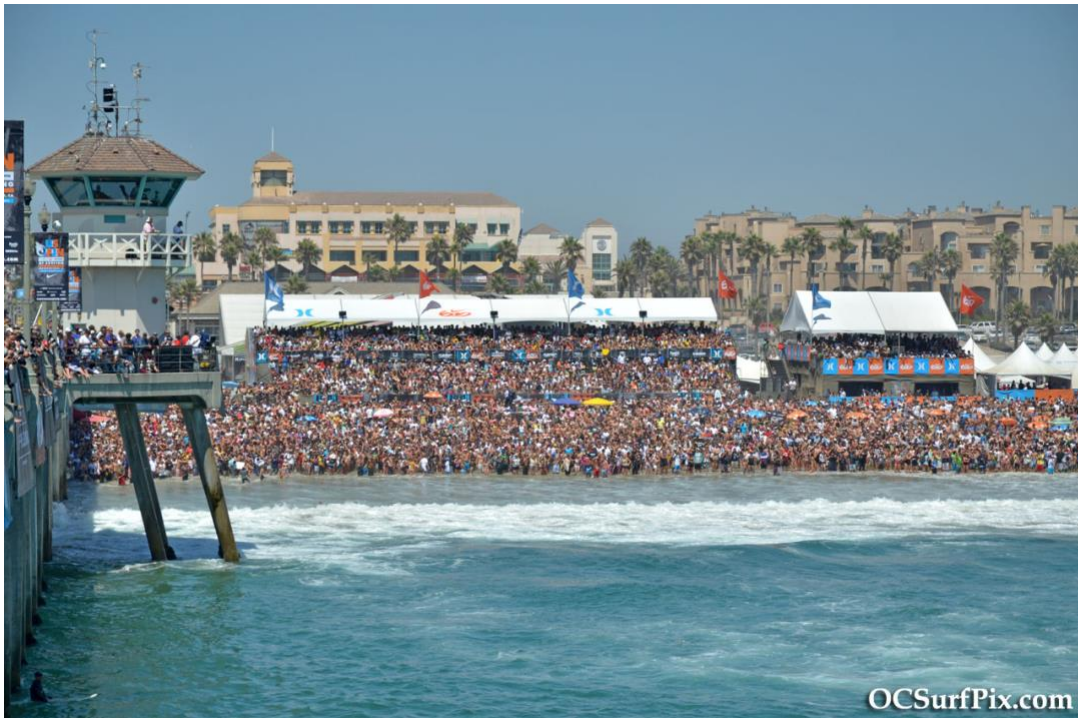
2021 US Open of Surfing, Huntington Beach - Griffin Colapinto of San Clemente