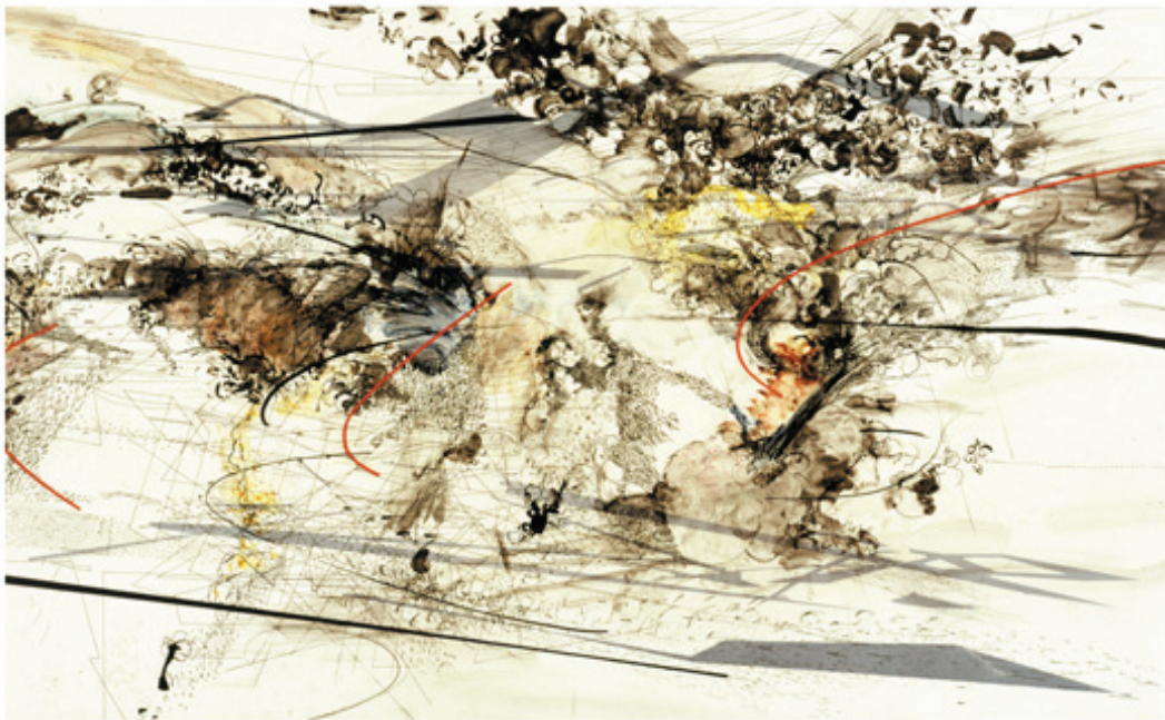
Top: Steve McQueen, Deadpan , 1997, still from a black-and-white film in 16 mm, 4 minutes 35 seconds. Bottom: Julie Mehretu, Excerpt (riot) , 2003, ink and acrylic on canvas, 32 x 54".

IT'S HARD TO LEAVE YOUR BODY BEHIND, ESPECIALLY WHEN YOUR BODY IS ALWAYS BEING THROWN UP IN YOUR FACE. BUT BEING HEAVY IS A MOTHERFUCKER.