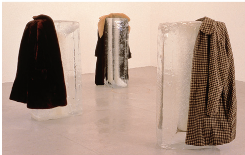
Top: David Hammons, Global Fax Festival , 2000. Installation view, Palacio de Cristal, Madrid, 2000. Bottom: David Hammons, Cold Shoulder , 1990. Installation view, Jack Tilton Gallery, New York, 1990.

on the wall? Or Traveling , 2002, a drawing made by bouncing a basketball covered in Harlem dirt on a piece of paper with a suitcase stuck behind the frame pushing the drawing off the wall: playground virtuosity, nomadism, performance art, and Rauschenberg's tire print, all elegantly rolled into one? Also, it would be a misreading of Hammons's project to describe it as a linear movement toward dematerialization, for that doesn't take into consideration earlier pieces like Cold Shoulder , 1990, giant blocks of ice with coats thrown over them, or Blizzard Ball Sale , 1983, where the artist sold snowballs on the streets of New York, or more recent pieces like Global Fax Festival , 2000, an empty exhibition hall with ceiling-mounted machines spewing faxes, or his Flashlight Drawing , 2000, which records the movement of a flashlight in a darkened room. Process, ephemerality, and transformation have always been part of Hammons's work. In a word: Lightness.