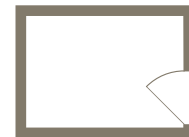
PRIVATE STORAGE UNIT 7'-2" x 9'-8"