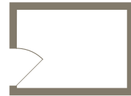
PRIVATE STORAGE UNIT 7'-2" x 9'-8"