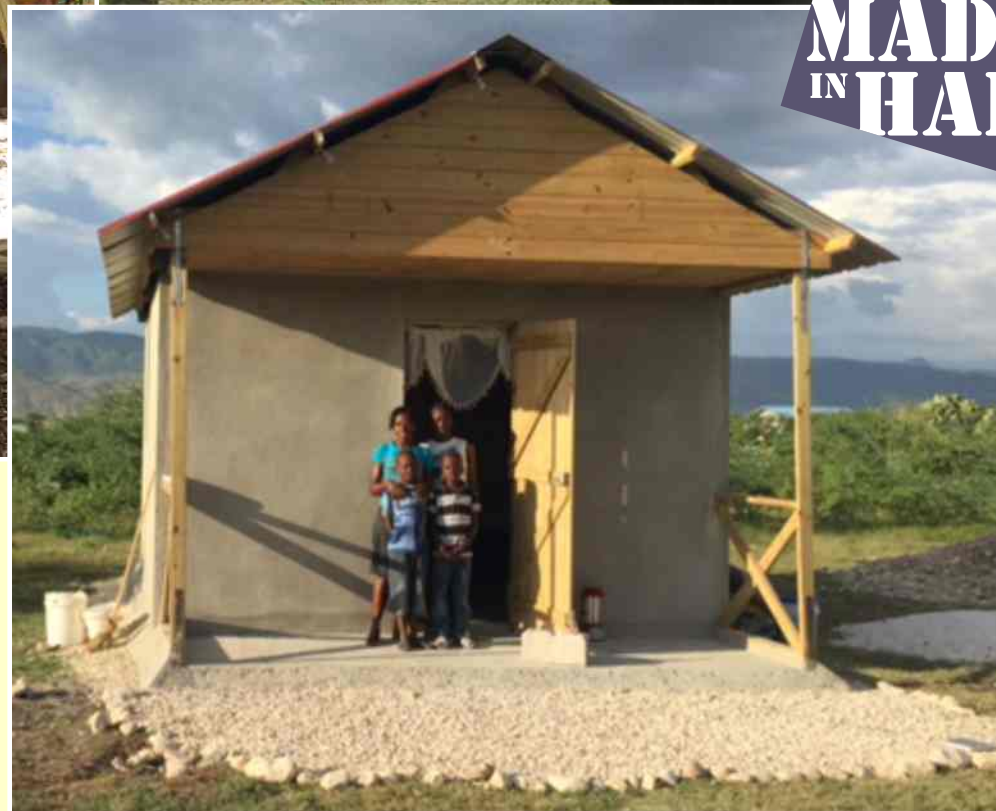
option shown: Cement Stucco