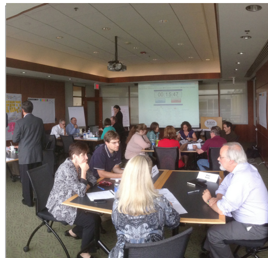
“DAY IN THE LIFE” WORKSHOP

This process culminated in a design brief that mapped out the vision, requirements, and strategies for the new building—one that features first-rate amenities in a flexible, collaborative environment for learning and research. By offering varied places to work, meet, and learn, this design should promote productivity, inspire useful interactions, and enhance quality of life. The design is also adaptable enough to support the growth of the School and its programs. The David Tepper Quadrangle will open in Fall 2018.