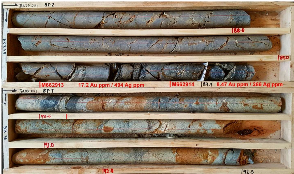
Drill core from BADD001.

In detail, the recent drilling has shown that the Bauch vein structure occurs on the contact between two volcanic rock types; a hanging wall andesite and a footwall dacite. Both units are strongly altered and show multiple zones of brecciation and quartz stockwork veining.