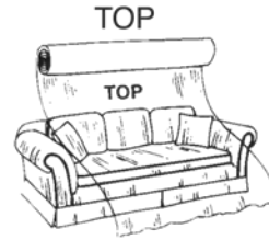
"Up the Bolt" or "Top Right"

PLEASE COMPLETE THIS FORM AND INCLUDE WITH YOUR PURCHASE ORDER OR WITH THE FABRIC ITSELF. YOUR ORDER WILL NOT BE ACKNOWLEDGED WITHOUT RECEIPT OF FORM AND FABRIC.